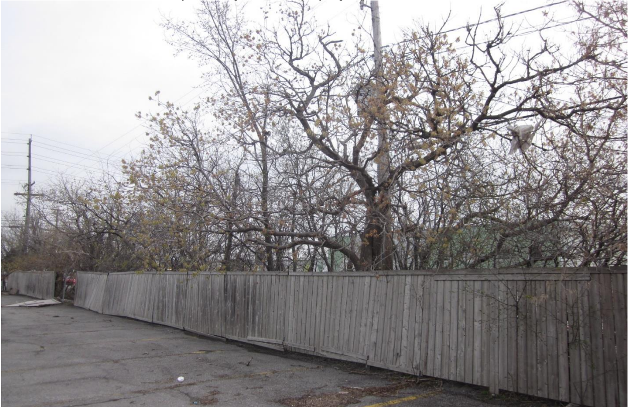
Picture 6. Tree grouping #14, Manitoba maple and white elm on City of Ottawa property adjacent to 1531 St. Laurent Boulevard