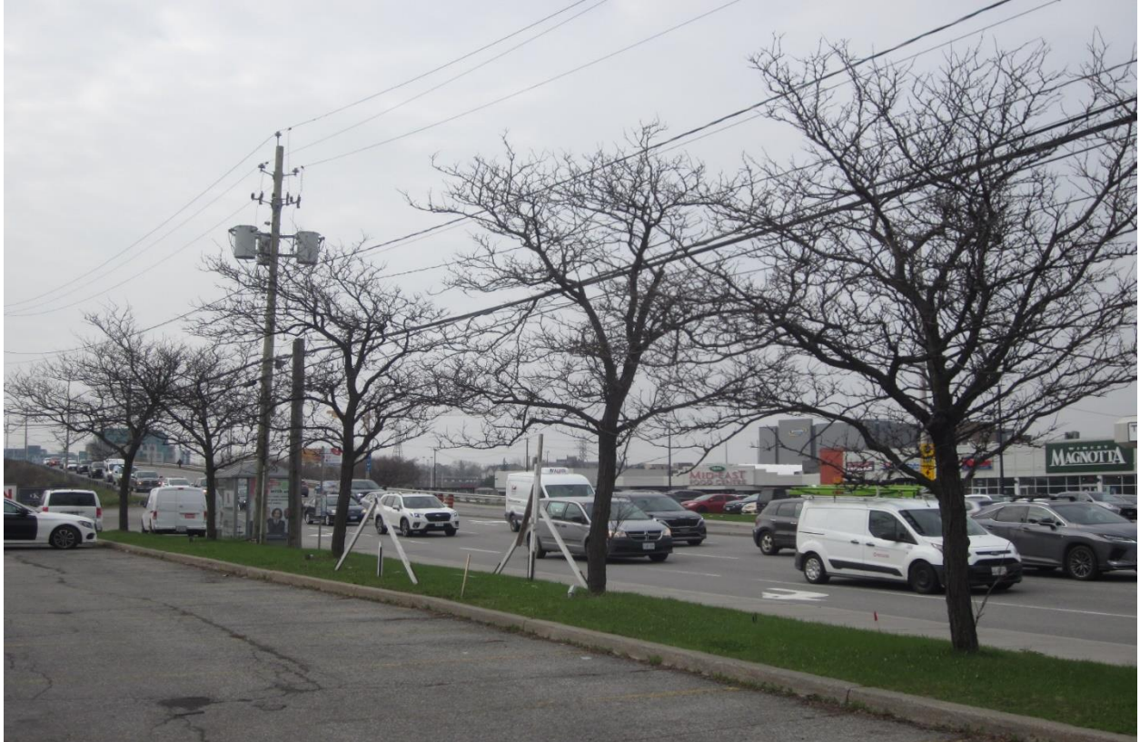
Picture 2. Trees #2-6, honey-locusts located on City of Ottawa property adjacent to 1531 St. Laurent Boulevard