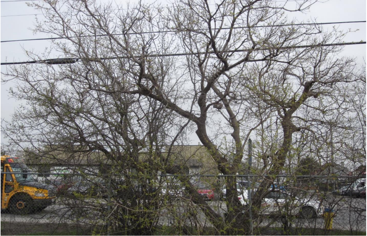
Picture 5. Tree #13, Manitoba maple on City of Ottawa property adjacent to 1531 St. Laurent Boulevard