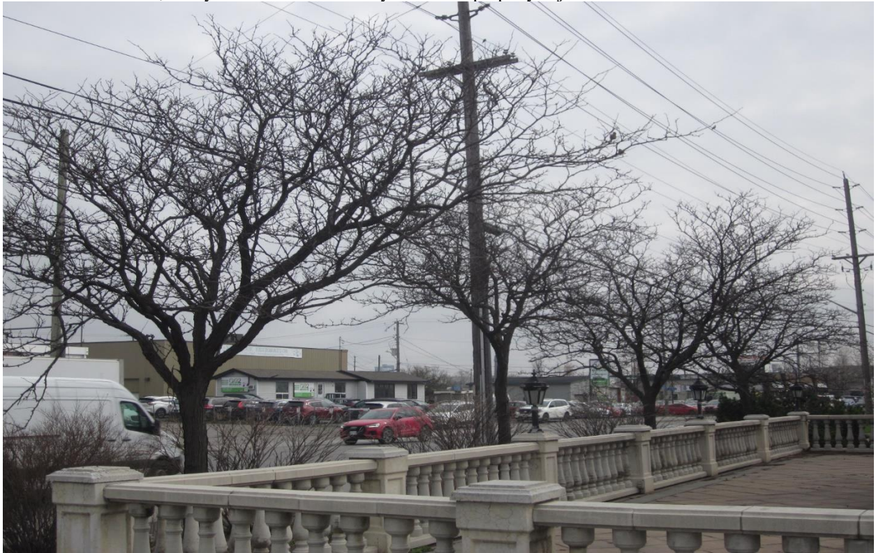
Picture 3. Trees #7-10, honey-locusts located on City of Ottawa property adjacent to 1531 St. Laurent Boulevard