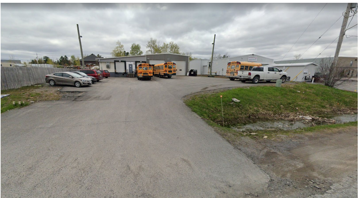
Figure 2: street view of the property.