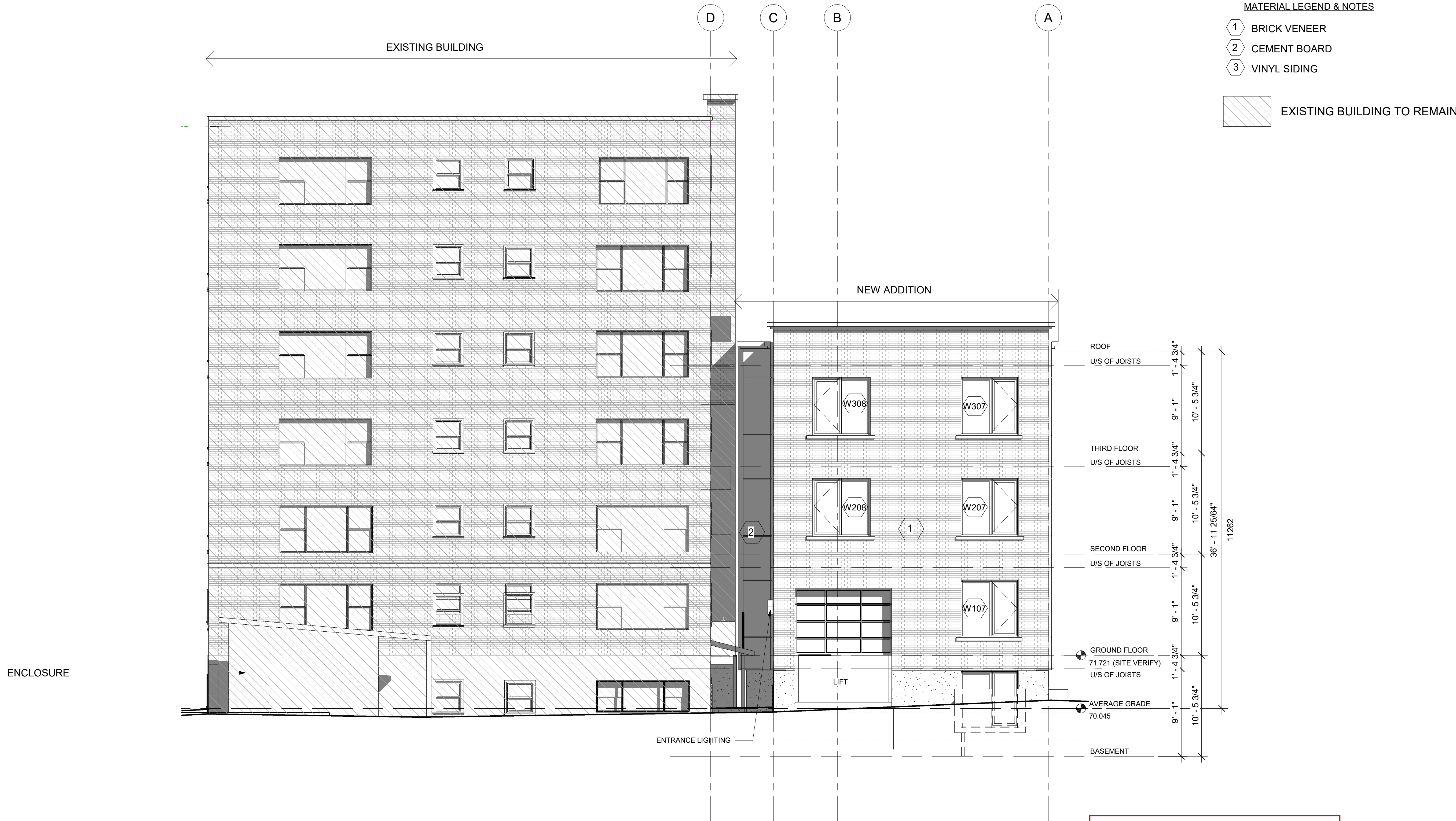
1 Rear ( South) Elevation 3/16" = 1'-0"