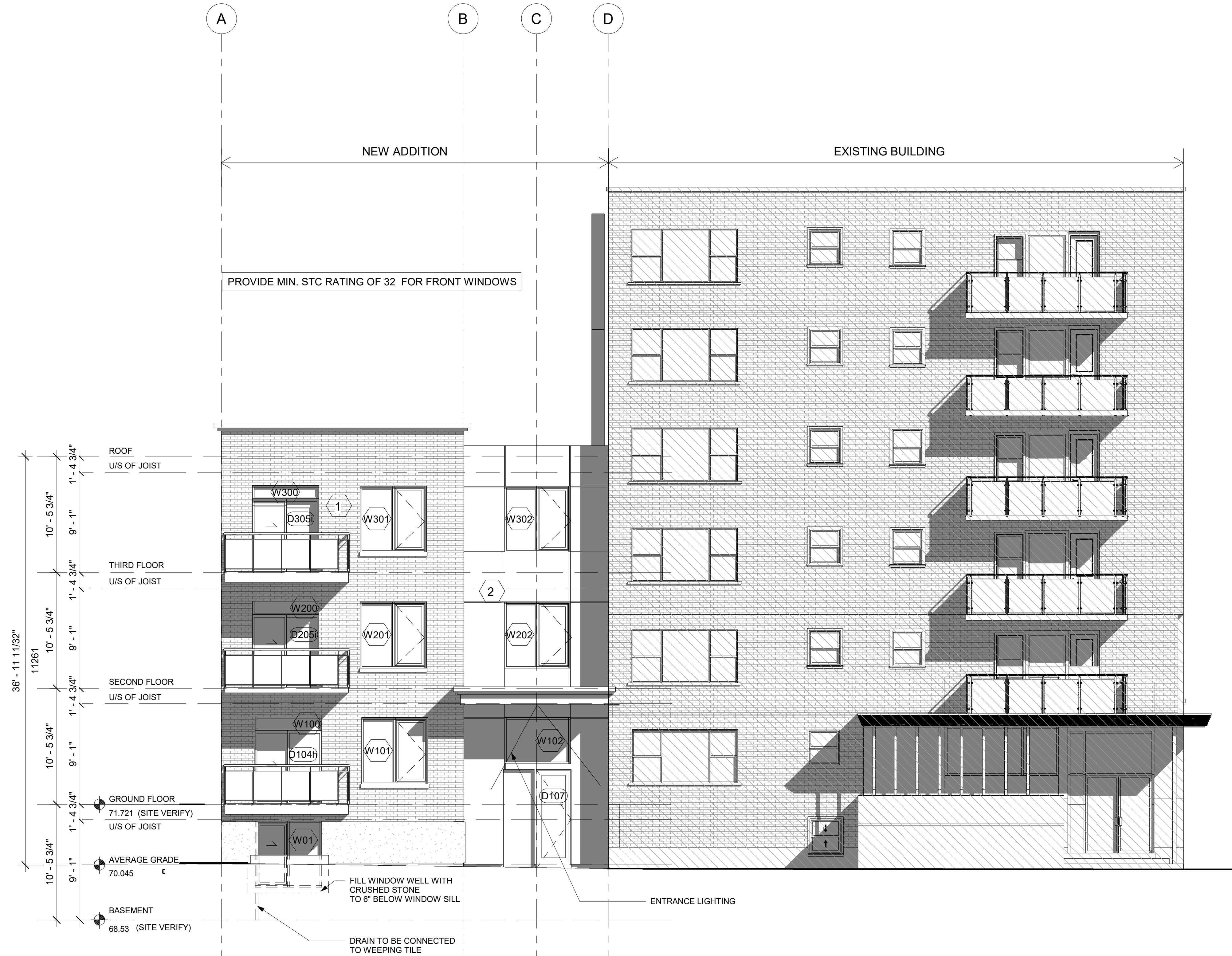
1 Front (North) Elevation 3/16" = 1'-0"

By Andrew McCreight at 8:30 am, May 30, 2023