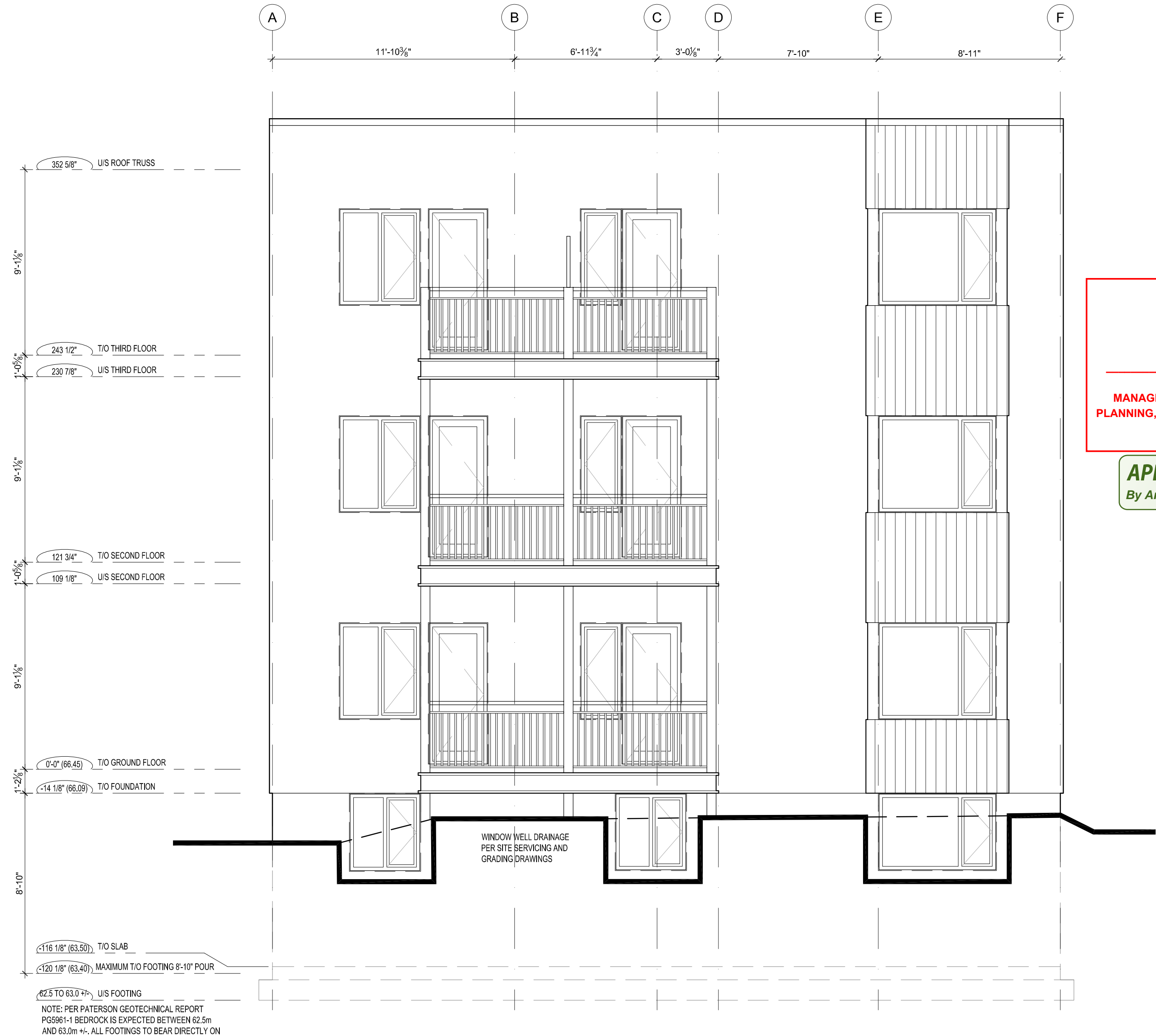
1 LEFT ELEVATION A2.2 SCALE: 1/4"=1'-0"