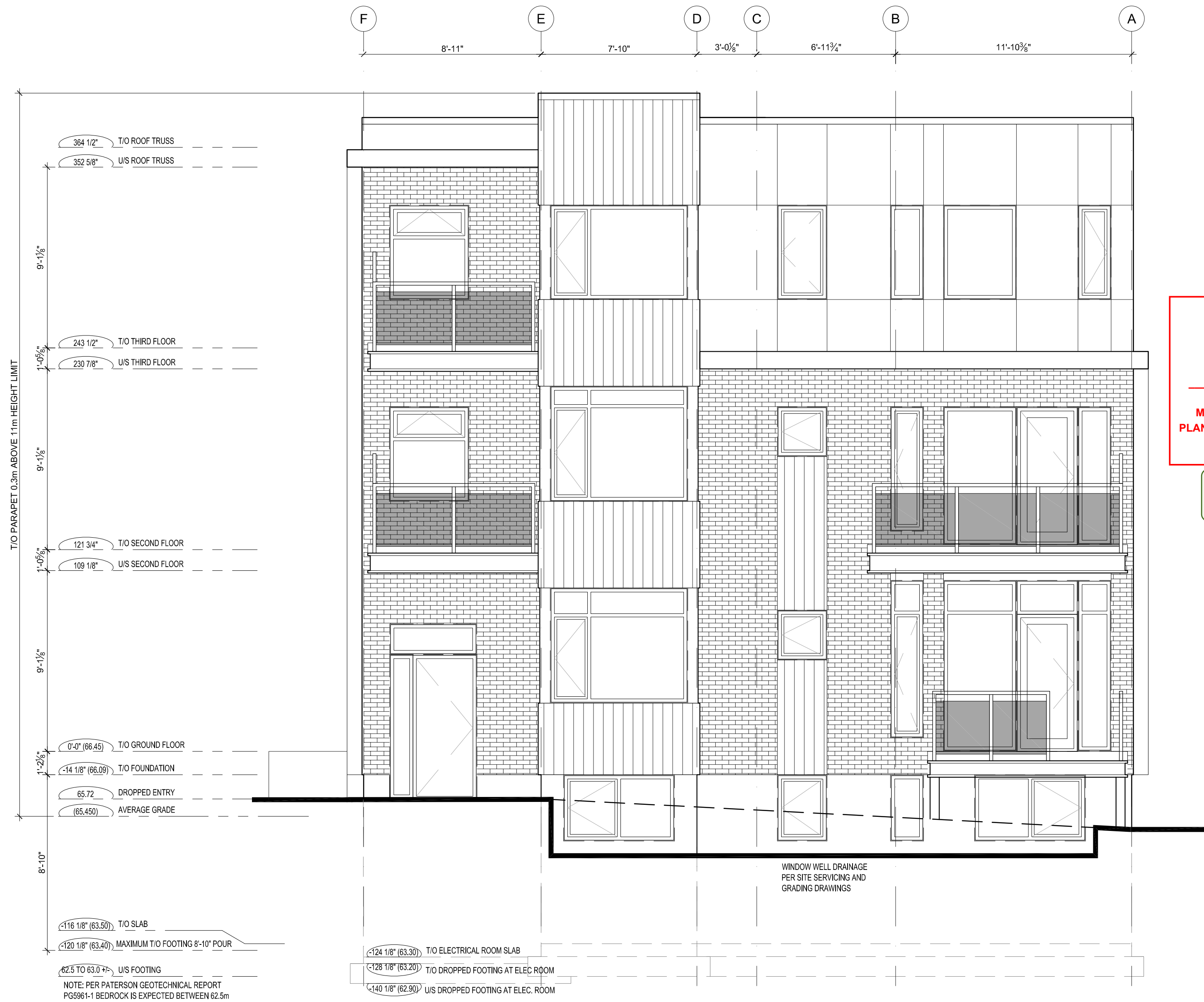
1 FRONT ELEVATION A2.1 SCALE: 1/4"=1'-0"