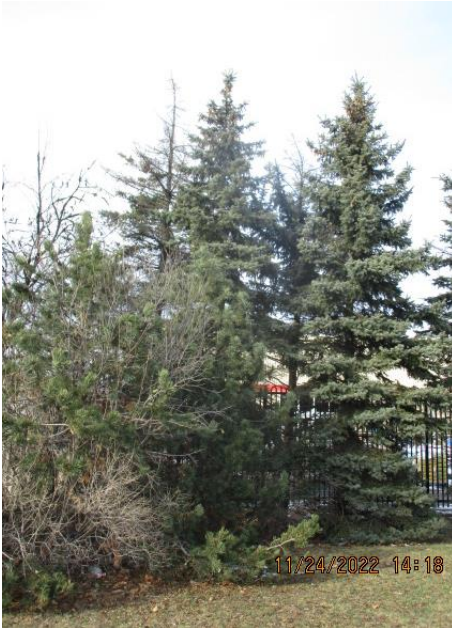
Trees 68 to 71 – Colorado Spruce