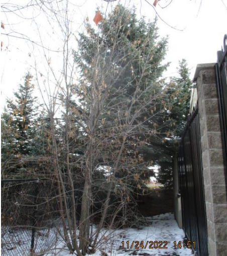
Tree 88 – Green Ash with 87 to south