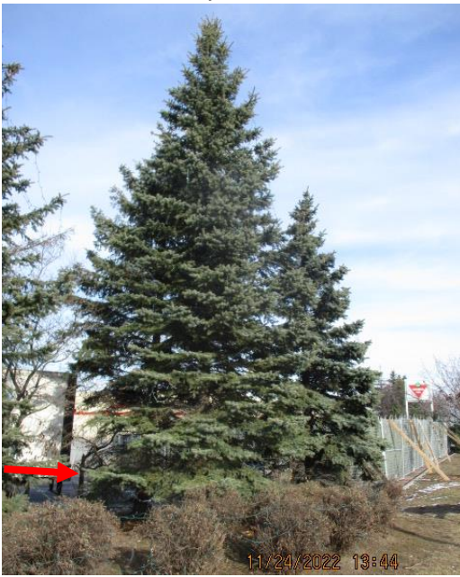
Tree 54 – Amur Maple