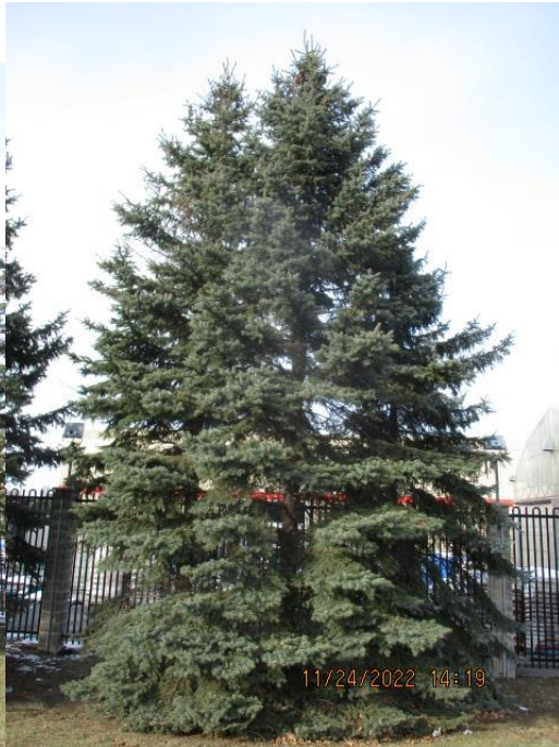
Trees 72 to 74 – Colorado Spruce