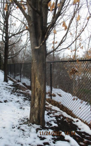
Tree 90 – trunk wound