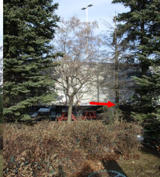
Tree 50 – dead Spruce