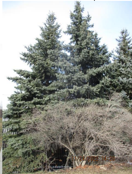
Trees 82 to 85 – Colorado Spruce