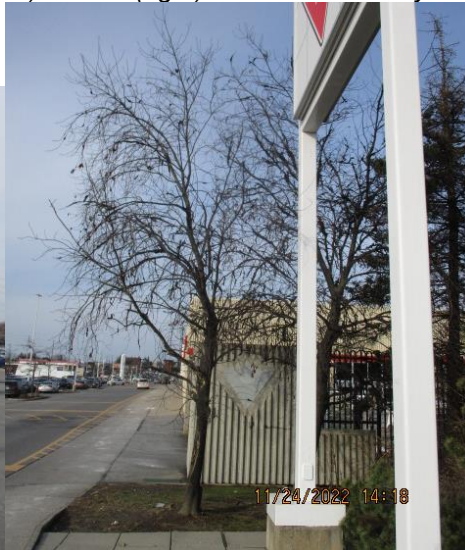
Trees 66 (left) to 68 (right)