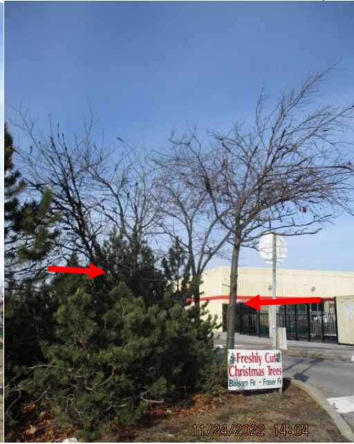
Trees 62(left) and 63 (right) – Schubert Cherry