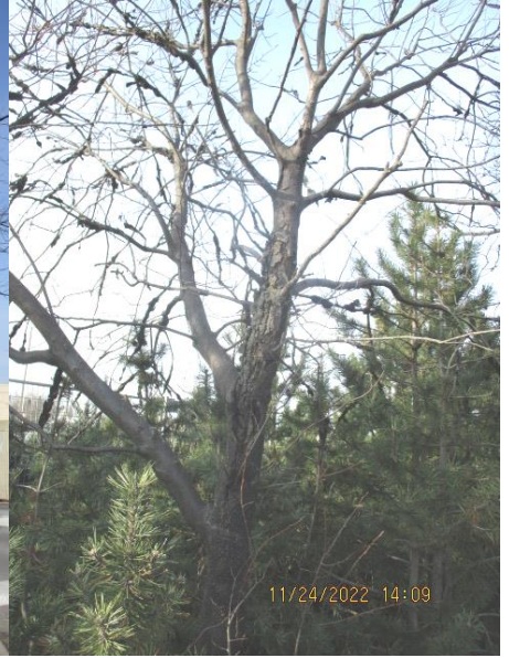
Tree 62 – Canker on trunk