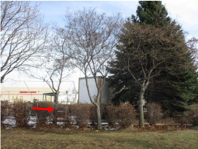
Tree 42 – Amur Maple