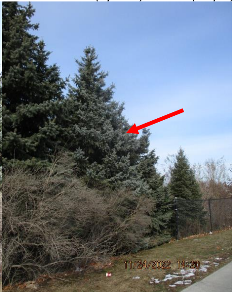
Tree 86 – Colorado Spruce