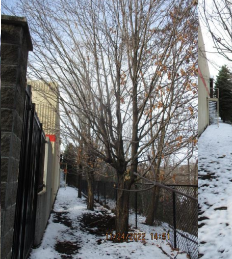
Trees 89, 90 and 91 – Sugar Maple