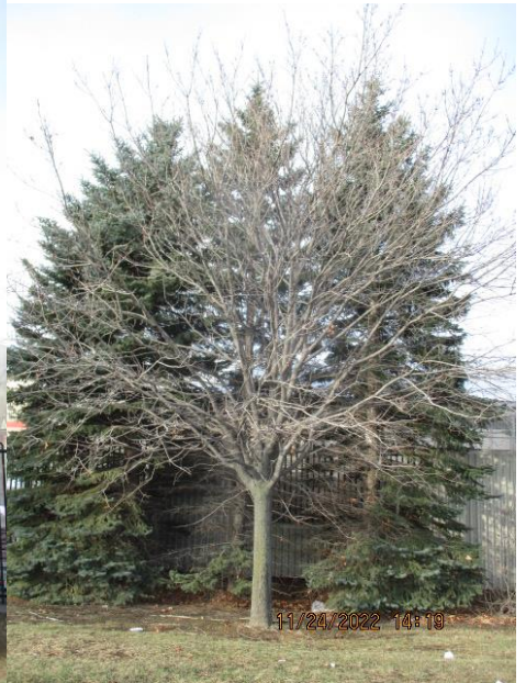
Trees 75 to 78 (Spruce) and 79 (Maple)