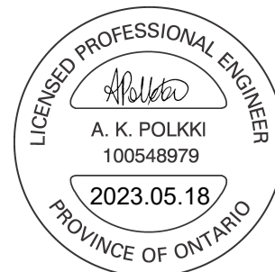
Structural Engineer's Seal

Practitioner's Name: Alaina Polkki Firm: RJC Engineers Phone#: 613-714-7000 City: Ottawa Province: Ontario