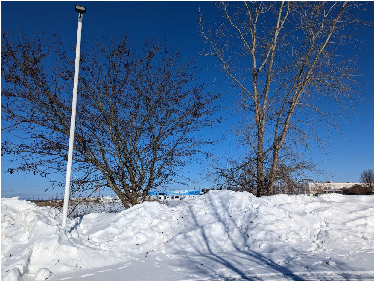
Figure 1 - Tree 1, balsam poplar (right) and Tree 2, honey locust (left)