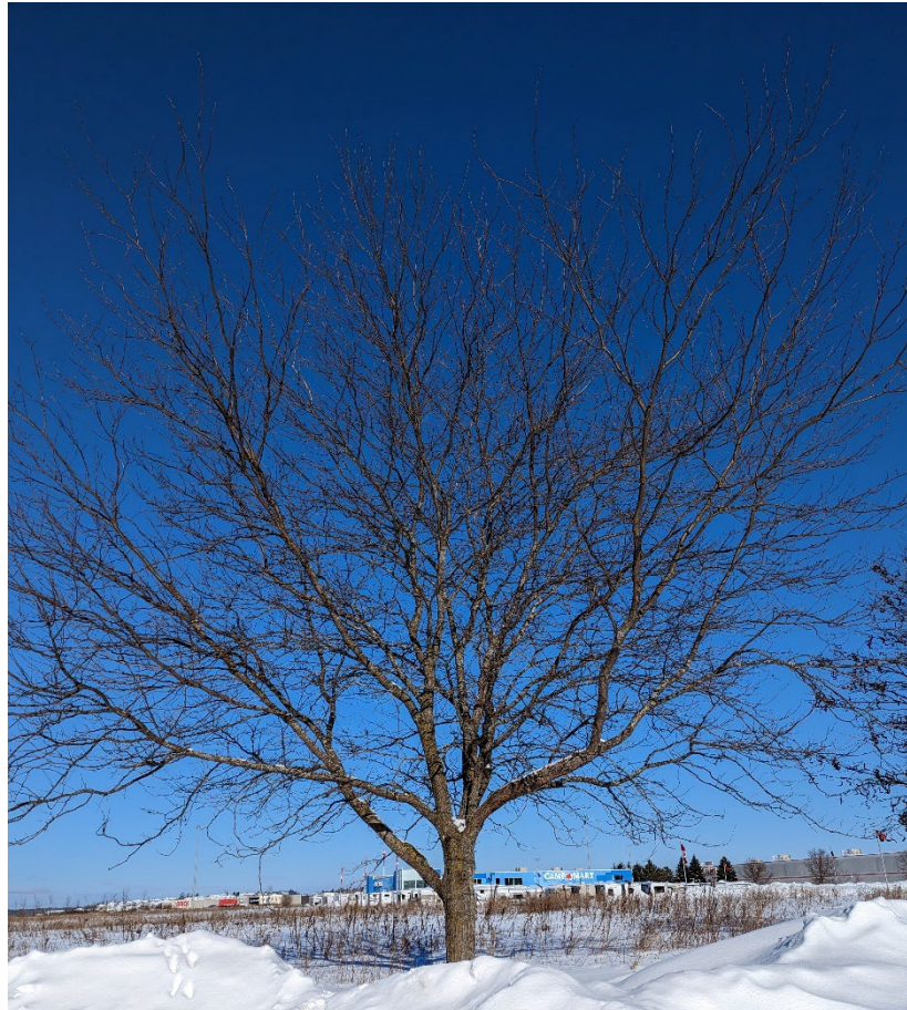
Figure 3 - Tree 4, honey locust