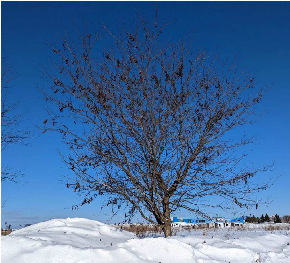
Figure 2 - Tree 3, honey locust