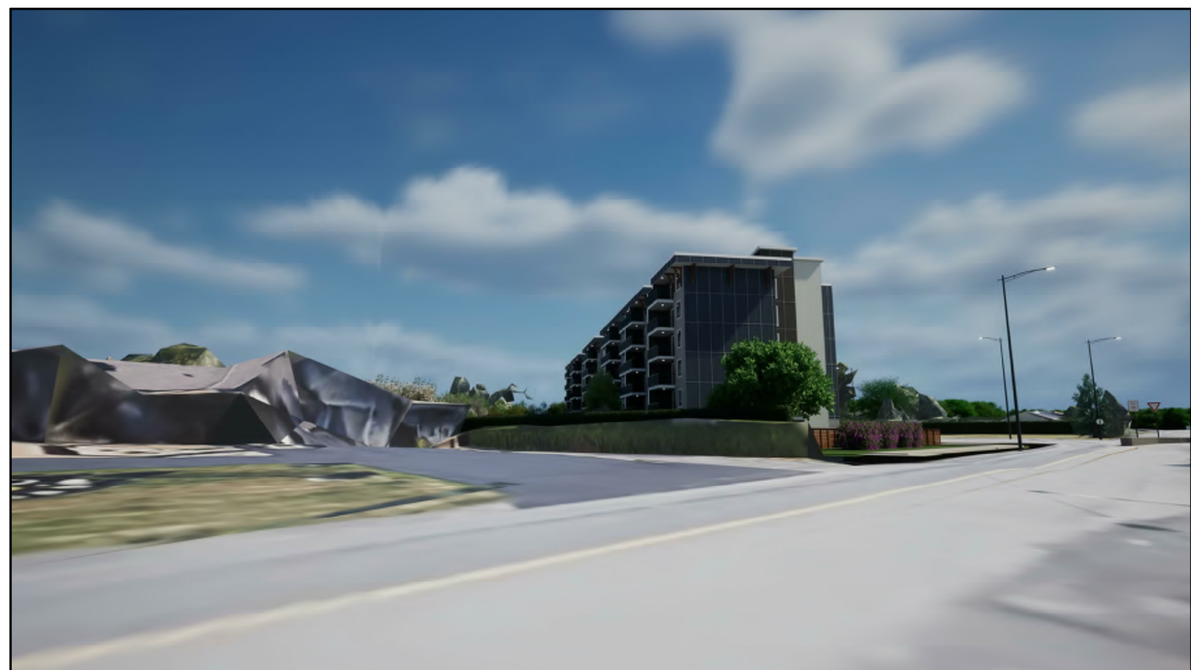
(3) NORTH - WEST VIEW