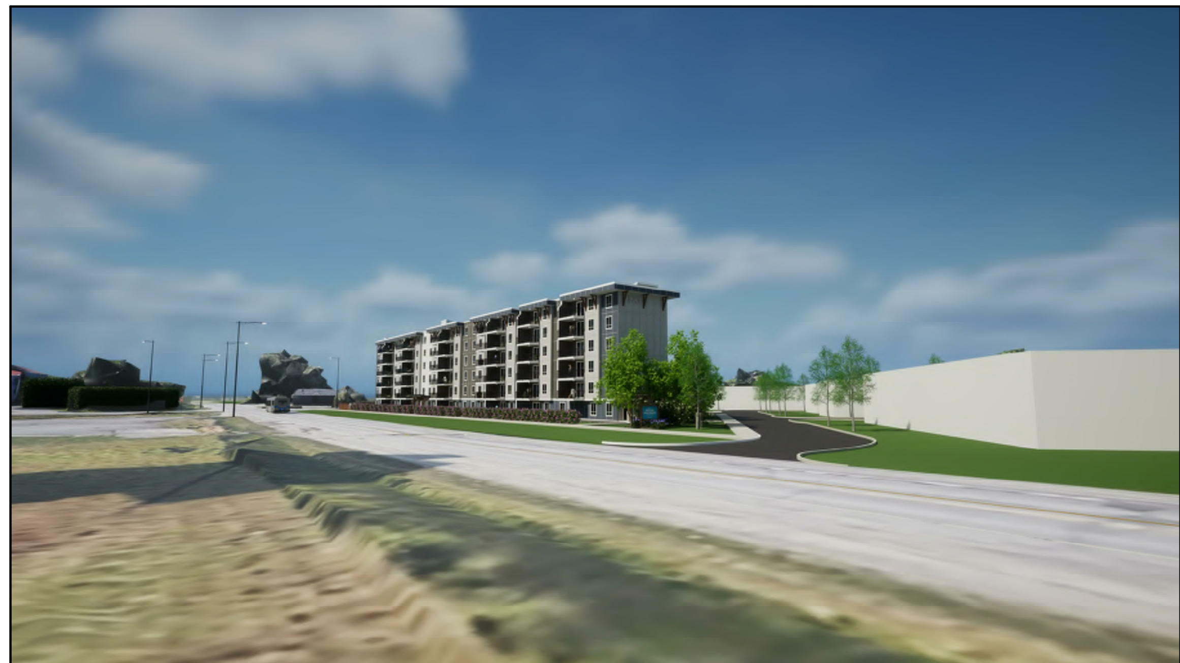
(2) SOUTH - EAST VIEW