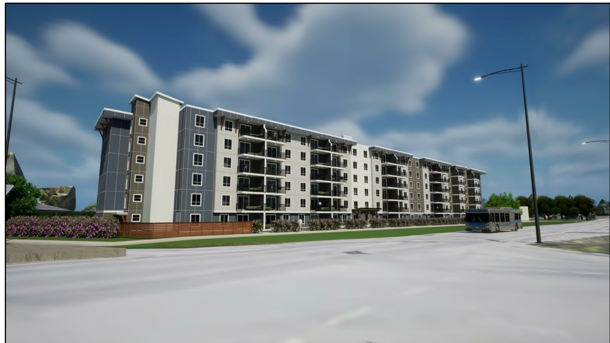
(1) SOUTH - WEST VIEW