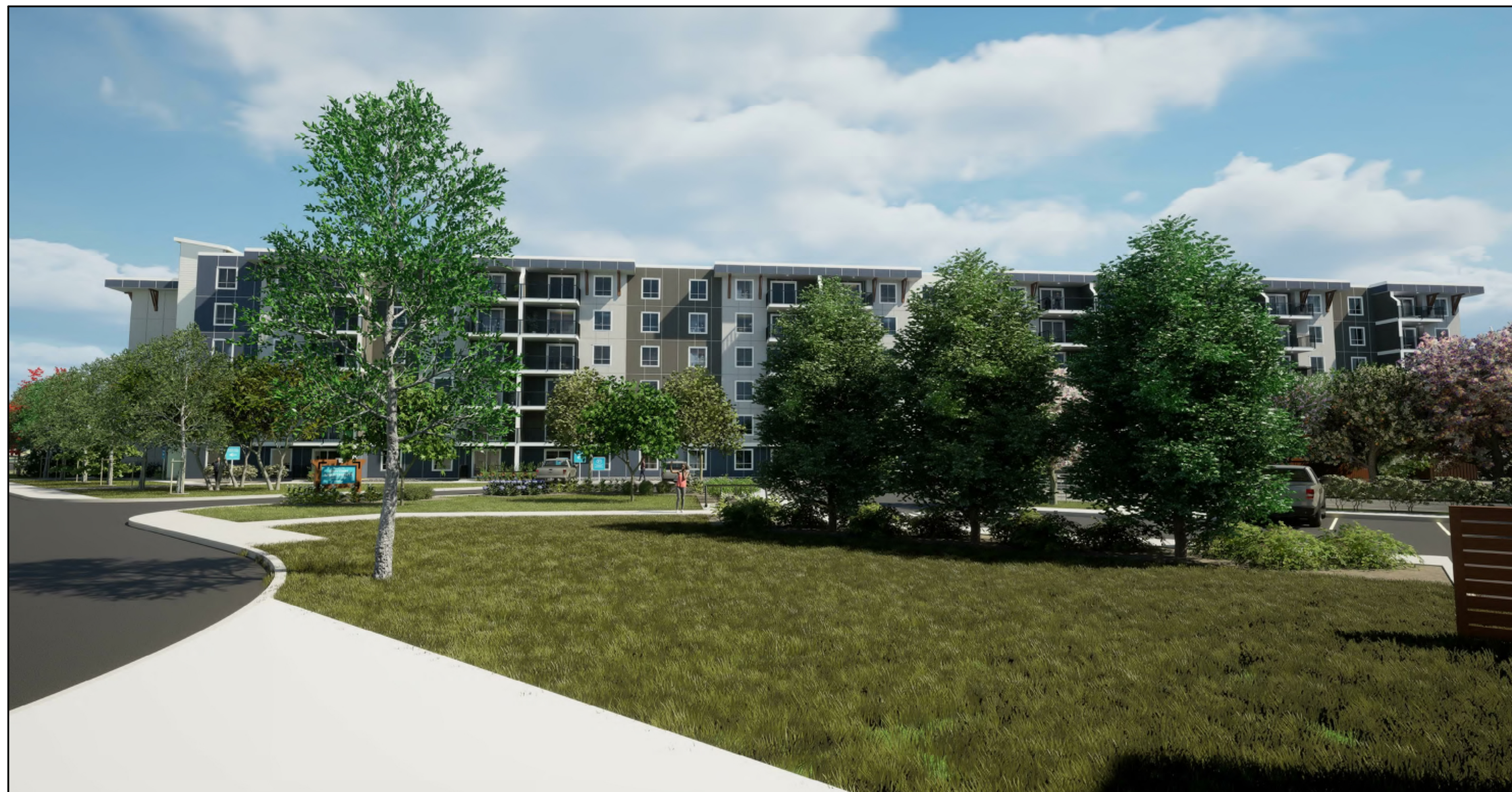
(2) NORTH VIEW LANDSCAPE AREA