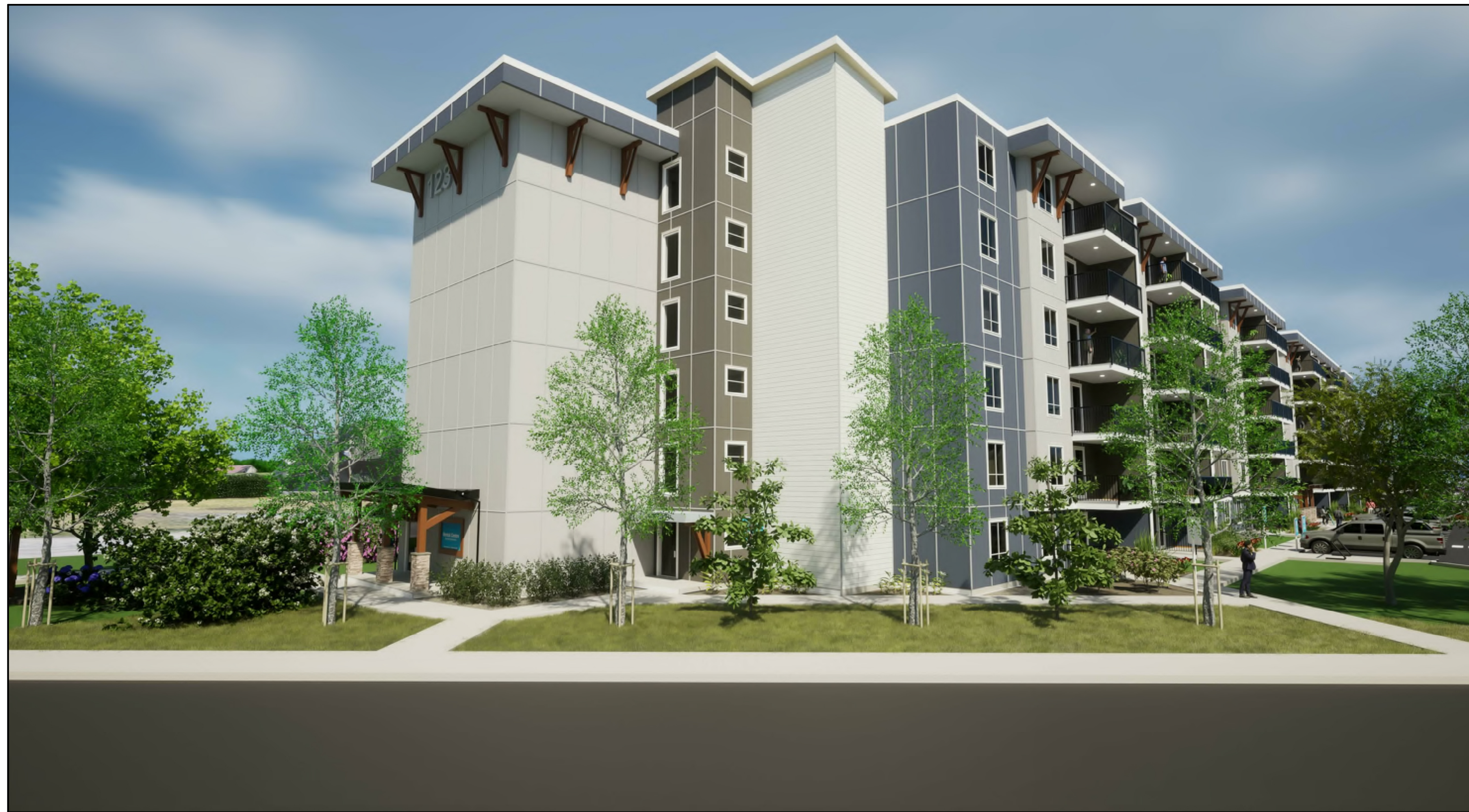
(1) EAST VIEW BUILDING CORNER ENTRANCE