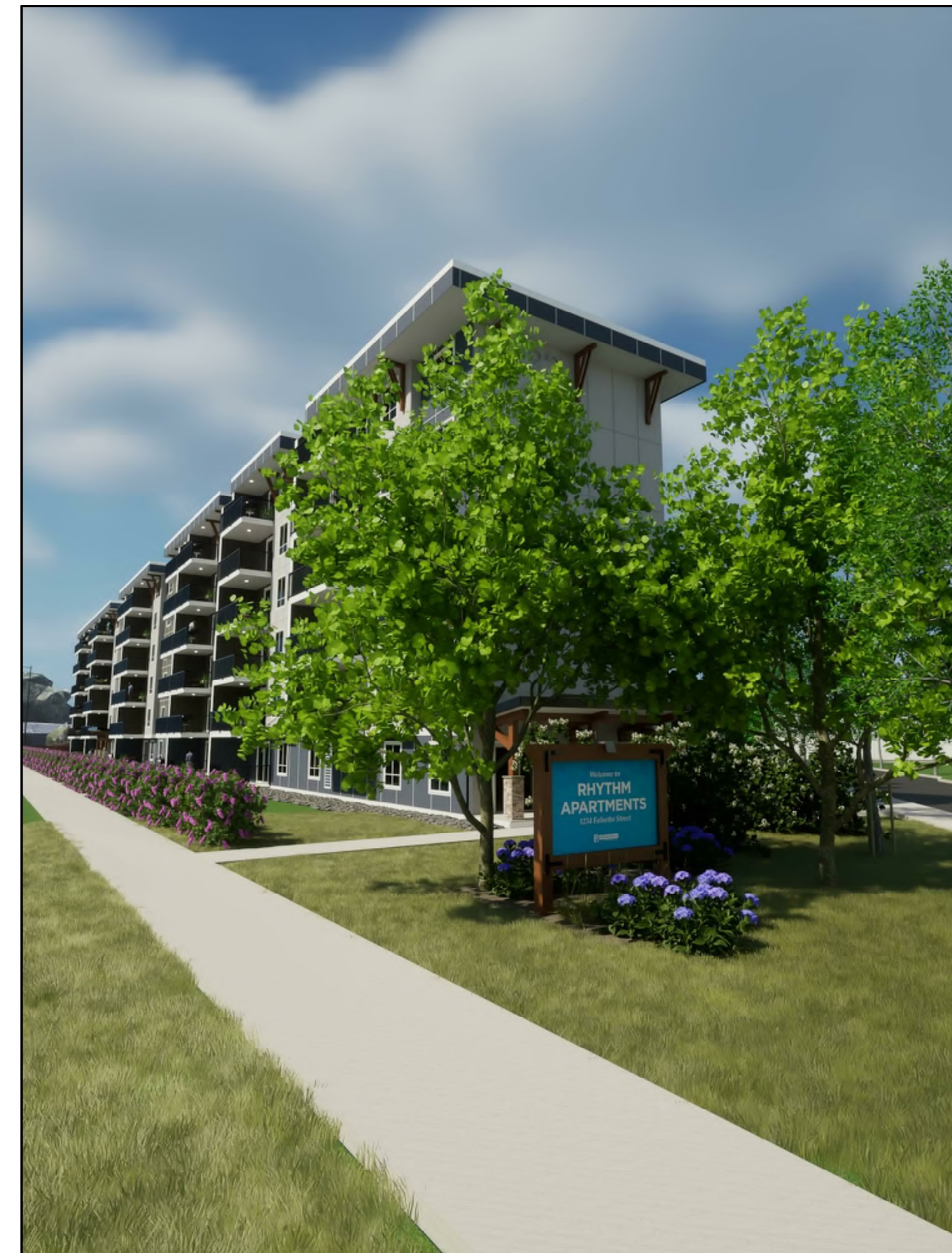
(3) EAST VIEW BUILDING CORNER