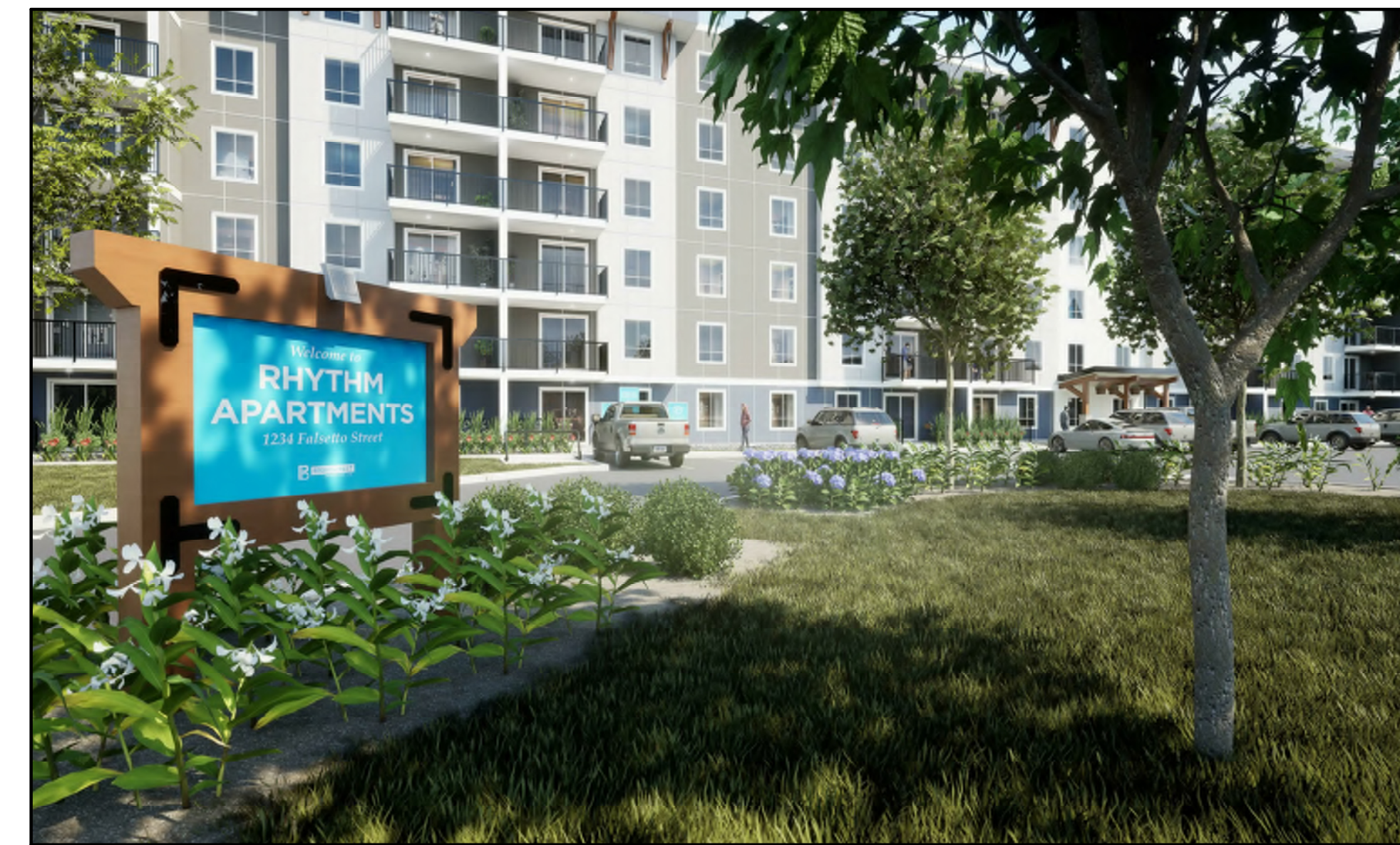
(4) SITE ENTRANCE SIGN