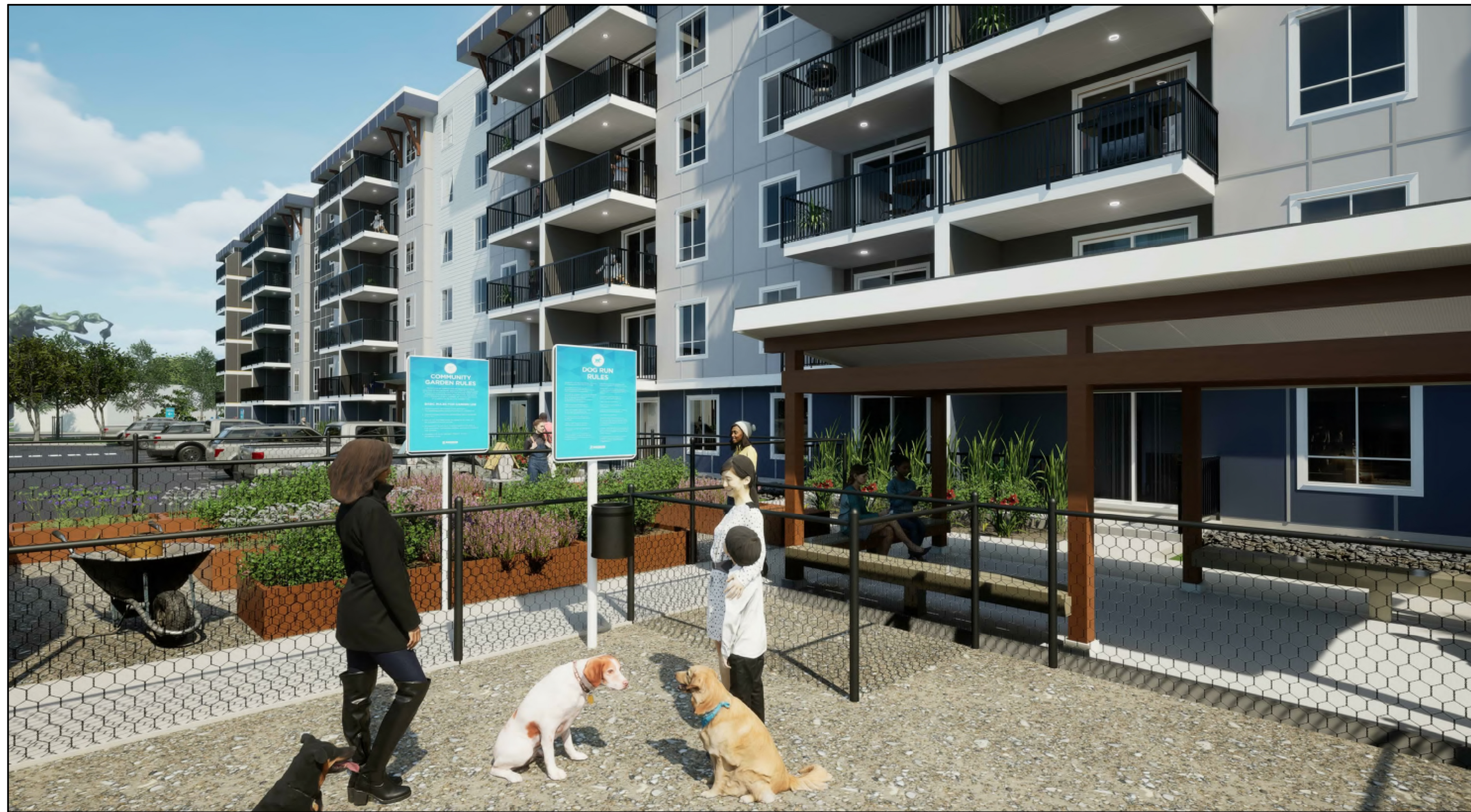
(1) DOG RUN AREA