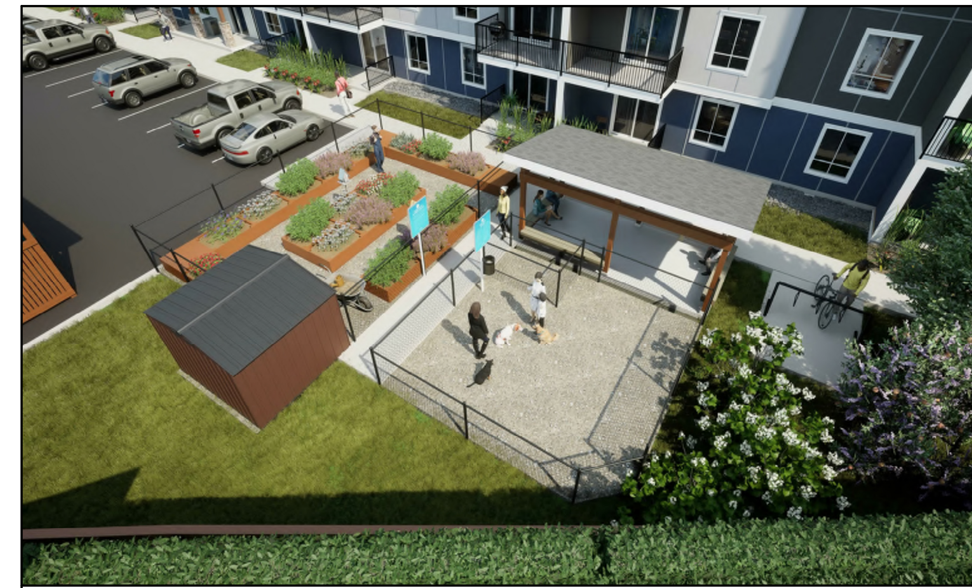
(3) COMMUNITY GARDEN / DOG RUN AREA