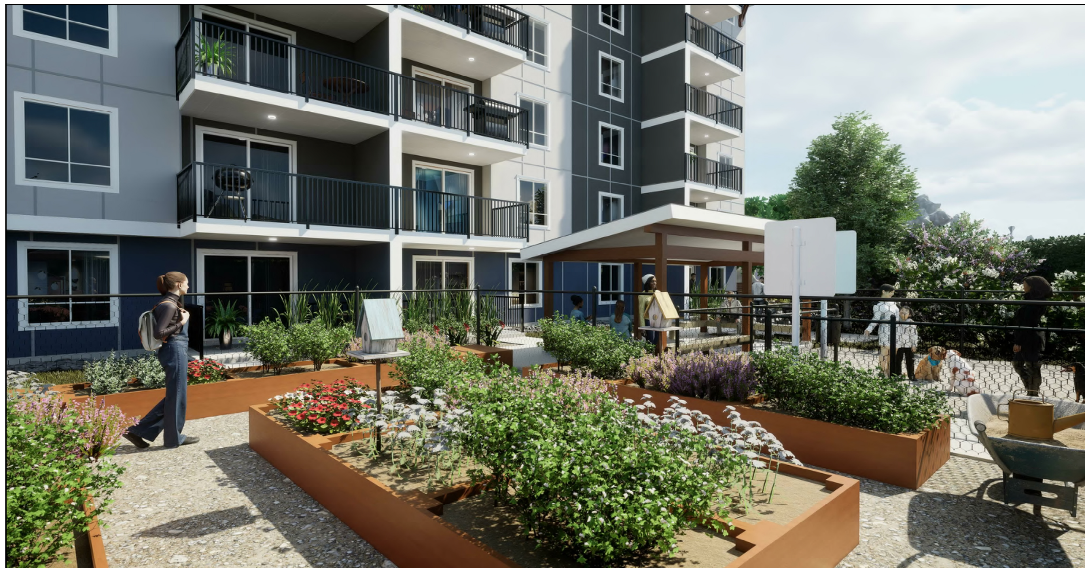
(2) COMMUNITY GARDEN