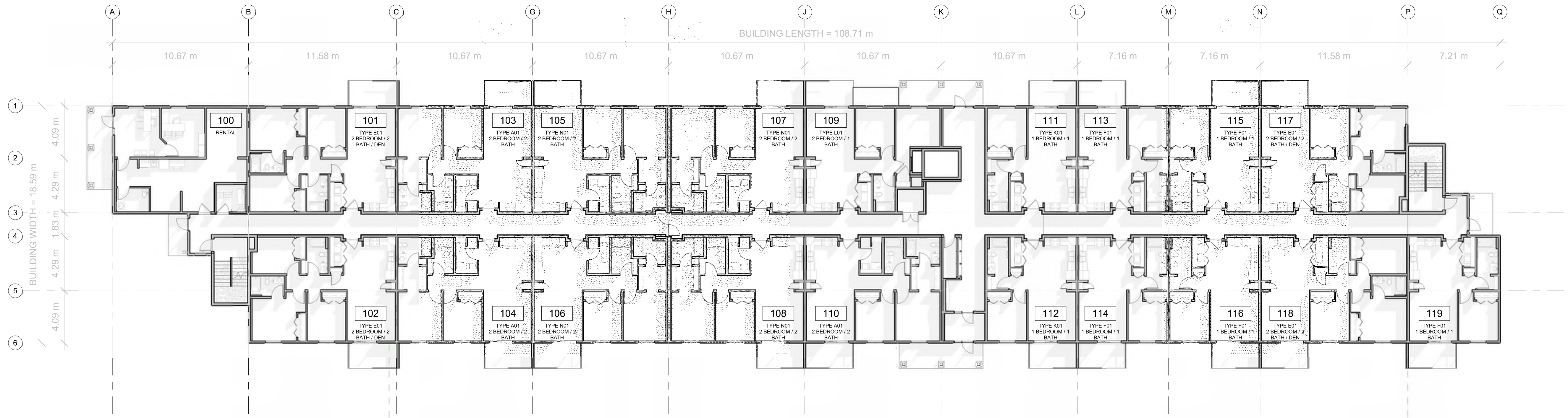
1 FLOOR PLAN - LEVEL 1 1:175