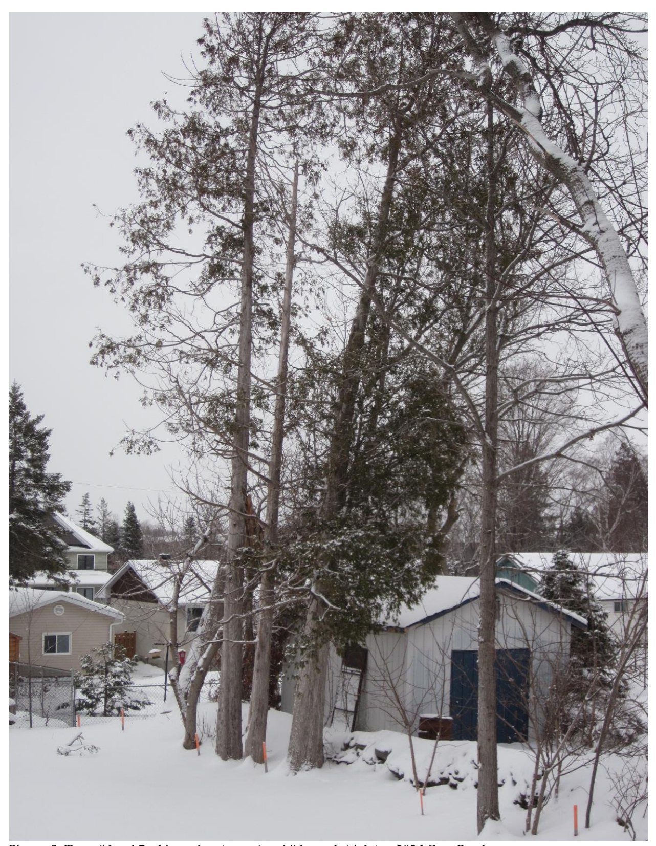
Picture 3. Trees #6 and 7 white cedars (centre) and 8 bur oak (right) at 2026 Carp Road