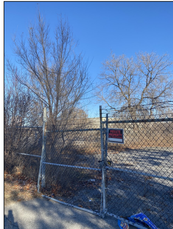
Photo 4. Trees 16 and 17. December 12, 2022.