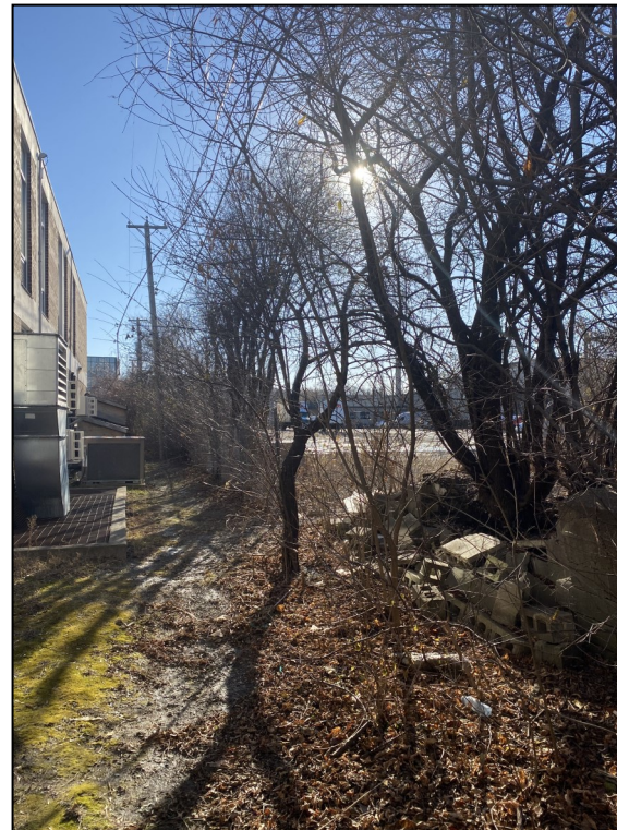
Photo 5. Trees and Common Buckthorn along western edge of Site. December 12, 2022.