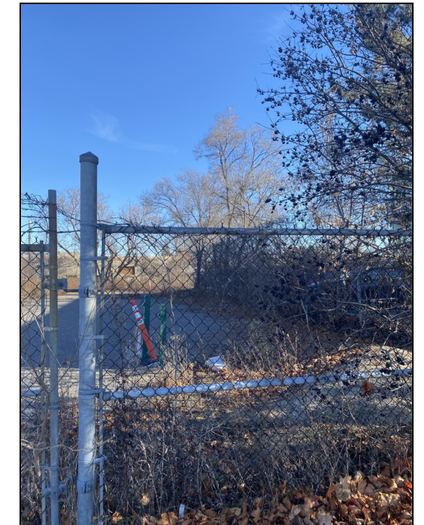
Photo 6. Trees at southeast corner of the Site. December 12, 2022.