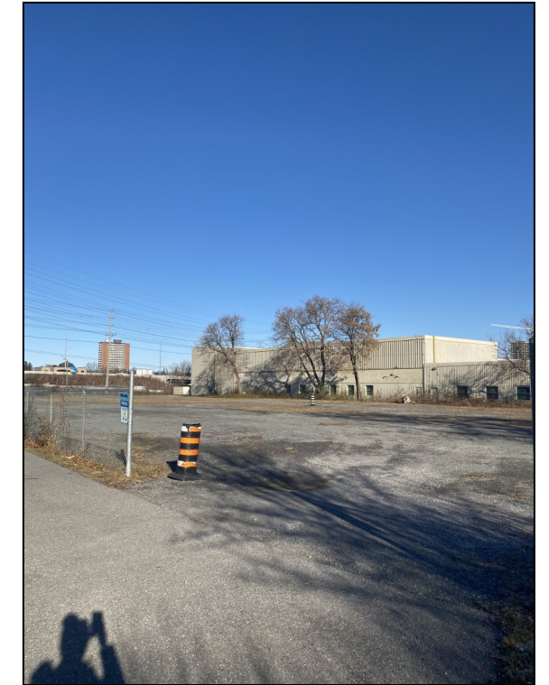
Photo 3. Trees 8 to 11. December 12, 2022.