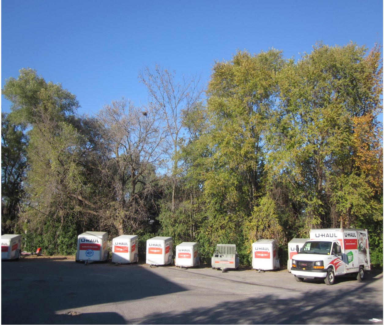
Picture 4. Tree grouping #5 on the subject property – Siberian elms on right and left (still in leaf), hazardous Manitoba maple (leafless, centre left) and white elm (leafless, centre)