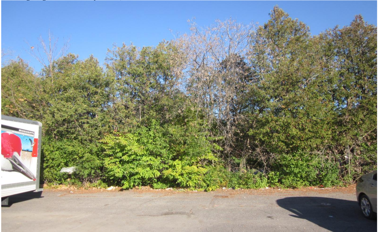
Picture 3. Cedar hedge #4, located on adjacent City of Ottawa property (note invasive growth between and below cedars)