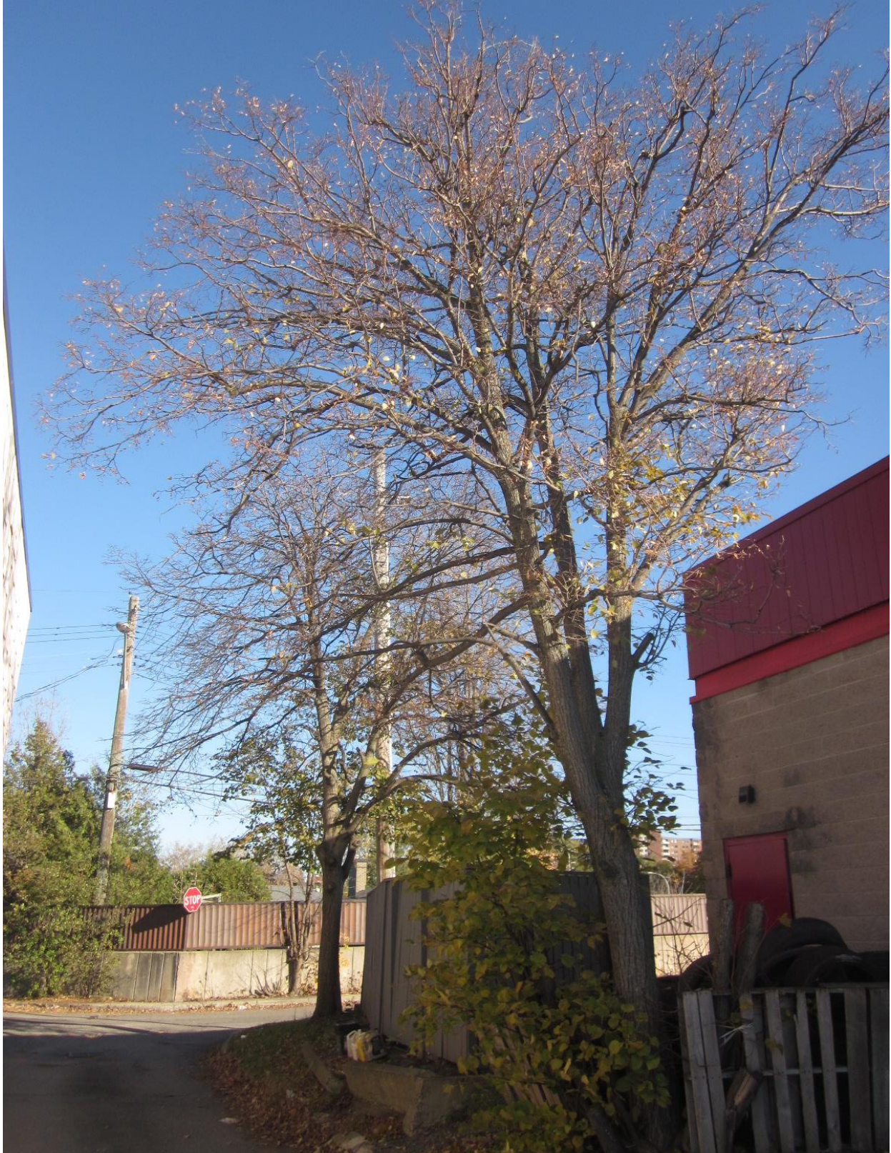
Picture 1. Trees #1 and 2, Little-leaf lindens located on adjacent property at 1533 Merivale Road