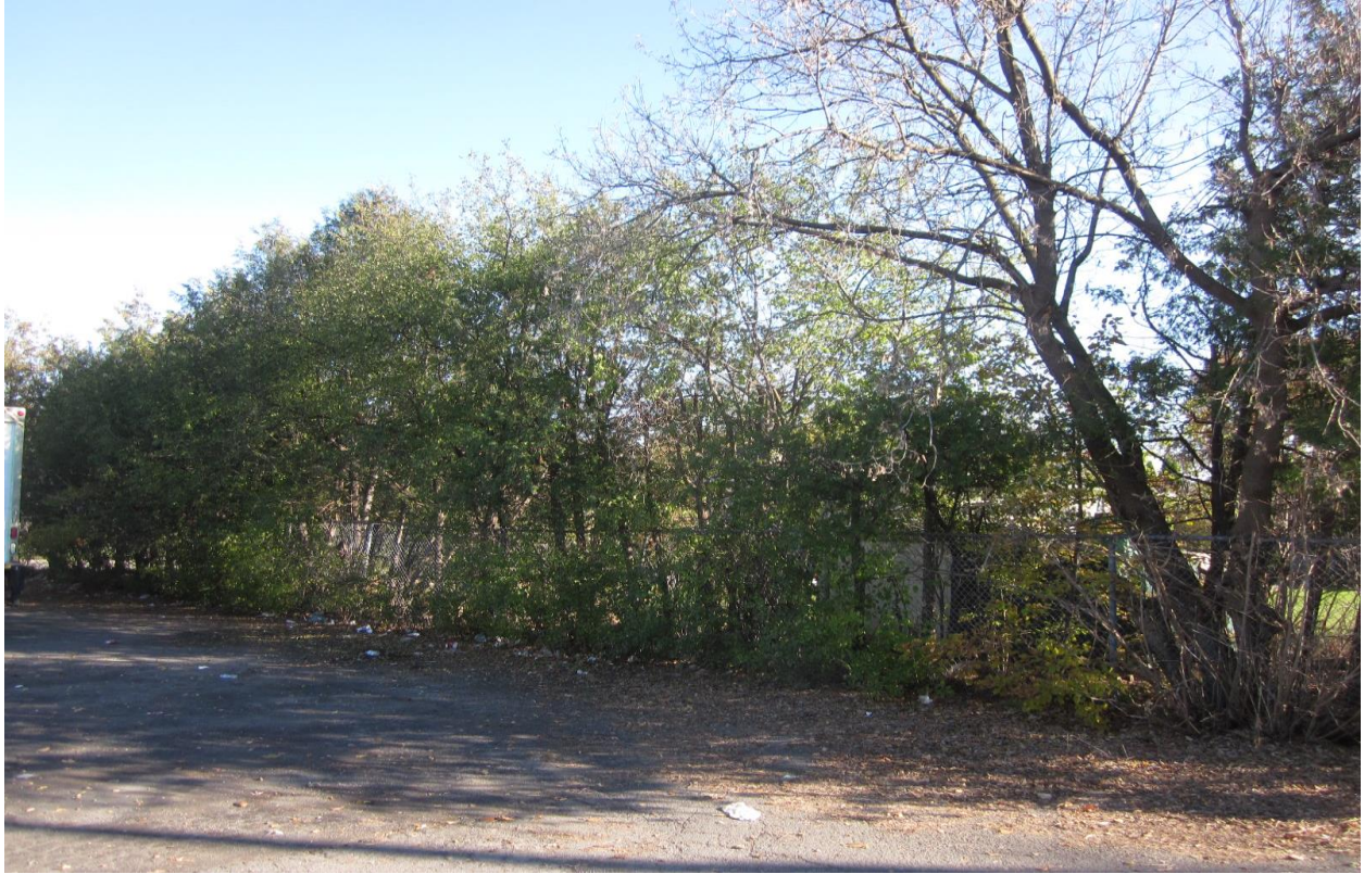
Picture 2. Cedar hedge #3, located on adjacent property at 42 Kerry Crescent (note impact Manitoba maple on right is having on growth of nearby cedars)