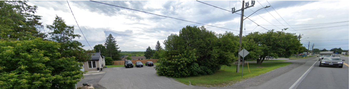
Image 5. Property immediately to the north of site looking northeast from Carp Road (Google Streetview, July 2022)