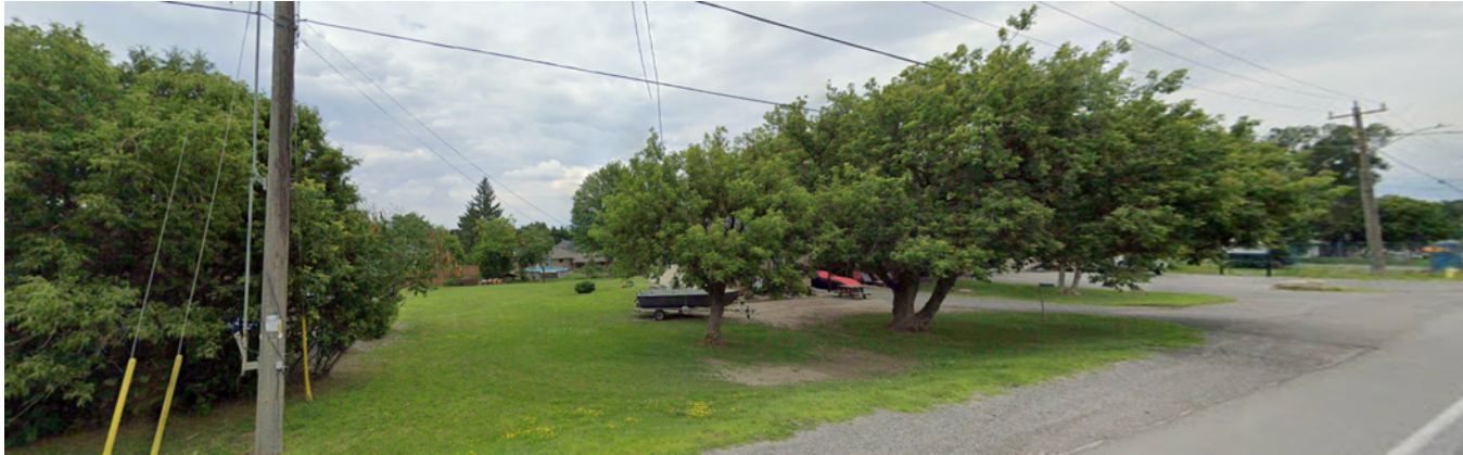
Image 2. Subject site looking east from Carp Road