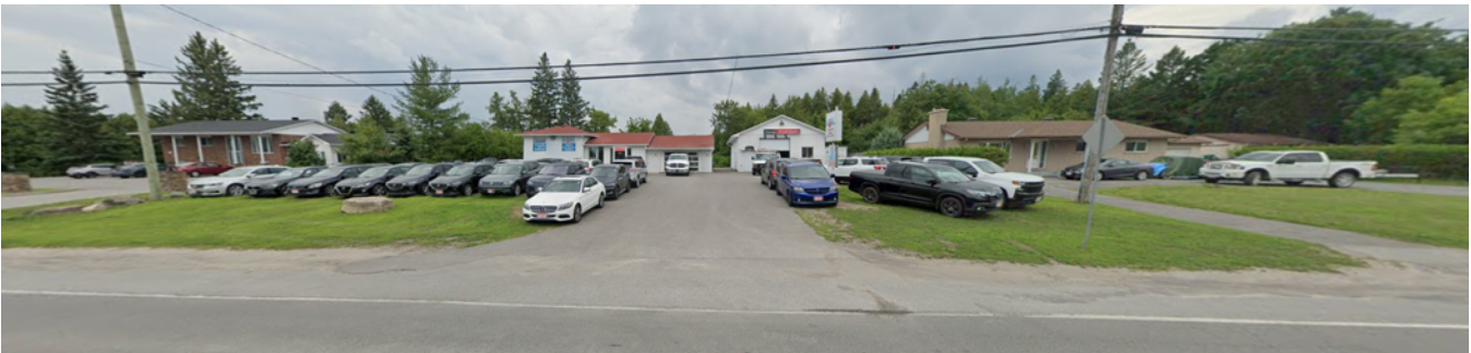
Image 4. Car dealership across from subject site looking southwest from Carp Road (Google Streetview, July 2022)