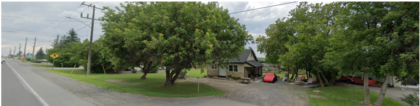
Image 1. Subject site looking north from Carp Road (Google Streetview, July 2022)

Images 1, 2 and 3 below represent the existing site conditions (Google Streetview, July 2022) from Carp Road. The existing building is to be retained and converted to a sales office for the automobile dealership use. Images 4 through 7 present the immediately surrounding context (Google Streetview, 2019).