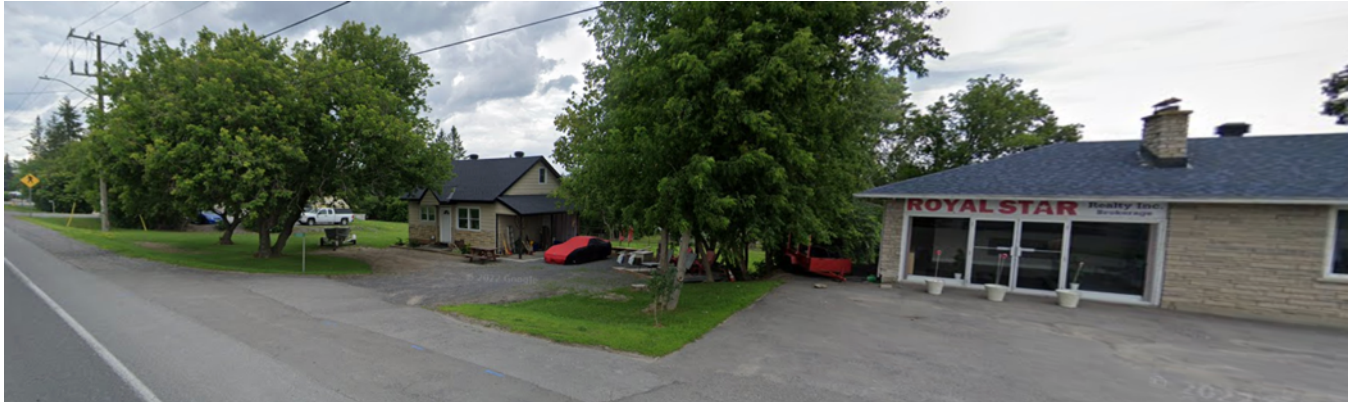
Image 3. Subject site and adjacent commercial use looking north from Carp Road (Google Streetview, July 2022)