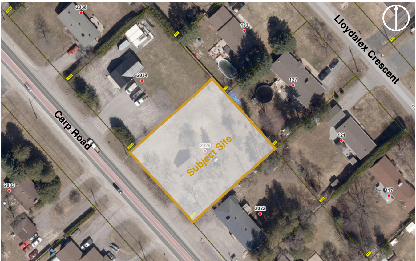
Figure 1. Subject site showing property lines and surrounding context (GeoOttawa, 2021)

The site is a roughly square-shaped lot located on the east side of Carp Road, municipally known as 2026 Carp Road. There is presently a small single-detached dwelling (formerly residential) located on the west side of the lot towards the Carp Road frontage, with a gravel driveway located on the south side towards the southern interior side lot line. The intent is to retain and renovate the existing single-detached dwelling to convert the building into a sales office for used vehicles. Figure 1 below shows the site and approximate property lines per 2021 GeoOttawa mapping.