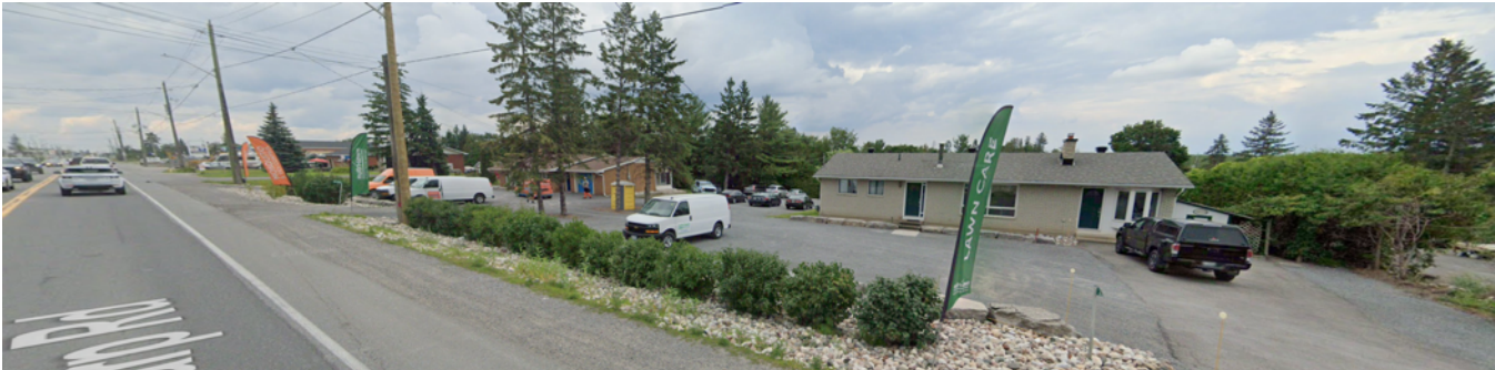
Image 7. Surrounding commercial uses north of site looking north from Carp Road

An aerial image of the subject site and immediately surrounding properties is presented in Figure 3 below.