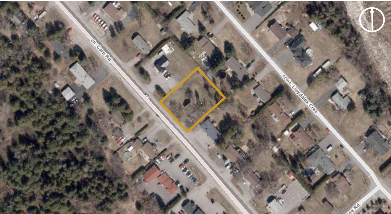
Figure 3. Aerial imagery of subject site and immediately surrounding land uses

An aerial image of the subject site and immediately surrounding properties is presented in Figure 3 below.