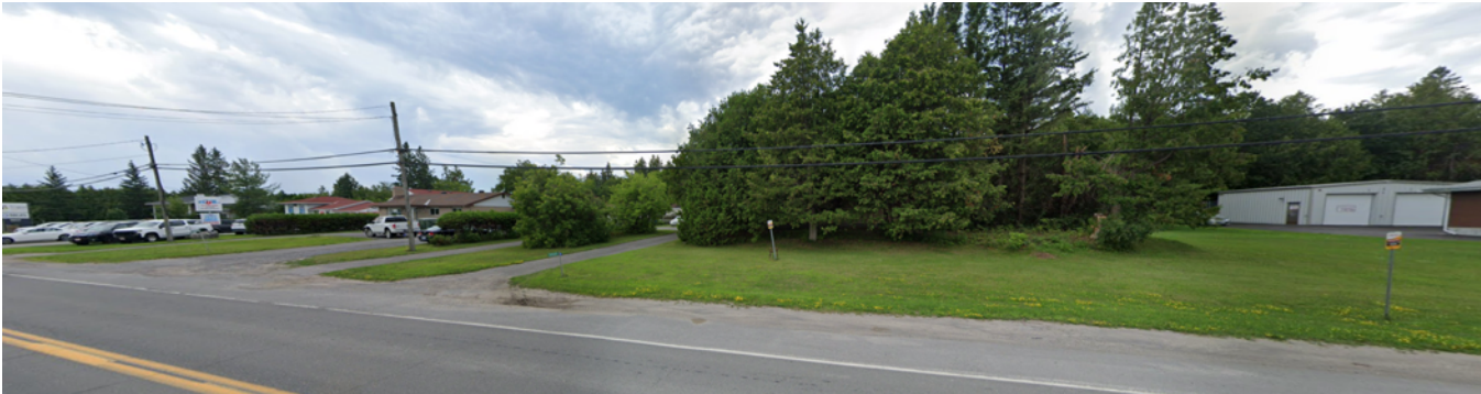
Image 6. Surrounding conditions looking southwest from Carp Road (Google Streetview, July 2022)