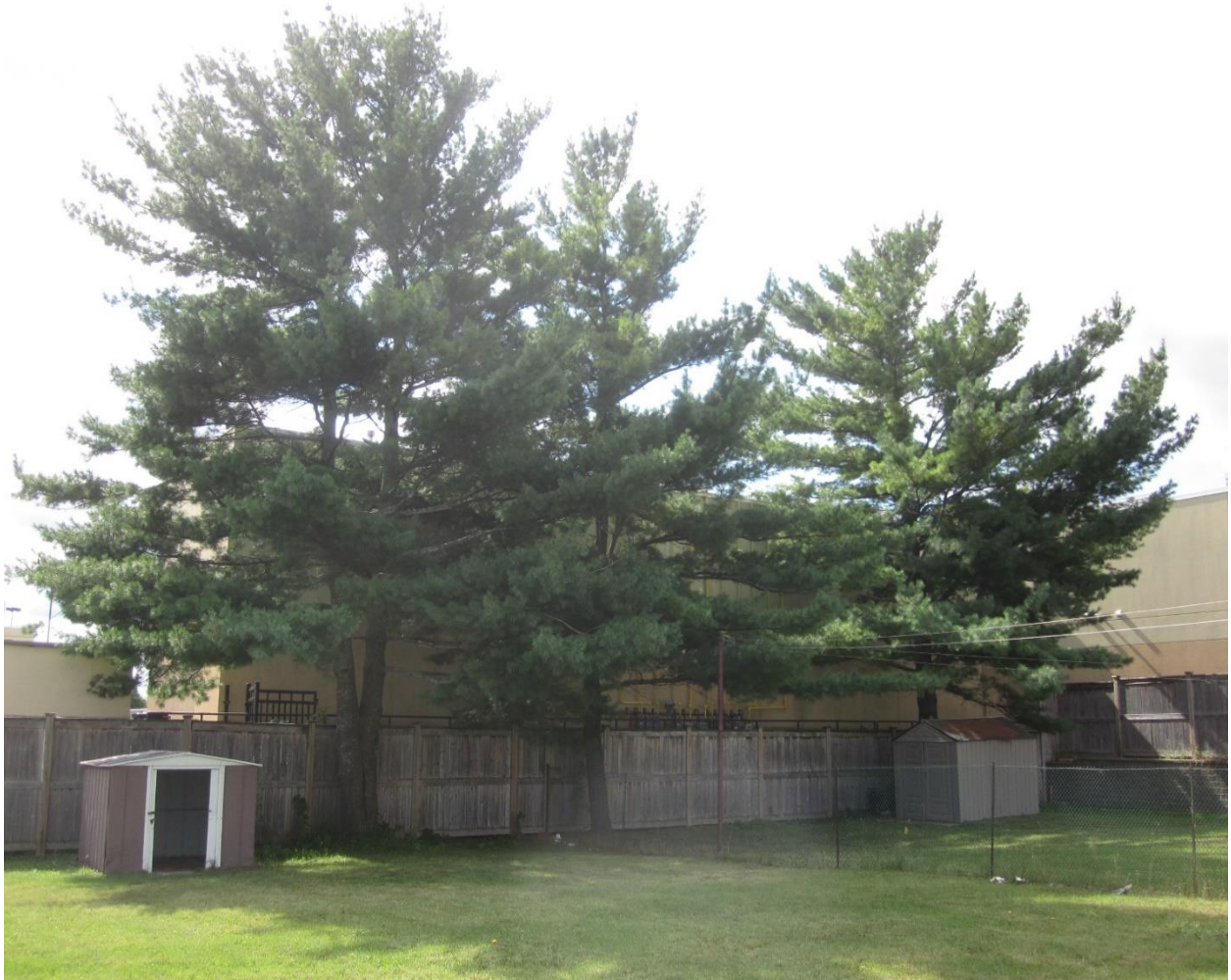
Picture 2. Trees #1-3, private white pines at 3996 Innes Road (tree #1, on far right, is to be preserved).