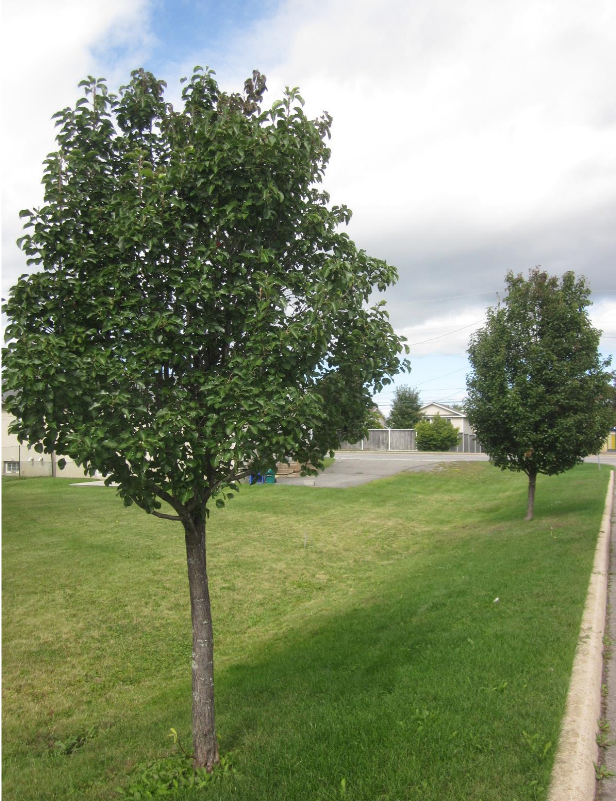
Picture 1. Trees #4 and 5 (right to left) located on church property adjacent to 3996 Innes Road