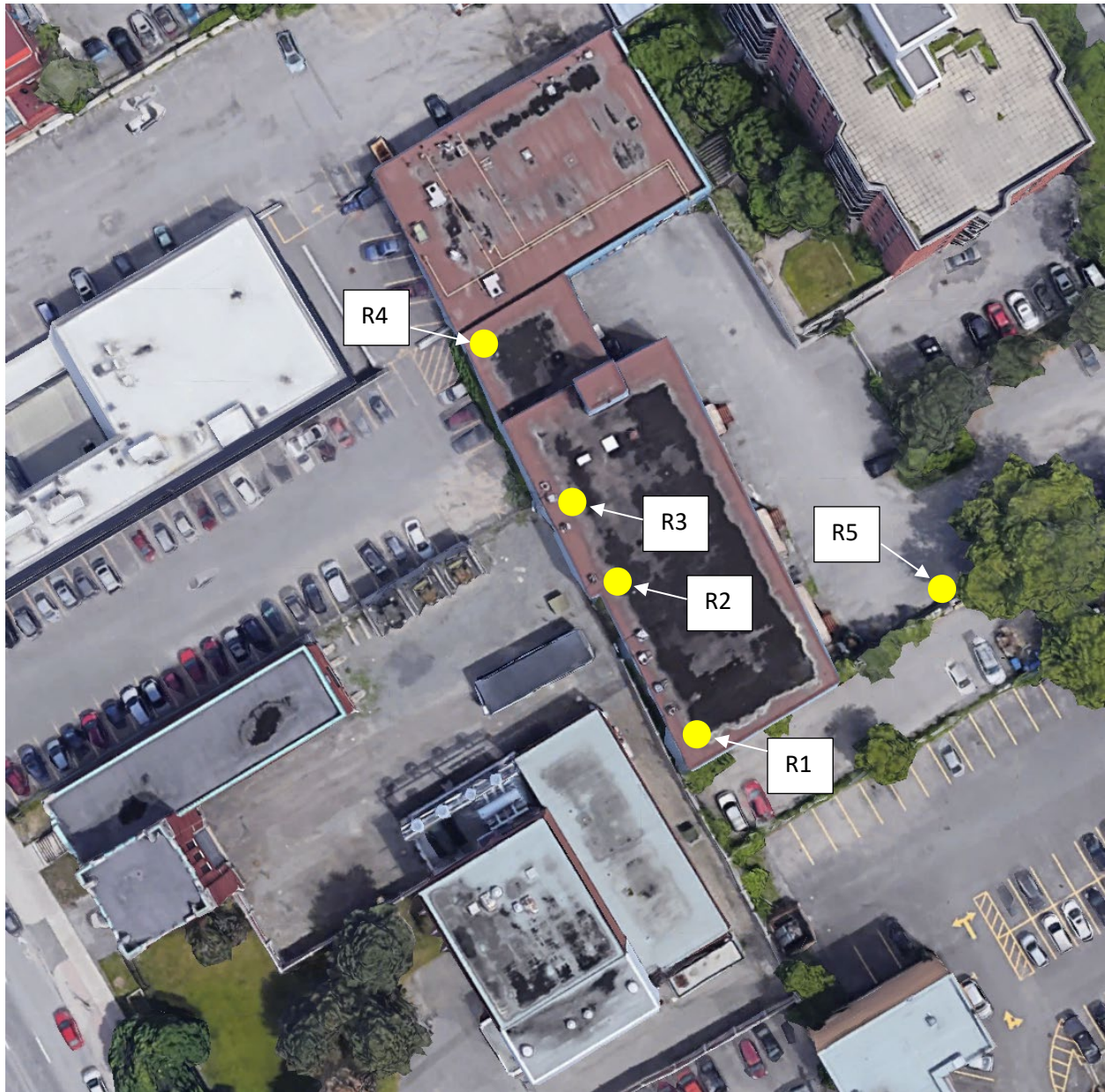
FIGURE 1: MEASUREMENT LOCATIONS