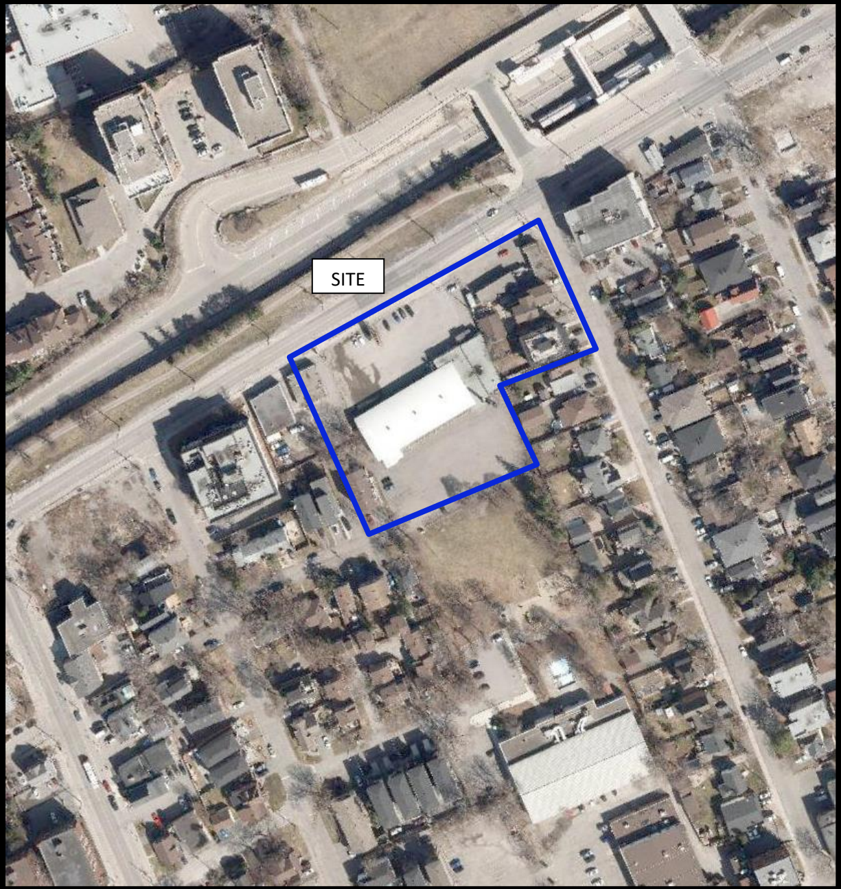
AERIAL PHOTOGRAPH 2021