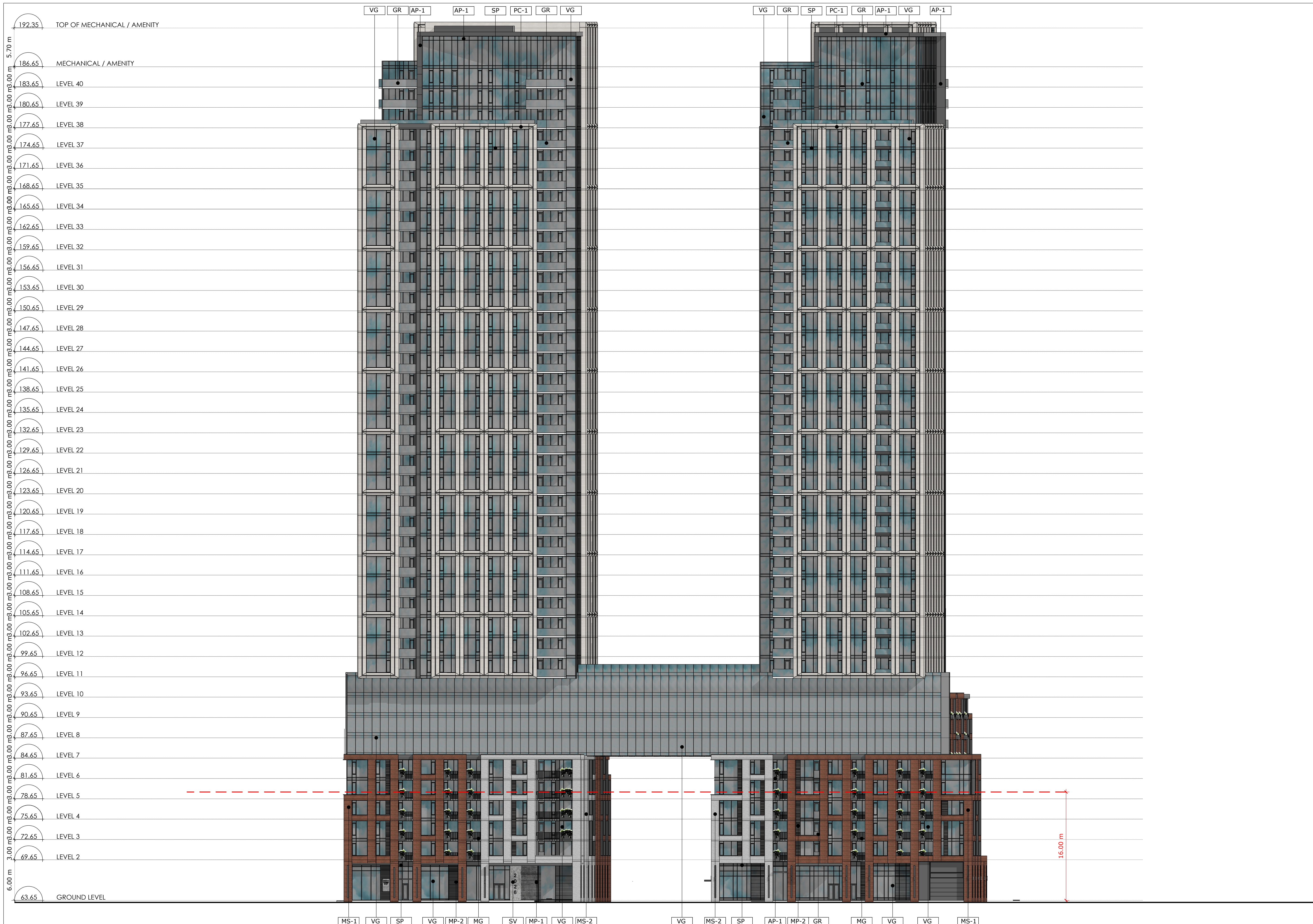
1 NORTH ELEVATION A3.01 Scale: 1: 250