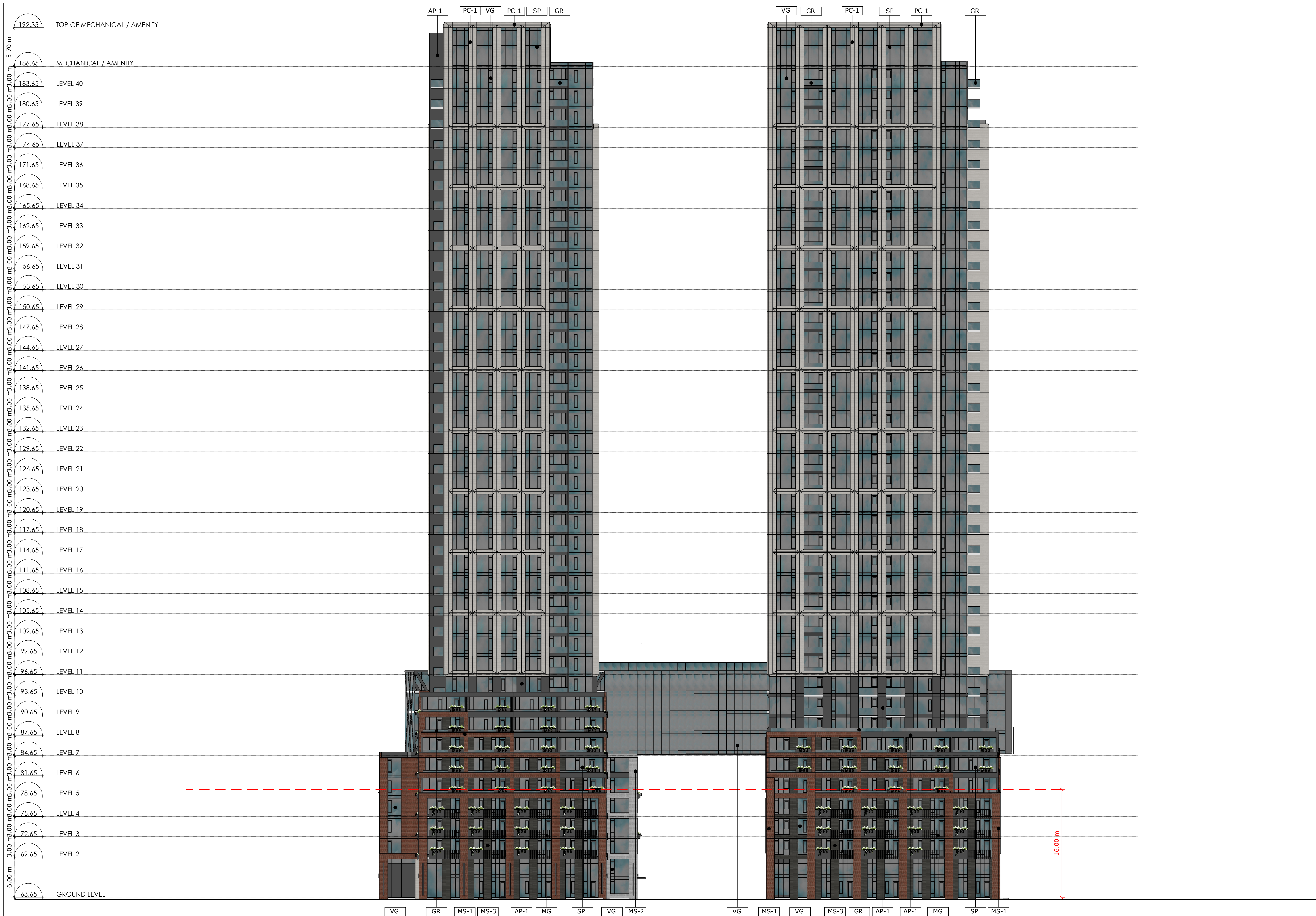
1 SOUTH ELEVATION A3.01 Scale: 1: 250