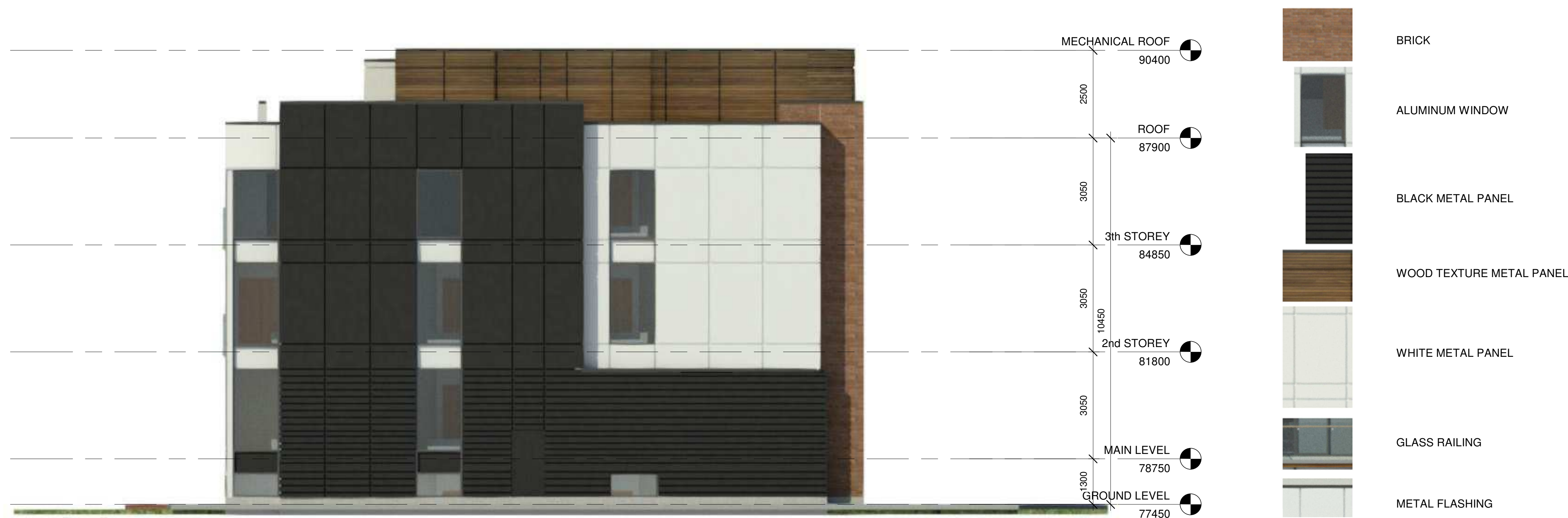
3 SOUTH ELEVATION -- A111B 1:50

ALL CONTRACTORS TO VERIFY ALL DIMENSIONS ON SITE AND TO REPORT ALL ERRORS AND/OR OMISSIONS TO THE ARCHITECT. ALL CONTRACTORS MUST COMPLY WITH ALL CODES AND BYLAWS AND OTHER AUTHORITIES HAVING JURISDICTION OVER THE WORK. DO NOT SCALE DRAWINGS. THIS DRAWING MAY NOT BE USED FOR CONSTRUCTION UNTIL SIGNED BY THE ARCHITECT. COPYRIGHT RESERVED.