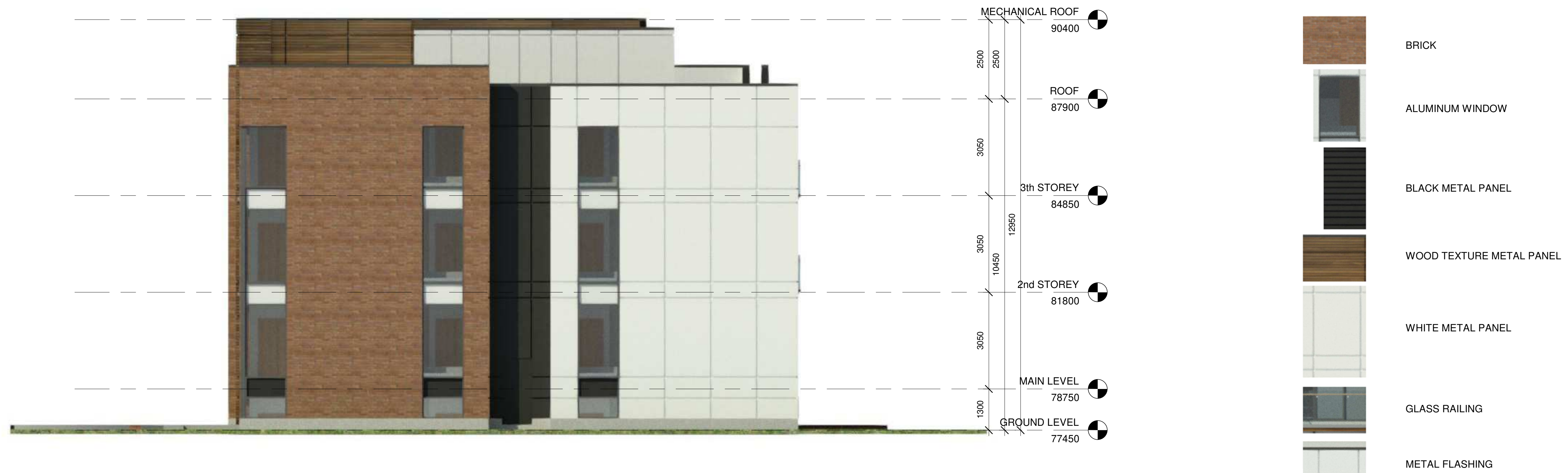
1 NORTH ELEVATION -- A110B 1:75