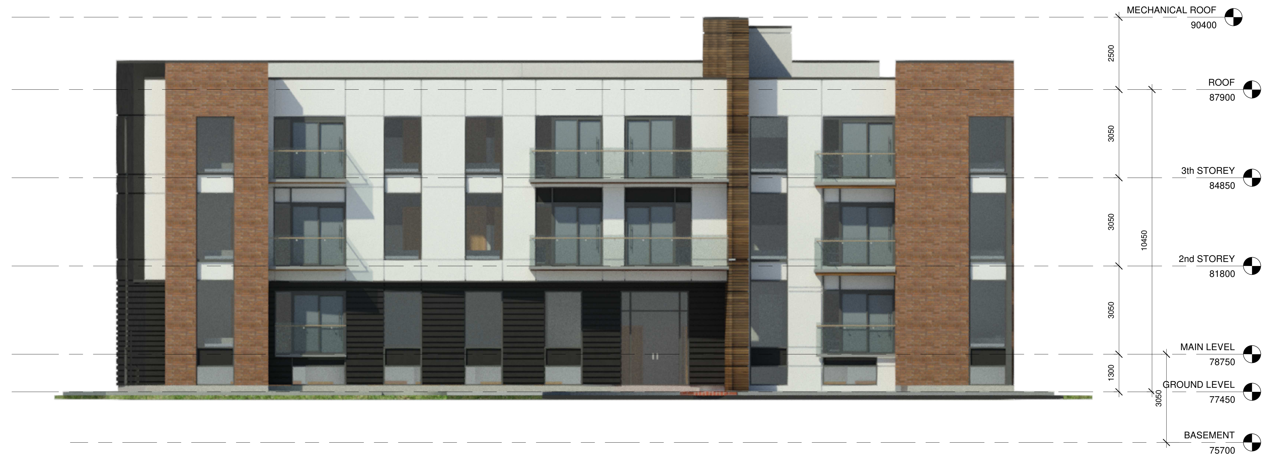
2 WEST ELEVATION - A110B 1:50