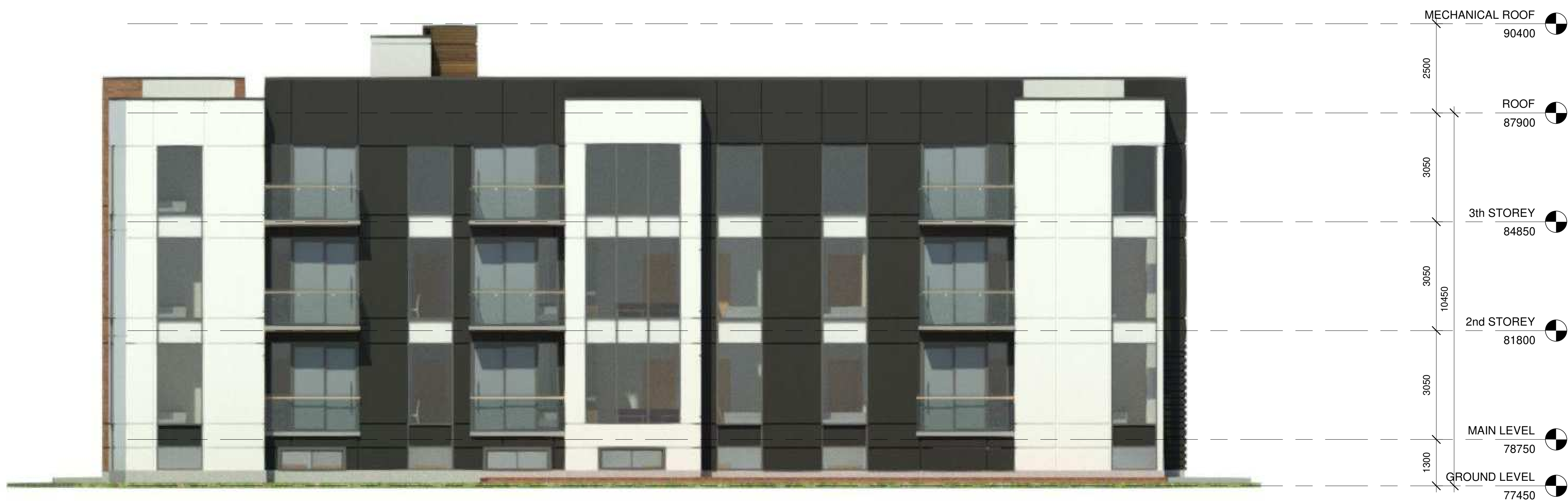
1 EAST ELEVATION -- A111B 1:75