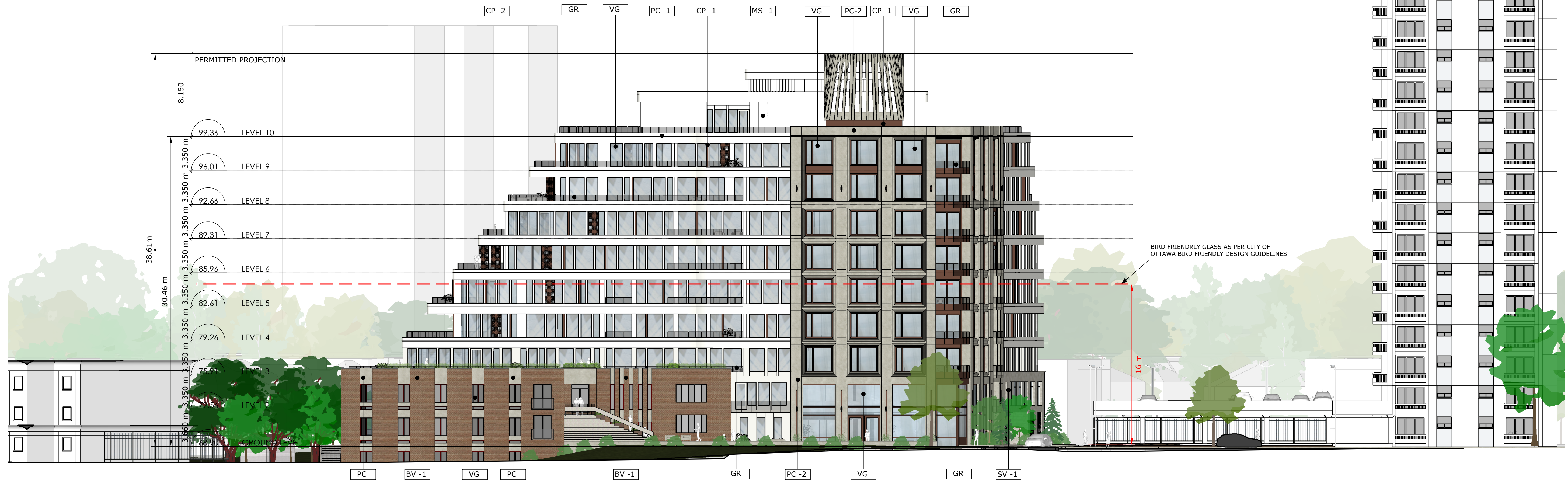
1 NORTH ELEVATION A3.00 Scale: 1: 200