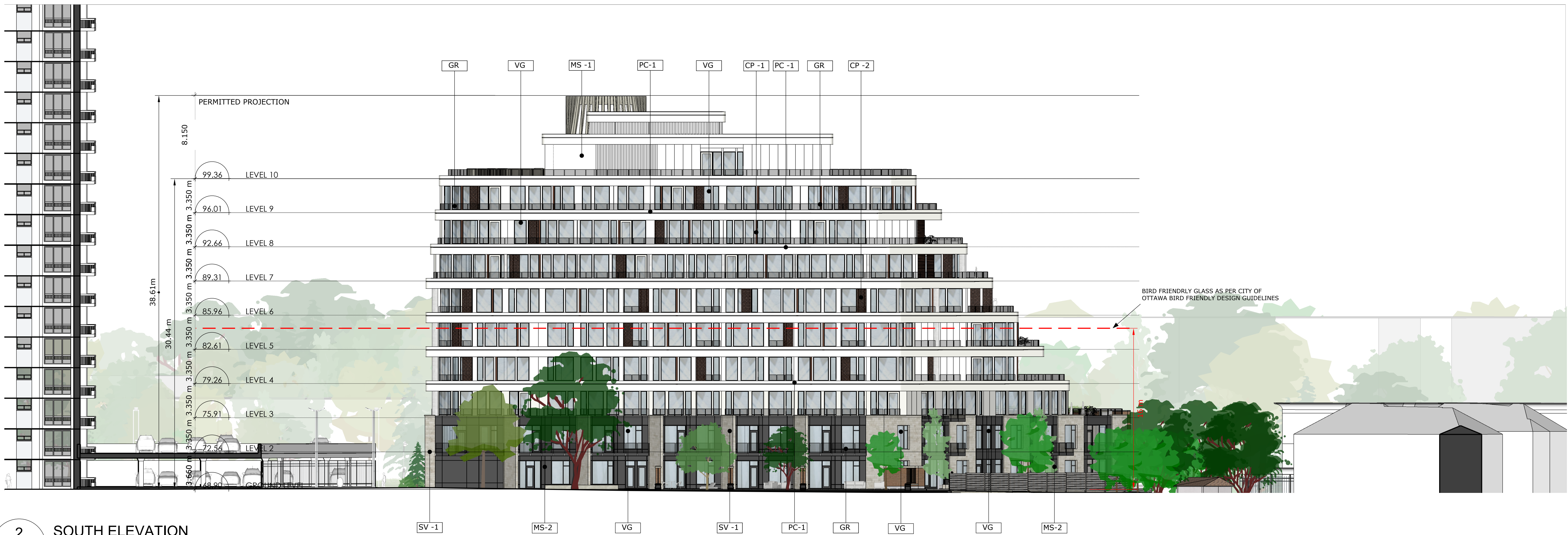
2 SOUTH ELEVATION