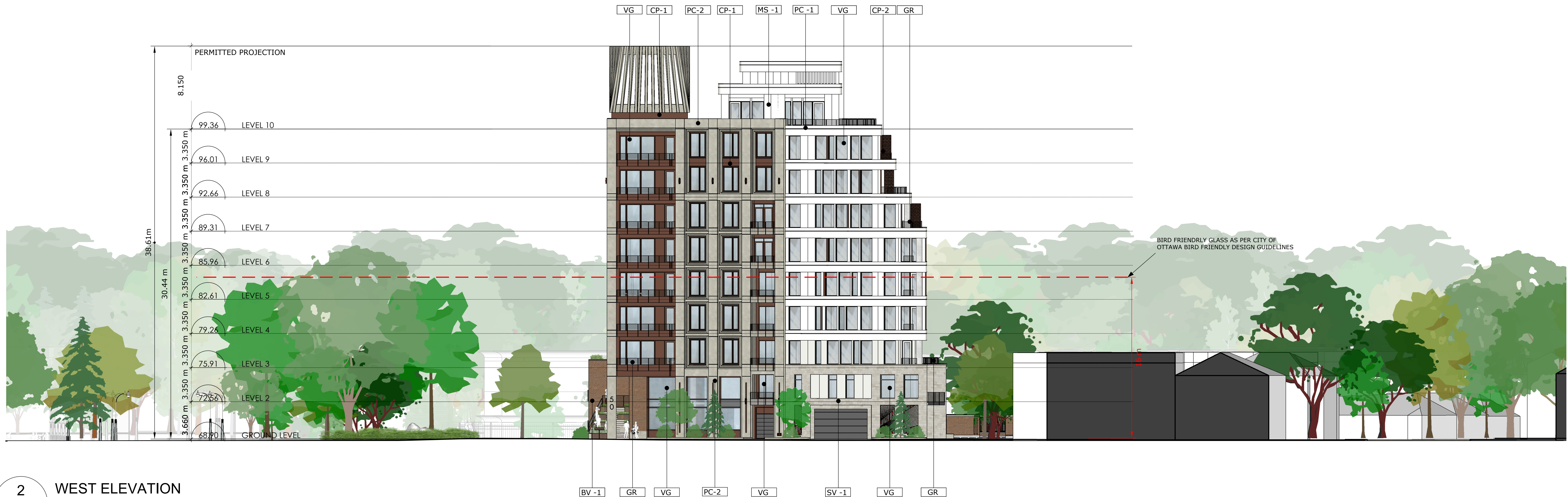
2 WEST ELEVATION A3.00 Scale: 1: 200