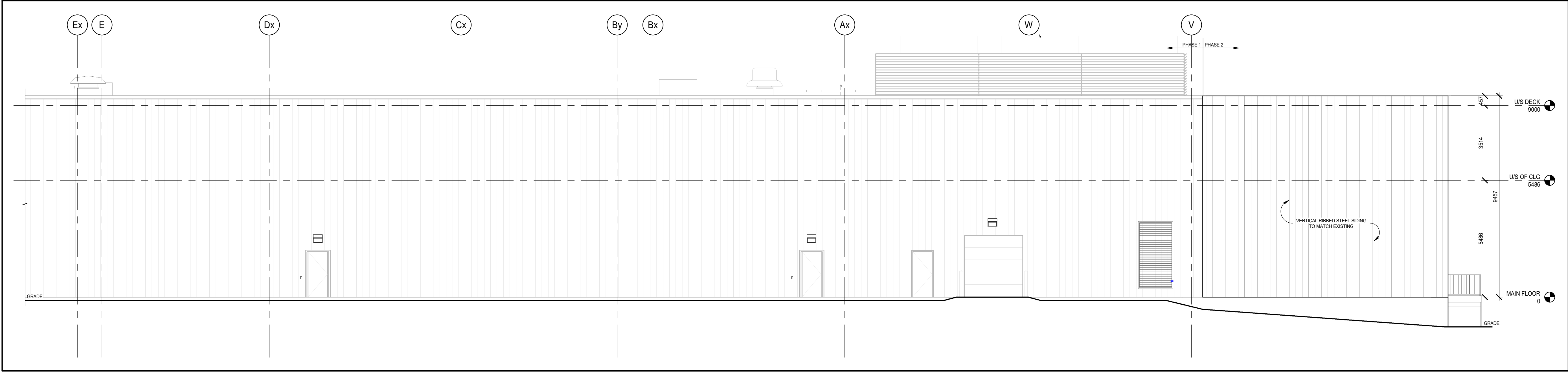
1 EAST ELEVATION - PHASE 2 A3.10.2 1:100