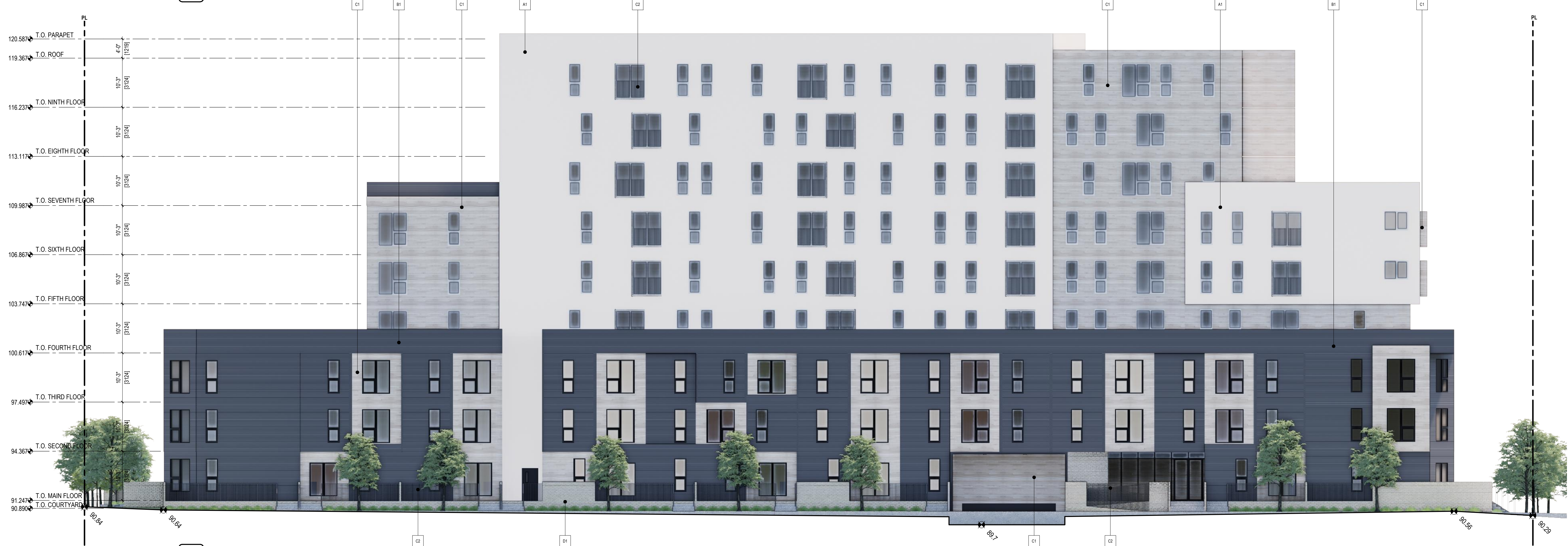
2 BUILDING A - NORTH ELEVATION DP.301 332' - 1'-0"

ARCHITECT FAAS ARCHITECTURE BRIGGS DORRICK-COOPER 403.923.5072 PLANNING C3 PLANNING & DESIGN CHRISTINE MACLIANG 613.890.8349 CIVIL DESIGN WORKS HEATHER BOYD 781.344.0200 LANDSCAPE ARCHITECT CSW LANDSCAPE ARCHITECTS LTD. LISA MACDONALD 613.897.1227 TRANSPORTATION IB GROUP BEN PINOCCIO NEVILL 613.225.1311 ext 64074 ENVIRONMENTAL GRADIENT WIND ENGINEERING JOSHUA FOSTER 613.836.0634