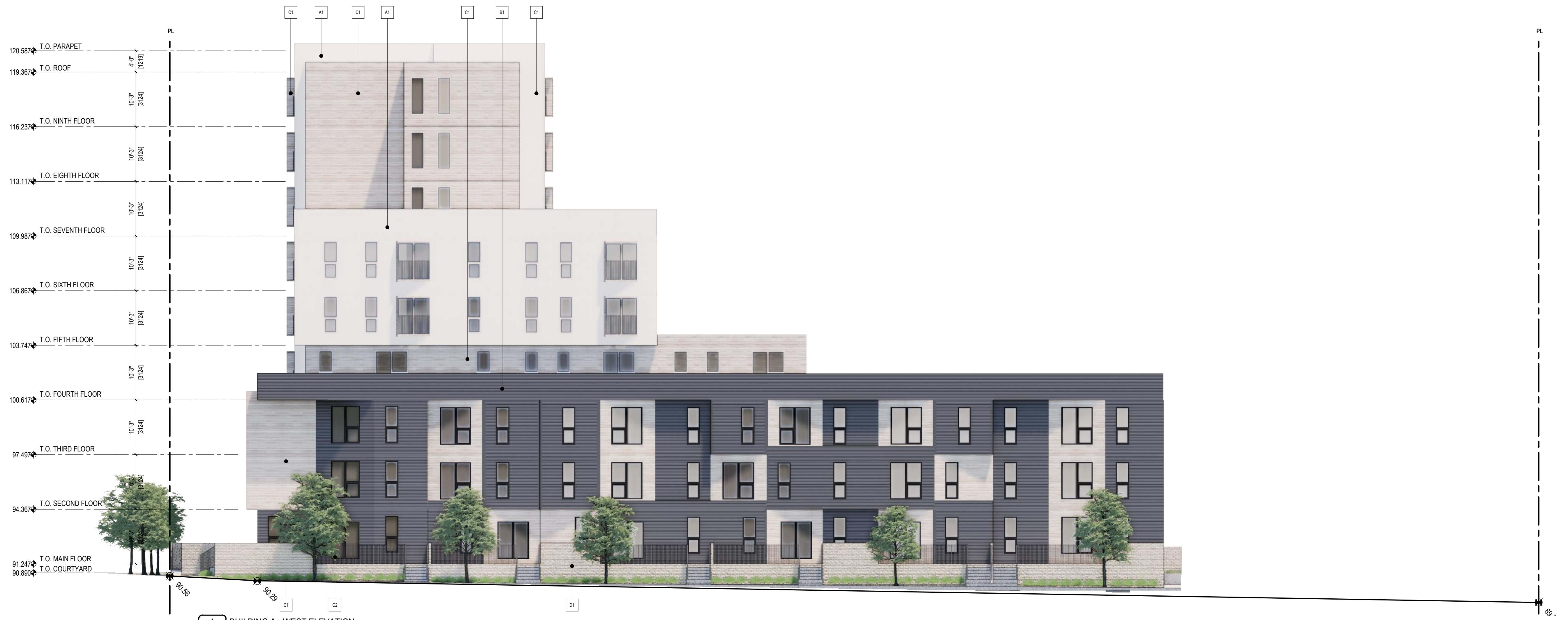
1 BUILDING A - WEST ELEVATION DP.301 332' - 1'-0"