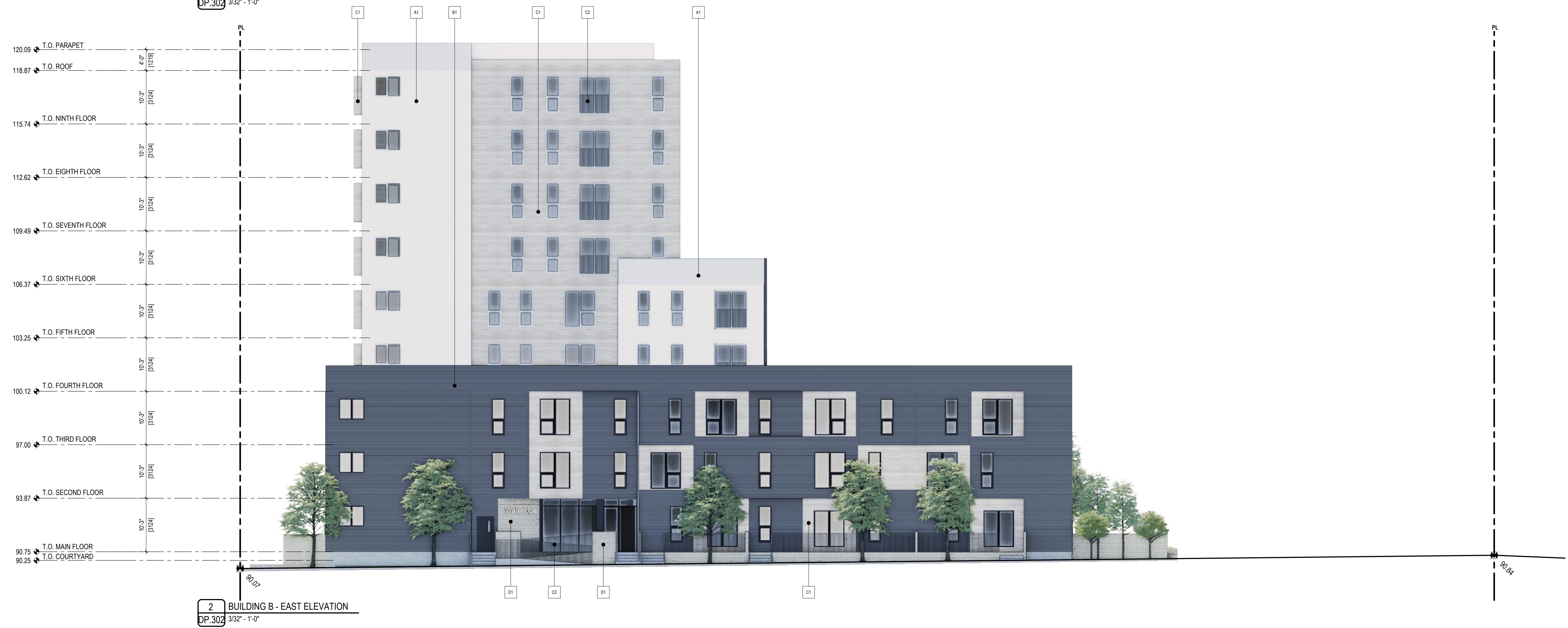
2 BUILDING B - EAST ELEVATION DP.302 3/32" - 1'-0"