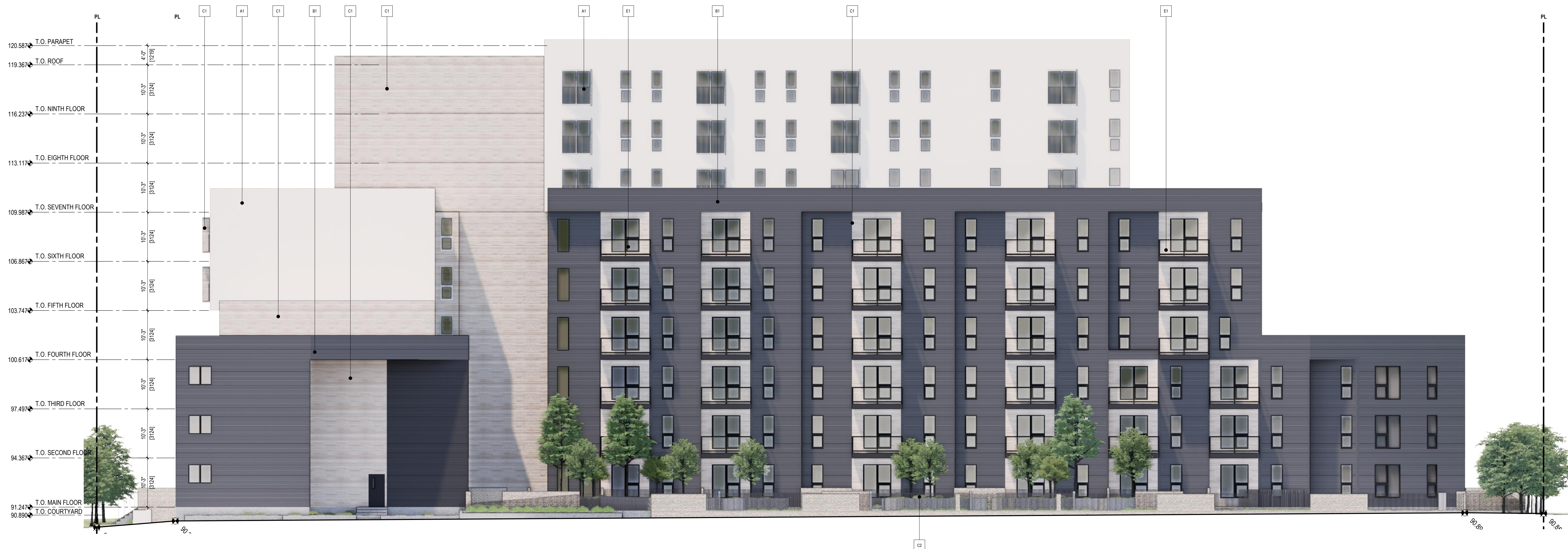
1 BUILDING A - SOUTH ELEVATION DP.300 3/32" - 1'-0"