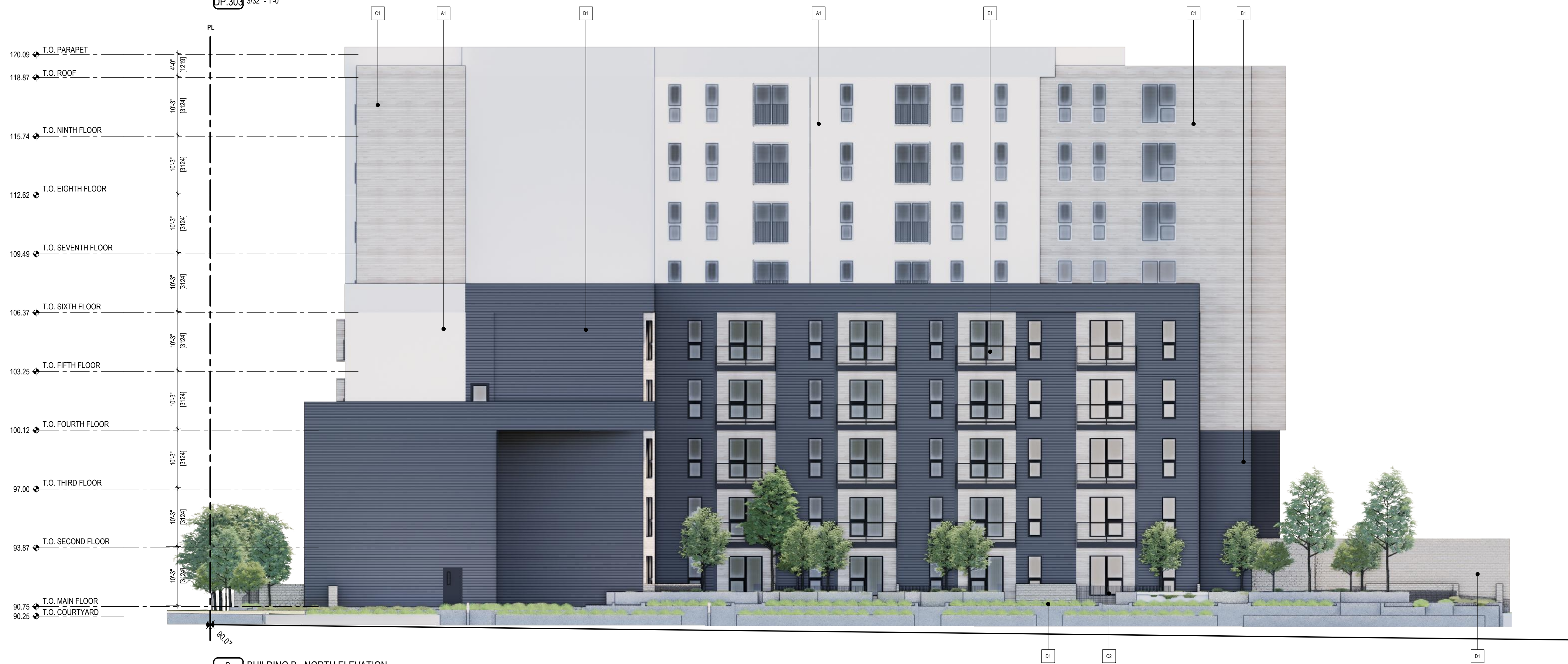
2 BUILDING B - NORTH ELEVATION DP.303 3/32" - 1'-0"