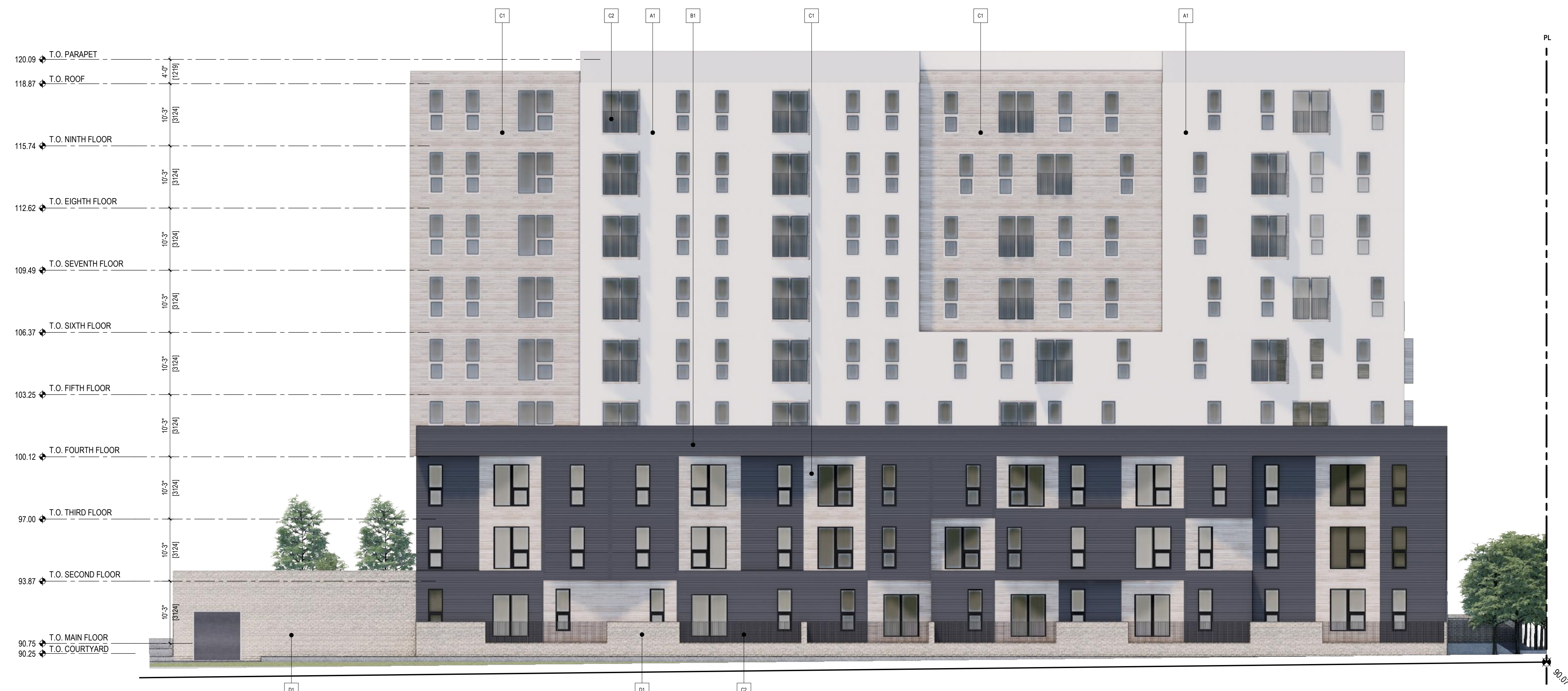
1 BUILDING B - SOUTH ELEVATION DP.302 3/32" - 1'-0"