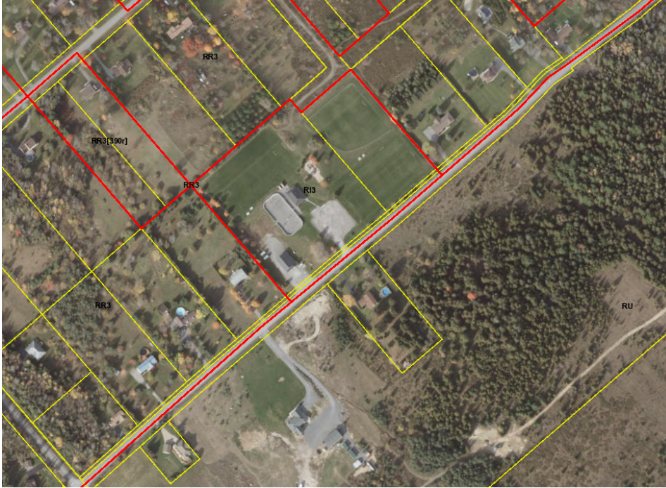
Figure 1: Aerial view of surrounding properties with zoning designations and property lines