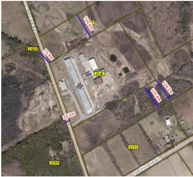
Figure 2 – Separation Distances to Nearby Sensitive Uses