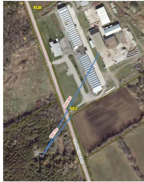
Figure 3 – General Land Use Method of Measure to #2588