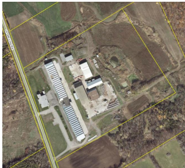
Figure 1 – Aerial View of the Subject Property

The subject property is located at 2545 9 th Line Road, falling in Part of Lots 19 and 20, Concession 9, in the Geographic Township of Osgoode (See Figure 1). A Topo Survey completed for the property shows the lands measure roughly 14.285 hectares in size with 335.7 metres of frontage on 9 th Line Road.