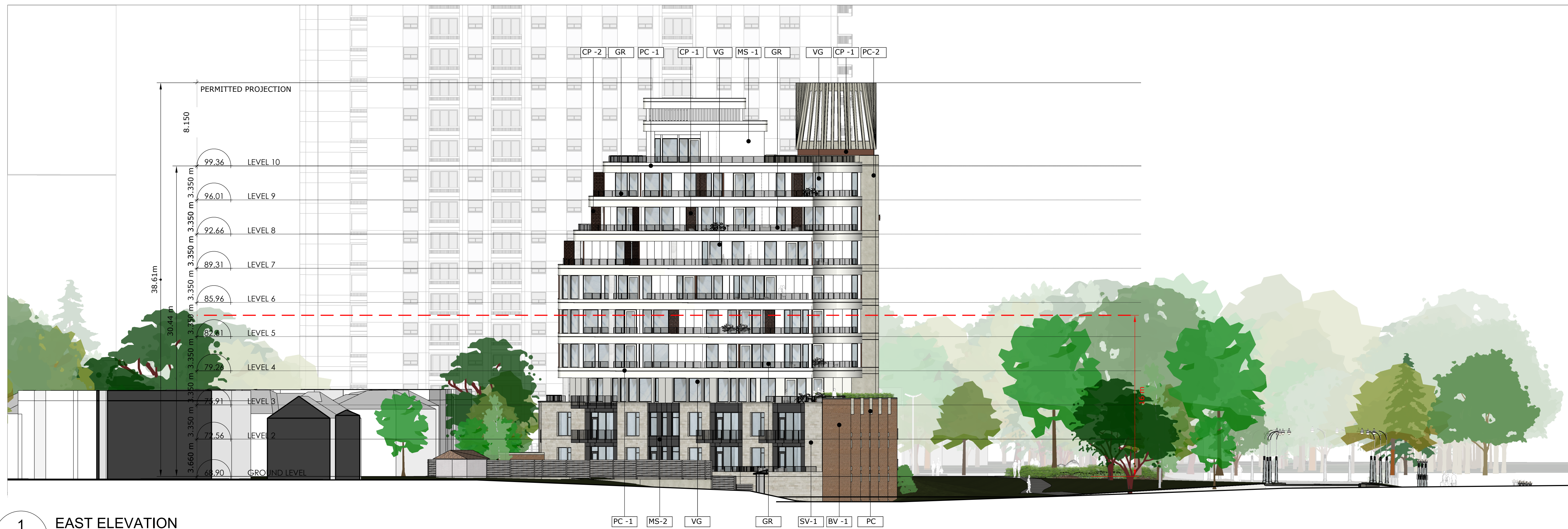
1 EAST ELEVATION A3.01 Scale: 1: 200