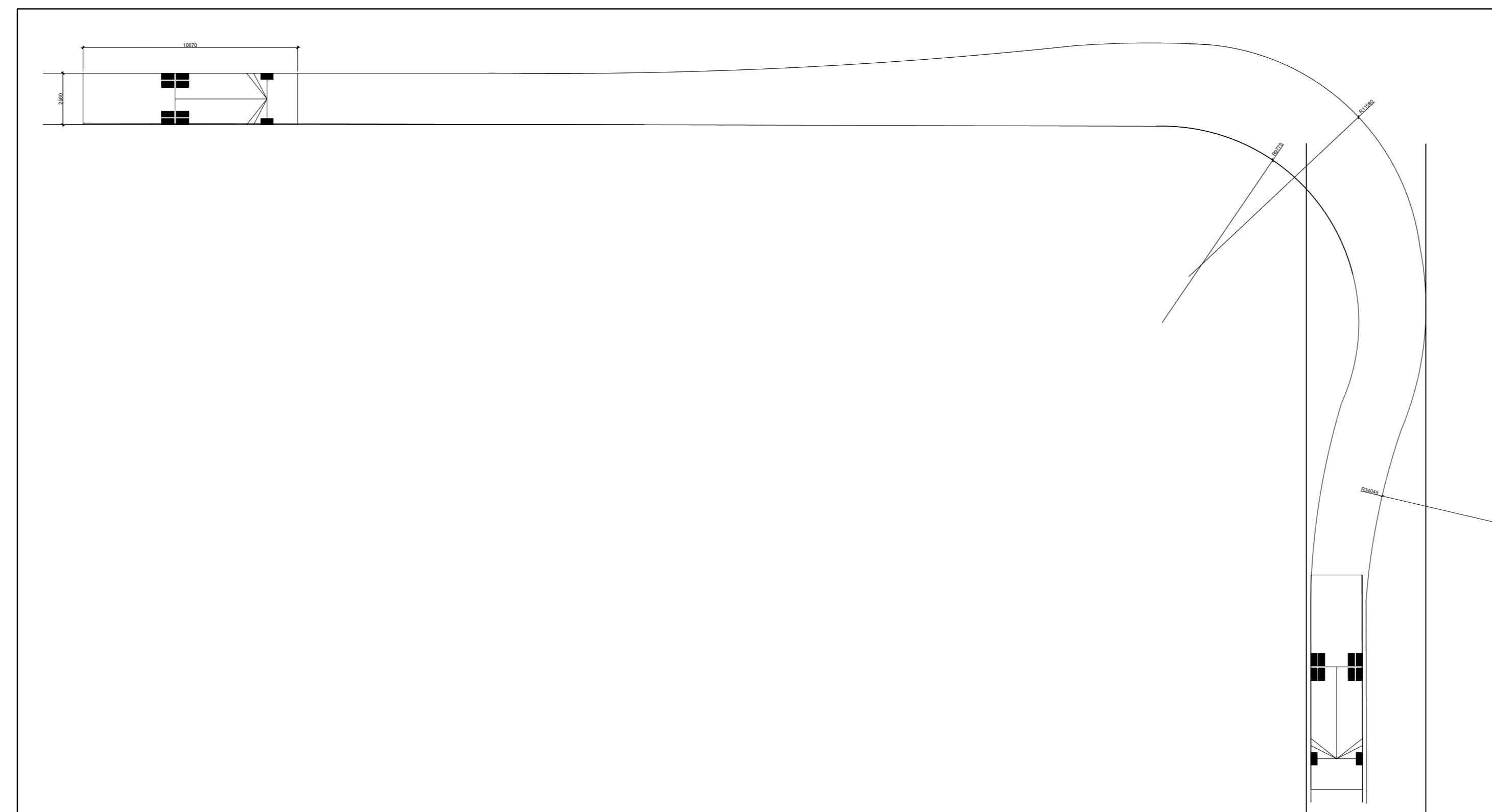
3 GARBAGE TRUCK ROUTE DIMENSIONS SCALE = 1/16" = 1'-0"