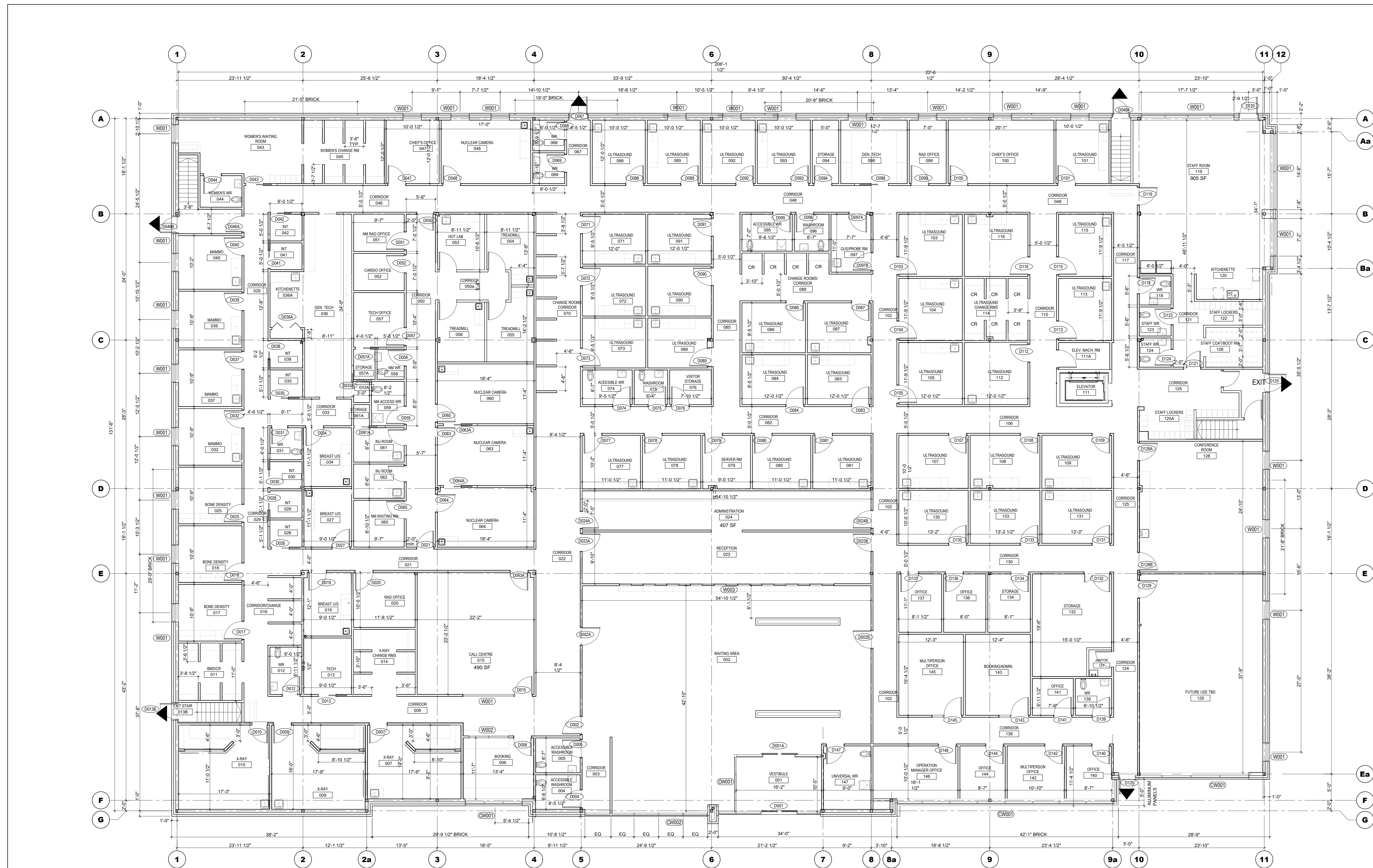
1 GROUND FLOOR PLAN A-200 1/8" = 1'-0"