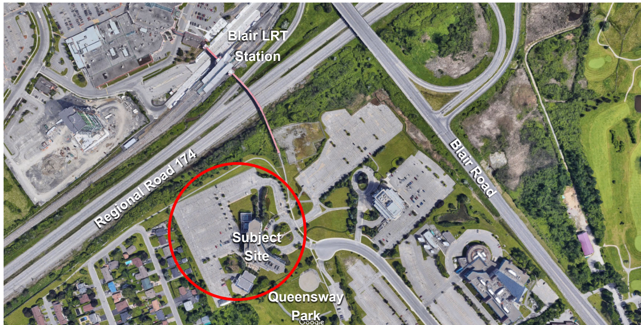
Figure 1 Study Area

The property is 3.64 hectares (8.99 acres) in size. By its location within the City of Ottawa, the project site is situated within the City of Ottawa Inner Urban Area as defined by Schedule F of the City of Ottawa's Tree Protection By-law (By-law No. 2020-340) (City of Ottawa 2021a). Under this by-law, "all trees 10 cm or more in diameter at breast height on private properties with the urban area that are over 1 hectare in size" are considered "protected trees" and may not be injured or removed without a Tree Removal Permit issued by the City of Ottawa. The City of Ottawa's Tree Protection By-law was used to framework the tree assessment and tree retention mitigation recommendations for this project. Trees 10 centimetres (cm) DBH or greater have been assessed in terms of species, sizes, and overall health conditions; as required by the City of Ottawa.