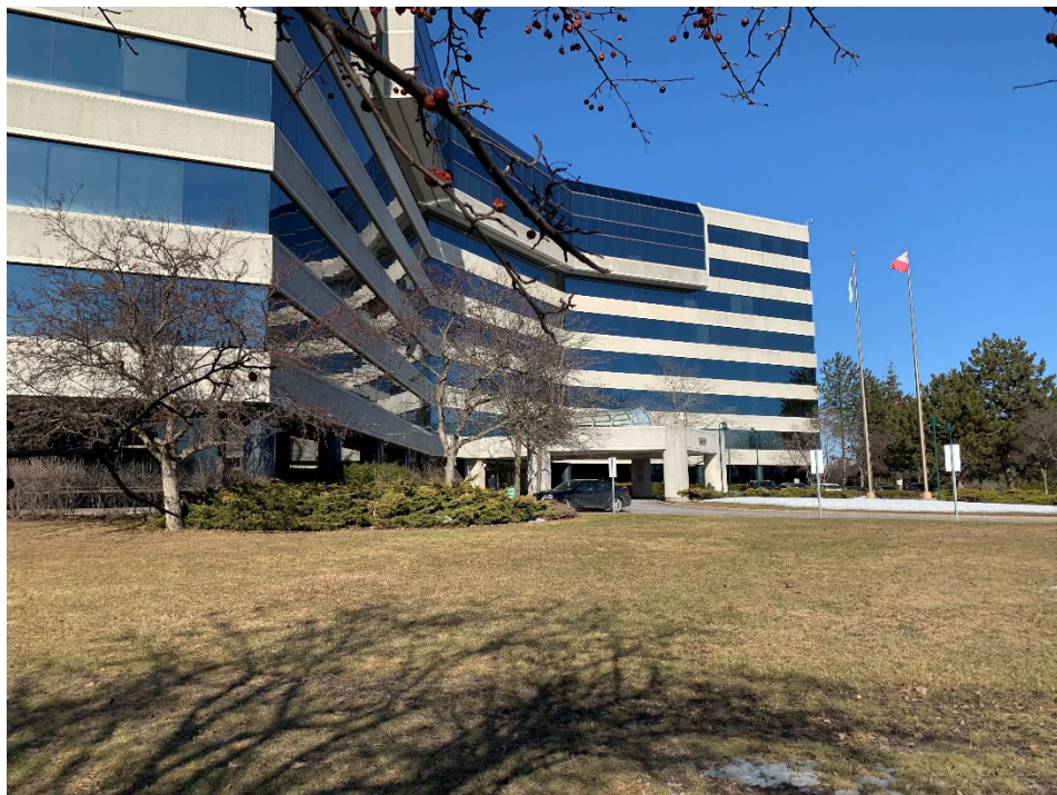
Photograph 2 – Trees and planting beds to the south