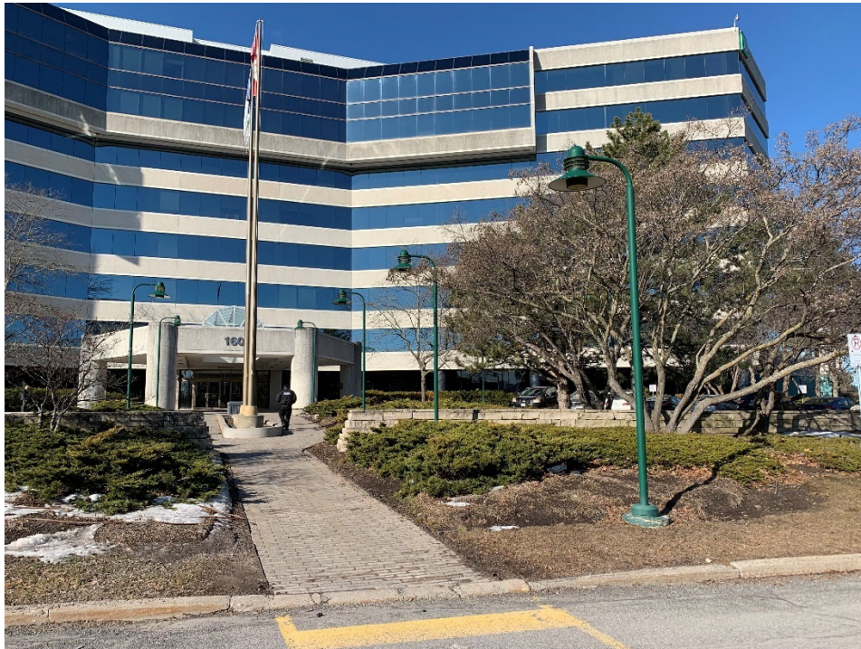
Photograph 1 – Main walkway leading to East Entrance