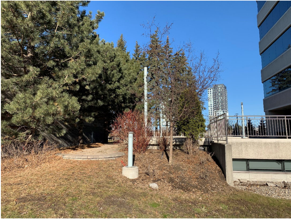
Photograph 6 – Plantings at the western terrace