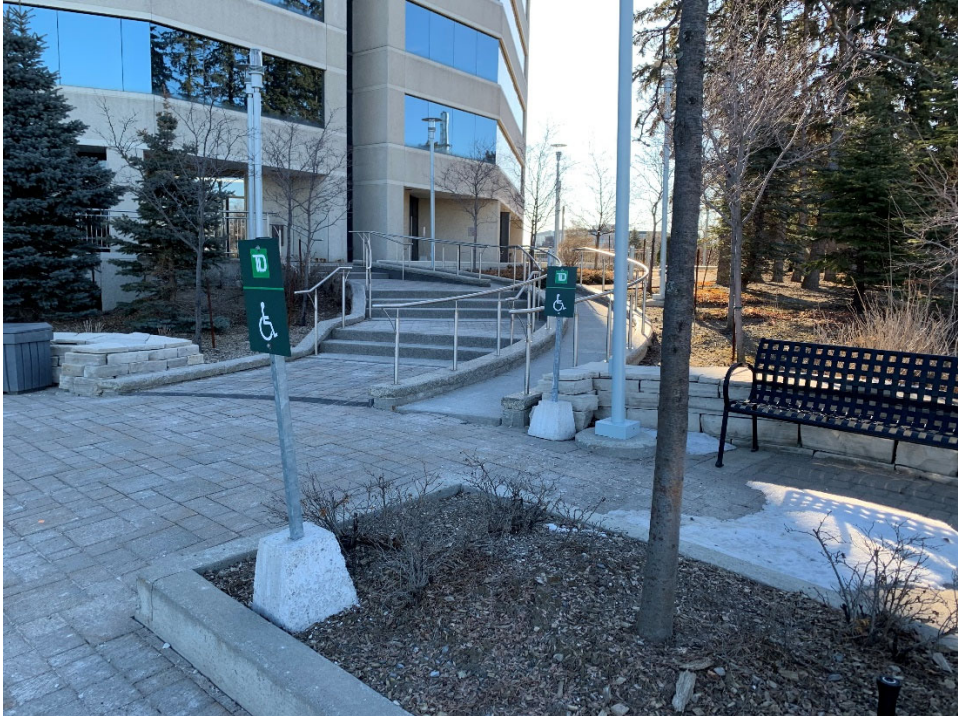
Photograph 5 – West entrance and ramp