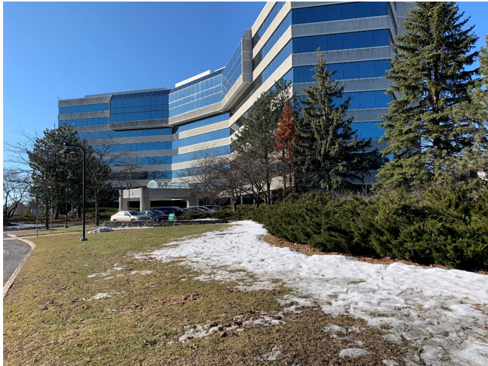
Photograph 3 – Trees and planting beds to the north