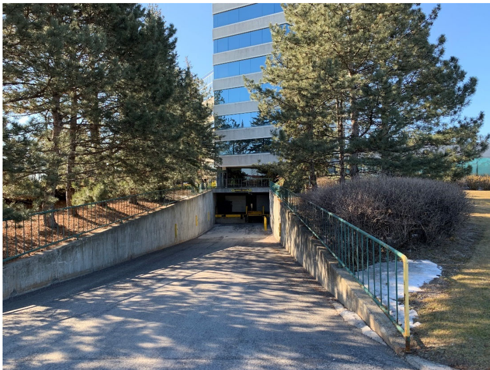
Photograph 4 – Trees and plantings beds bordering the loading ramp