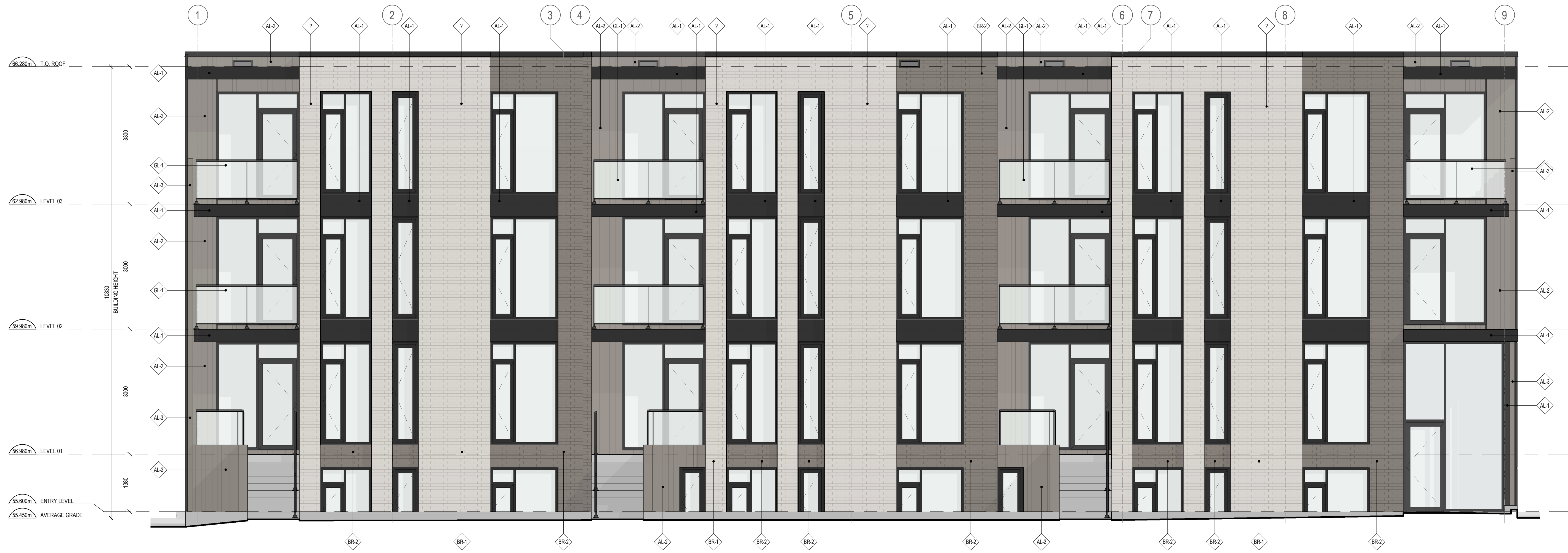
1 SOUTH ELEVATION A201 SCALE: 1 : 50

1 ISSUED FOR SITE PLAN CONTROL 2022-12-16 ISSUE RECORD