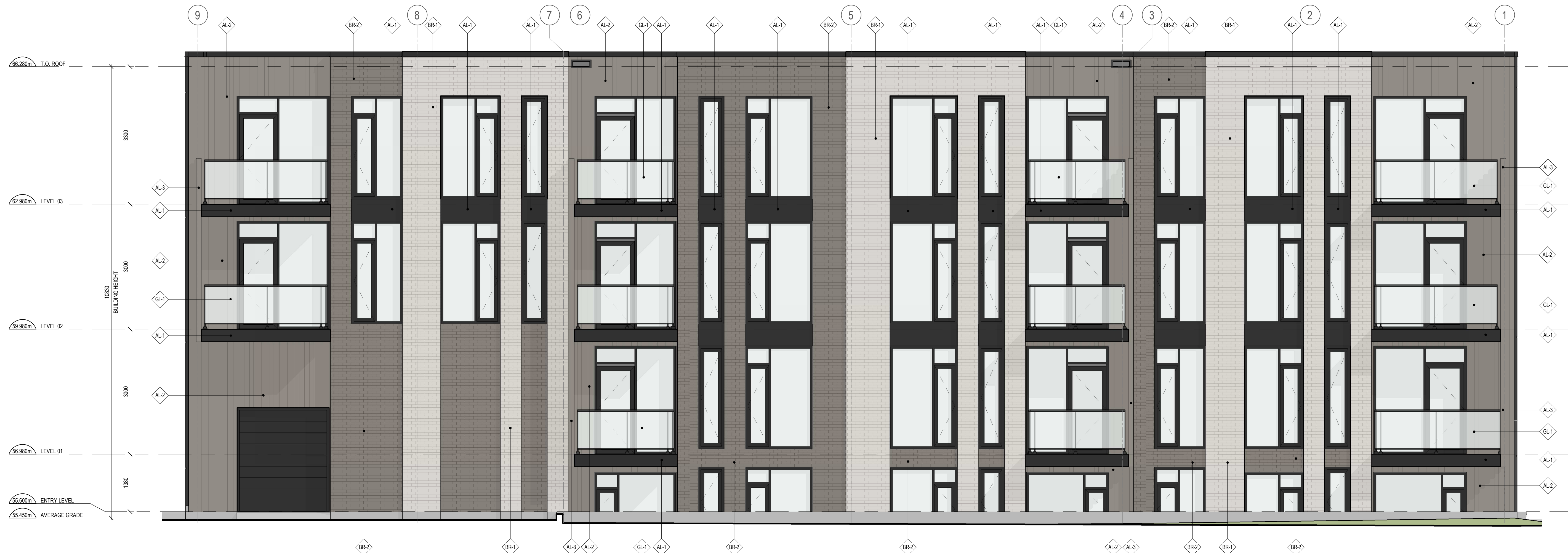
1 NORTH ELEVATION SCALE: 1 : 50

1 ISSUED FOR SITE PLAN CONTROL 2022-12-16 ISSUE RECORD