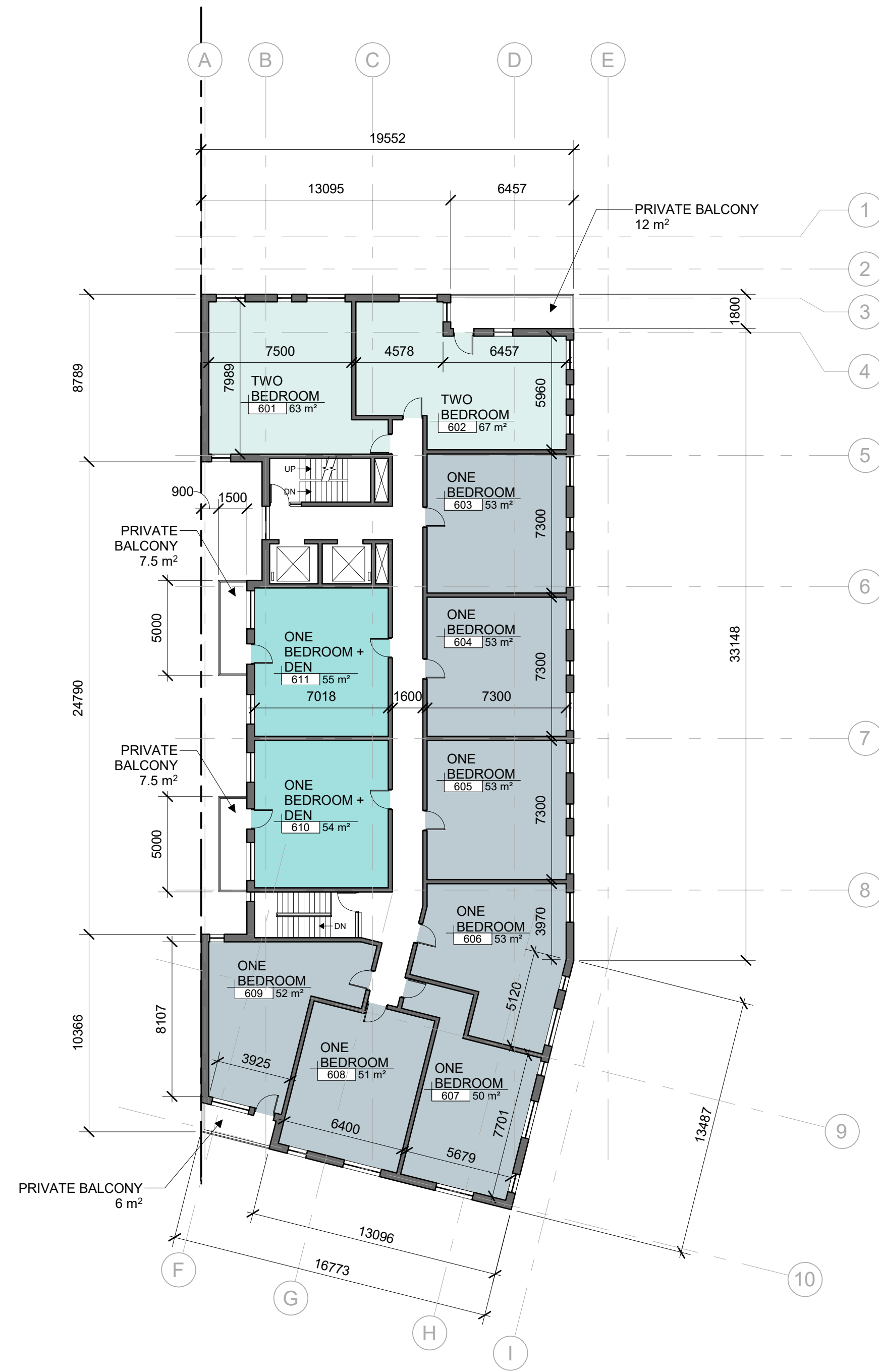
2 SIXTH FLOOR PLAN