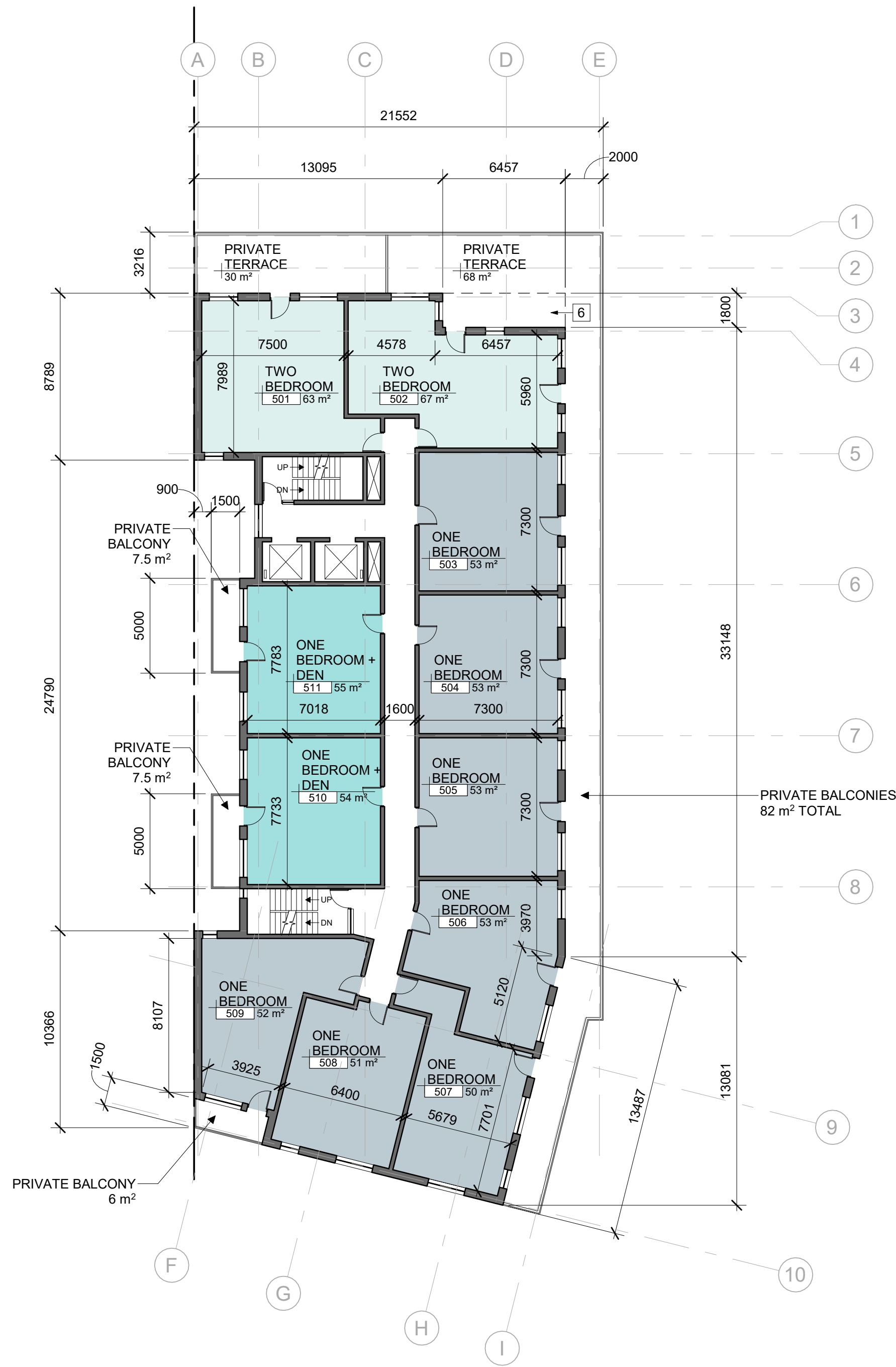
1 FIFTH FLOOR PLAN