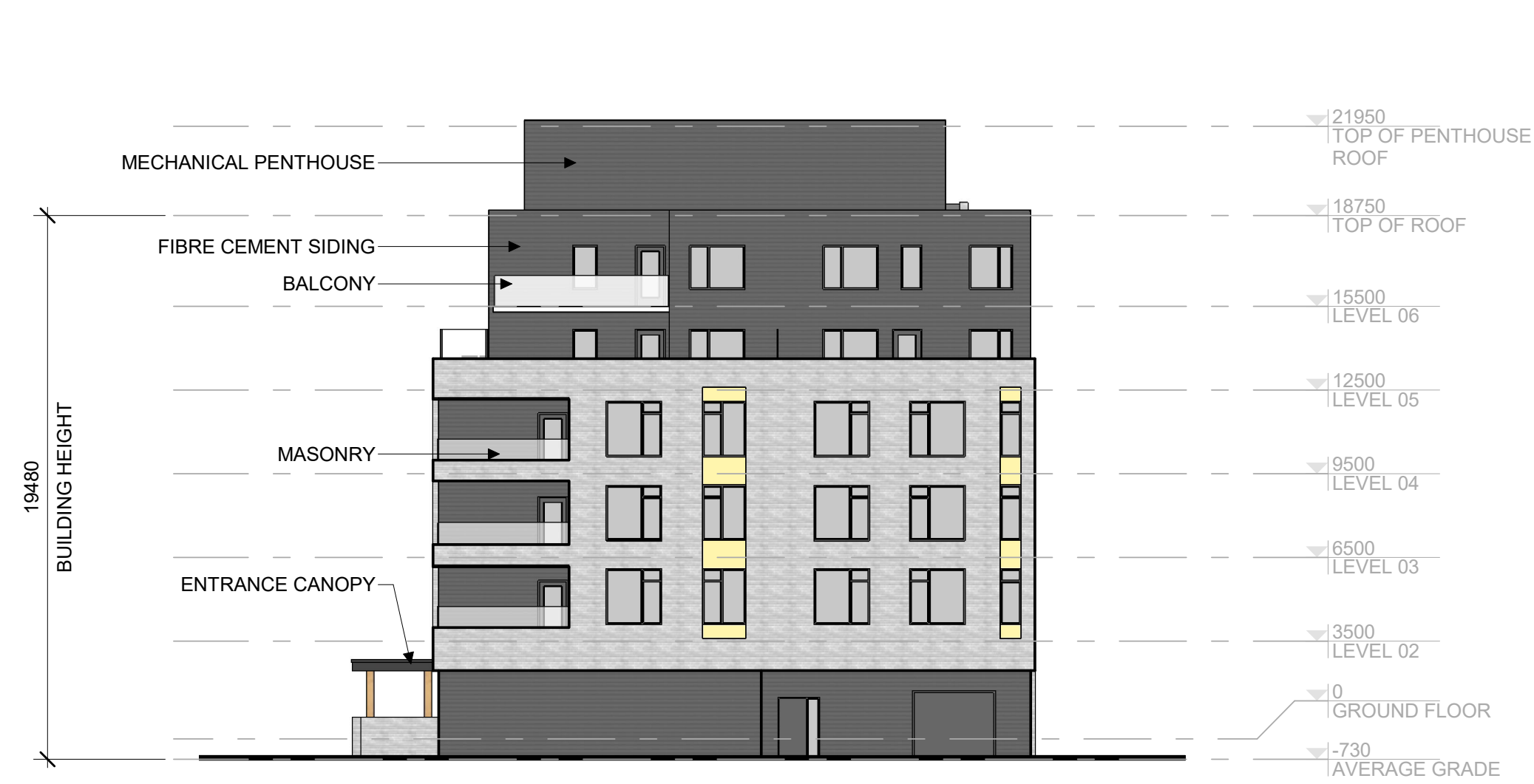
1 North Elevation A.300 | 1:200