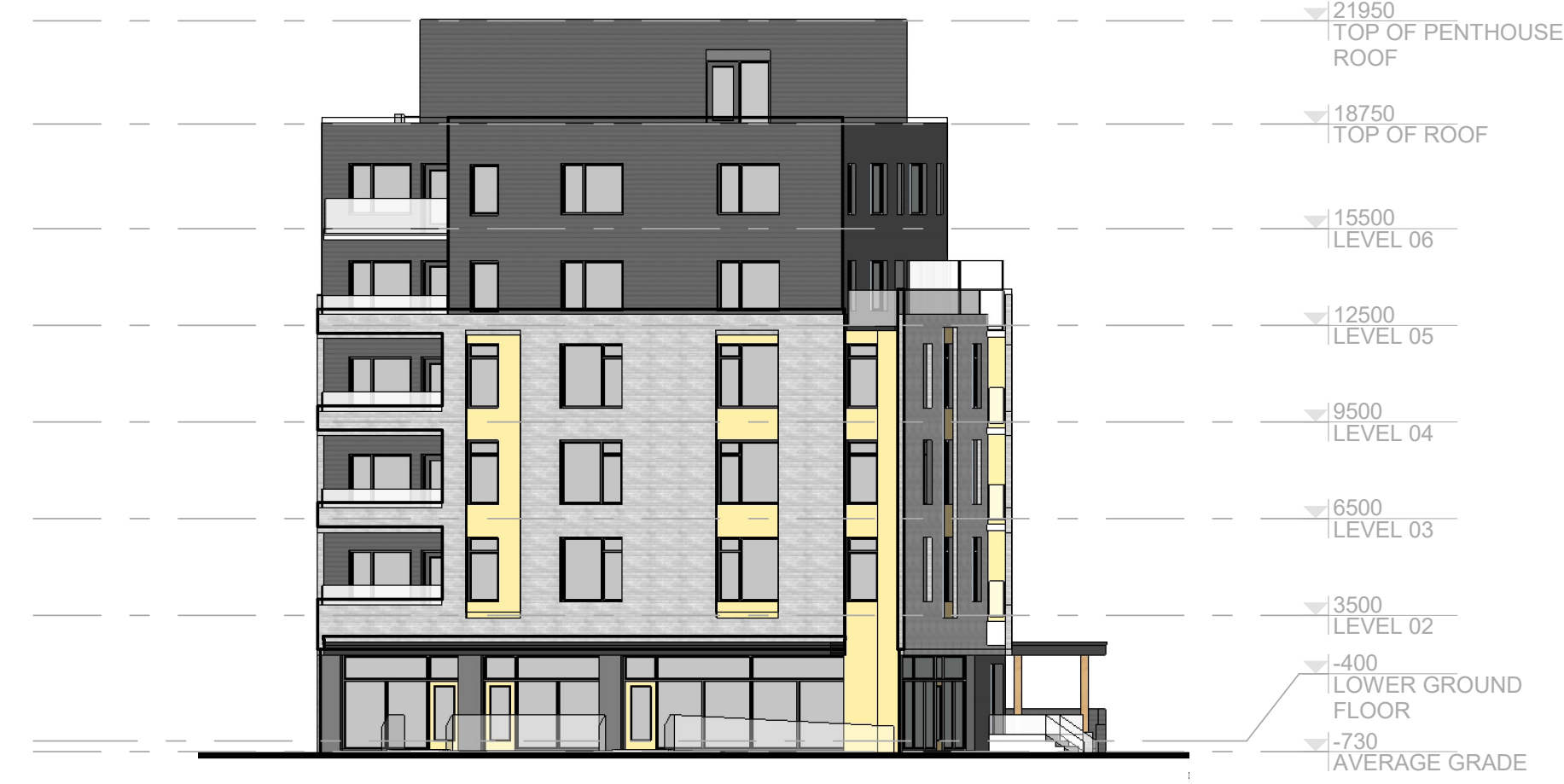
3 SOUTH ELEVATION A.300 | 1:200