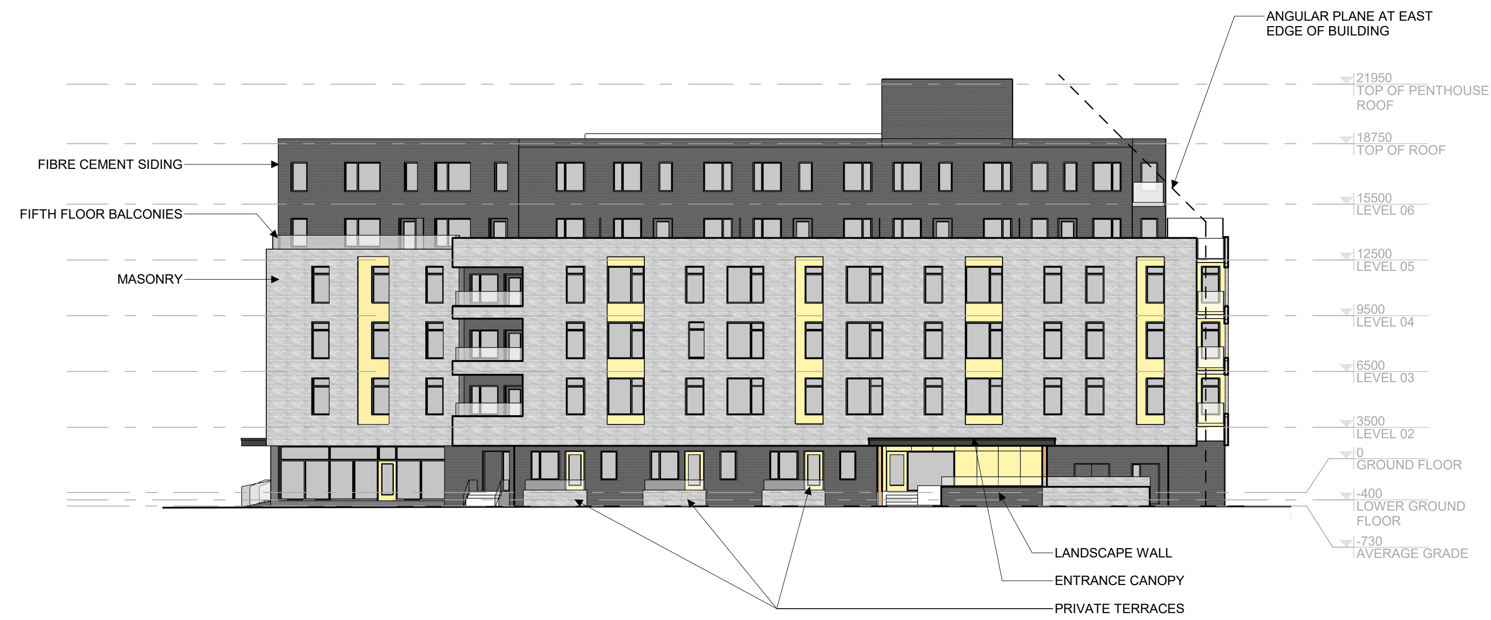
2 EAST ELEVATION A.300 | 1:200