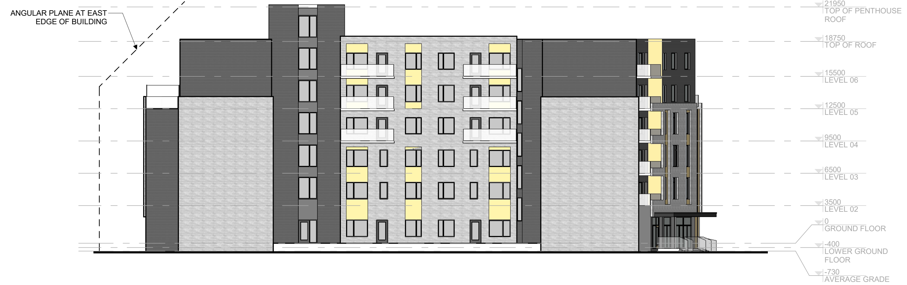
4 WEST ELEVATION A.300 | 1:200