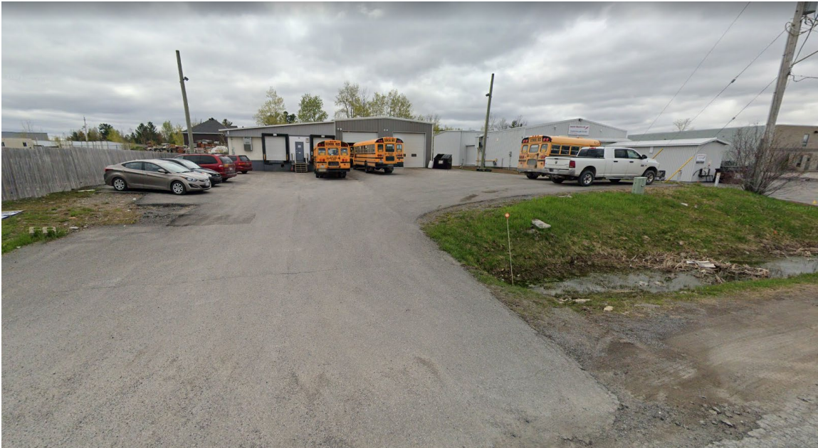
Figure 2: street view of the property.