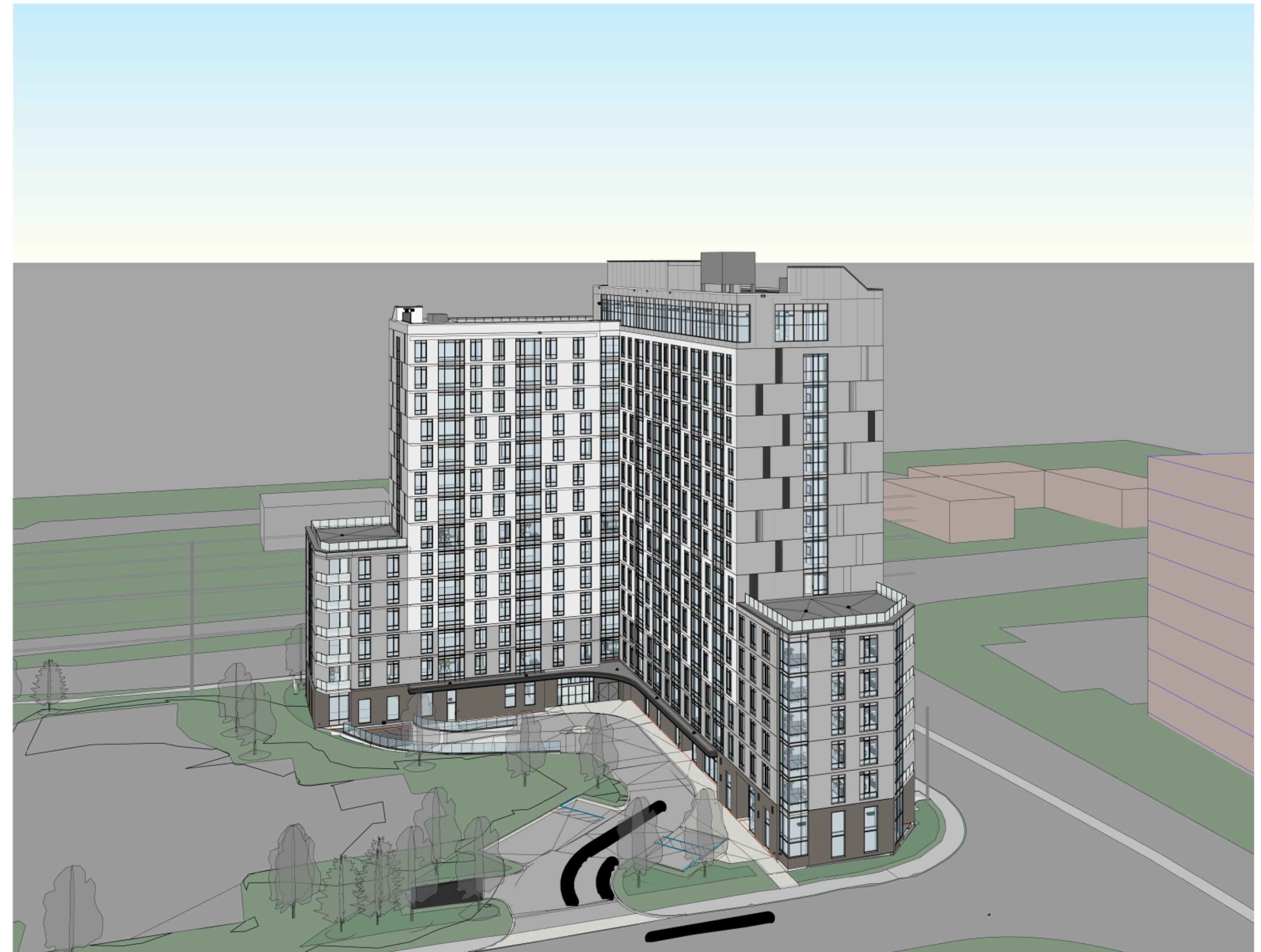
2 3D VIEW FROM SW @ COURTYARD (GENERAL REF ONLY) A305