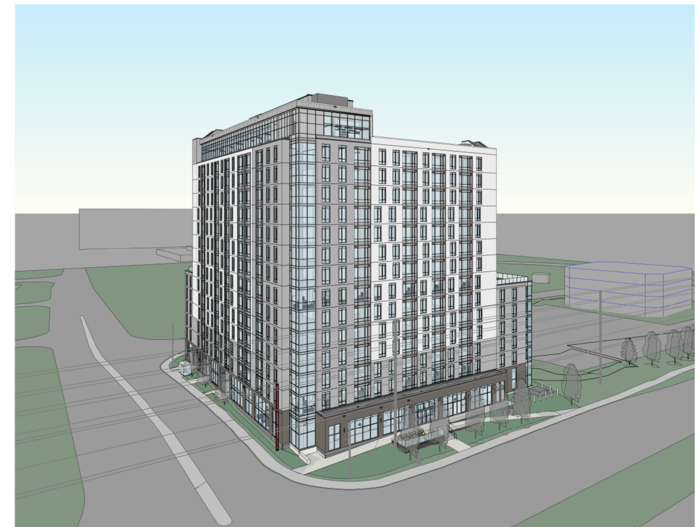
1 3D VIEW FROM NE @ BASELINE & CONSTELLATION (GENERAL REF ONLY) A305