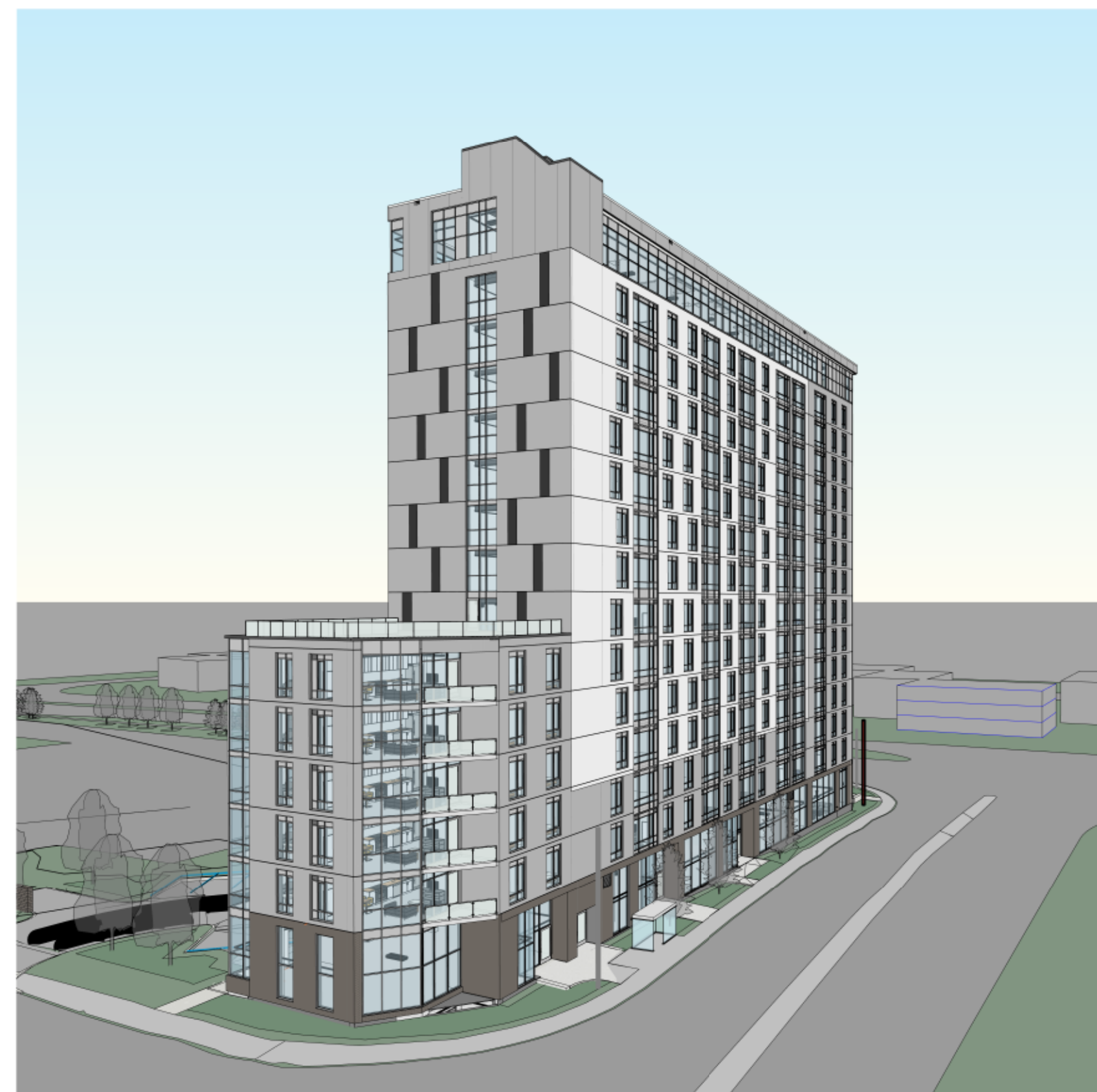
3 3D VIEW FROM S @ CONSTELLATION (GENERAL REF ONLY) A305