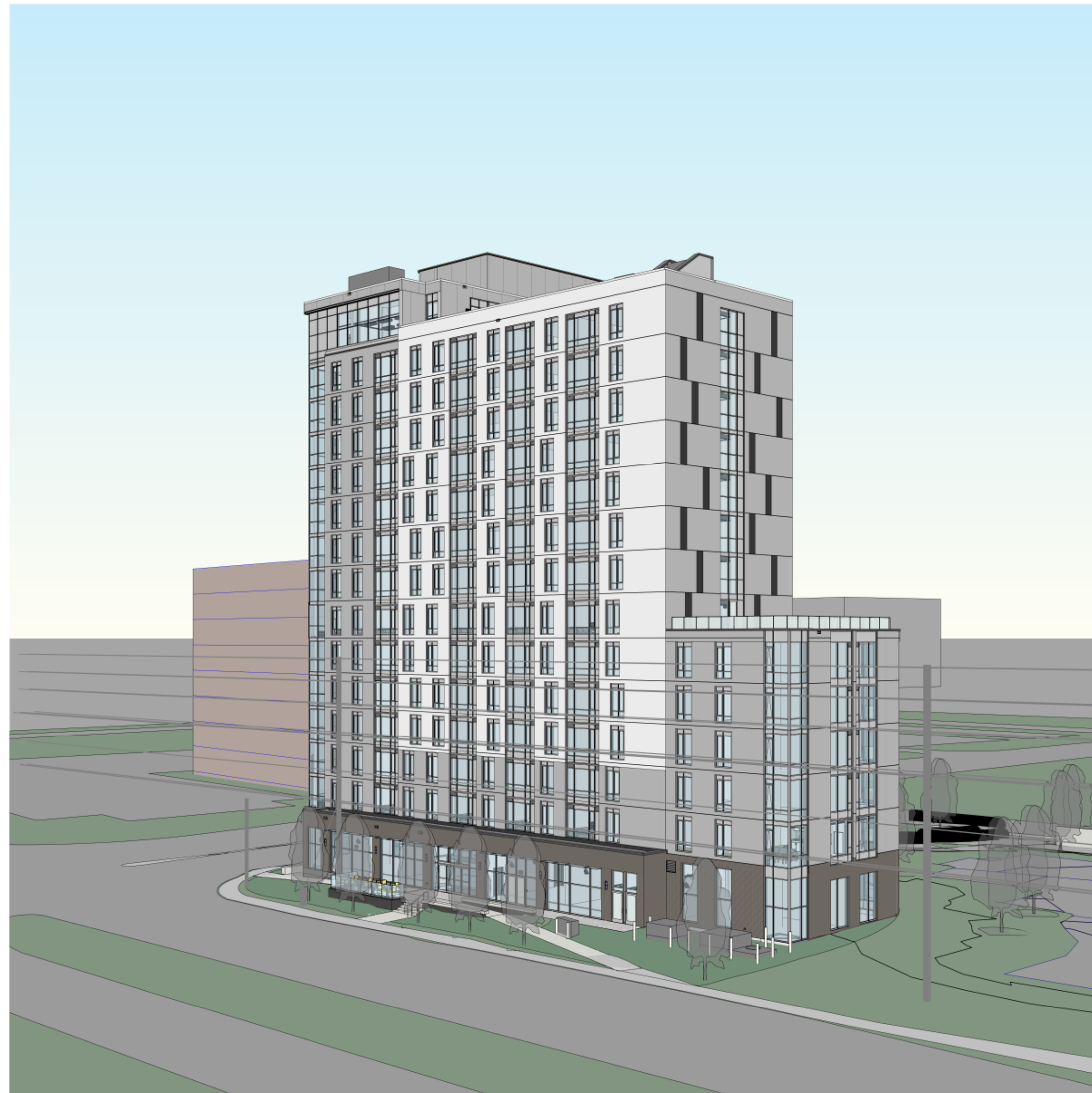
4 3D VIEW FROM NW @ BASELINE RD (GENERAL REF ONLY) A305