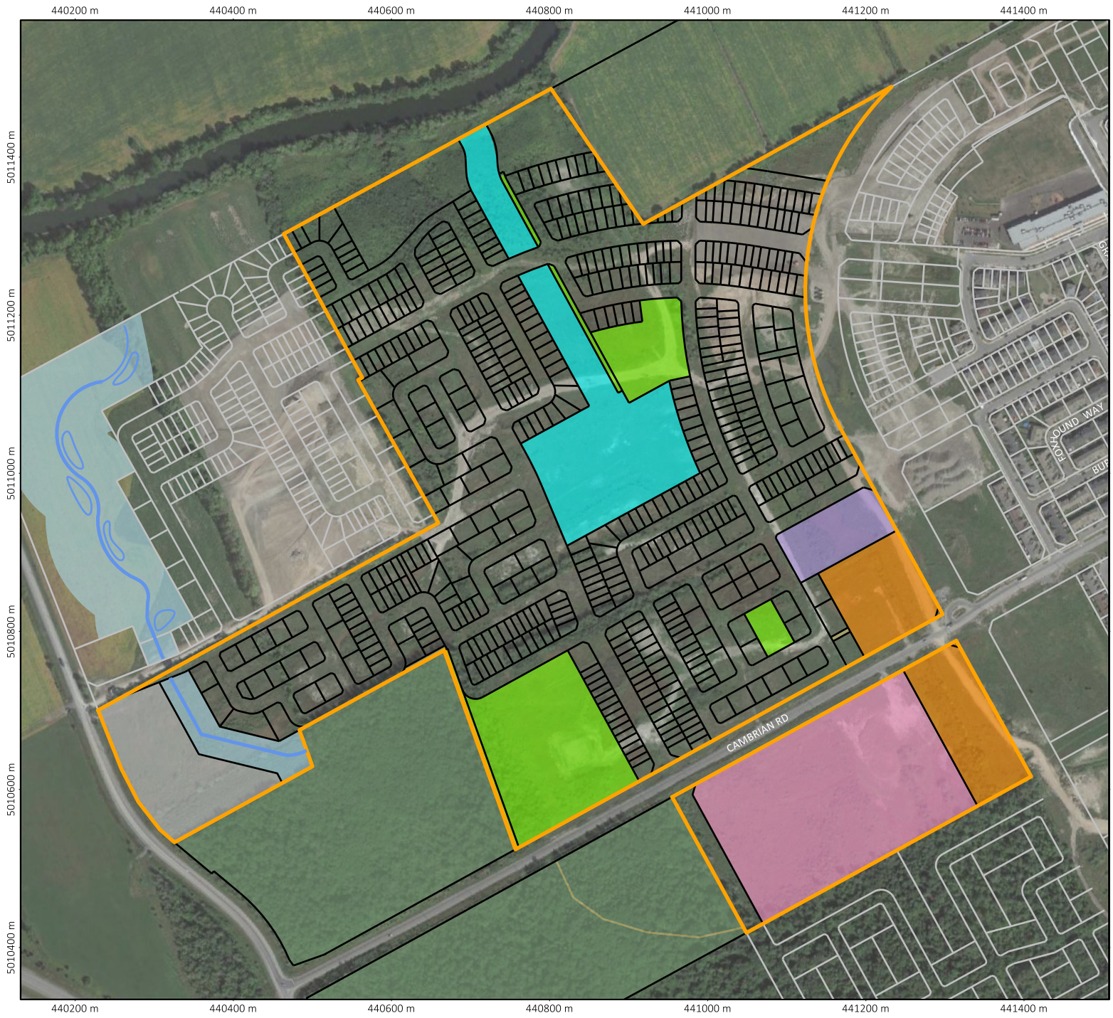
Figure 2: Community plan