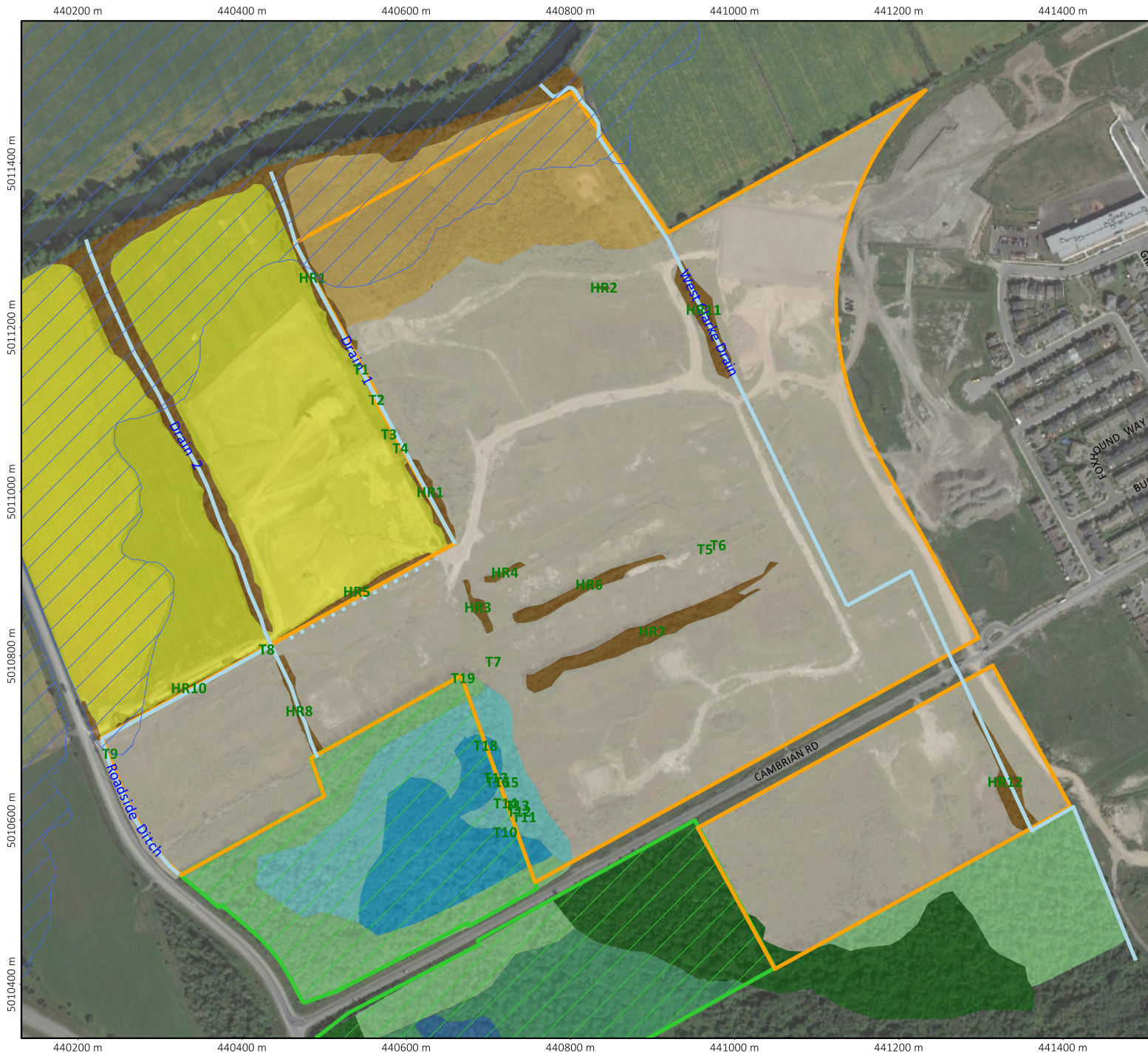
Figure 1: Current vegetation and tree distribution.