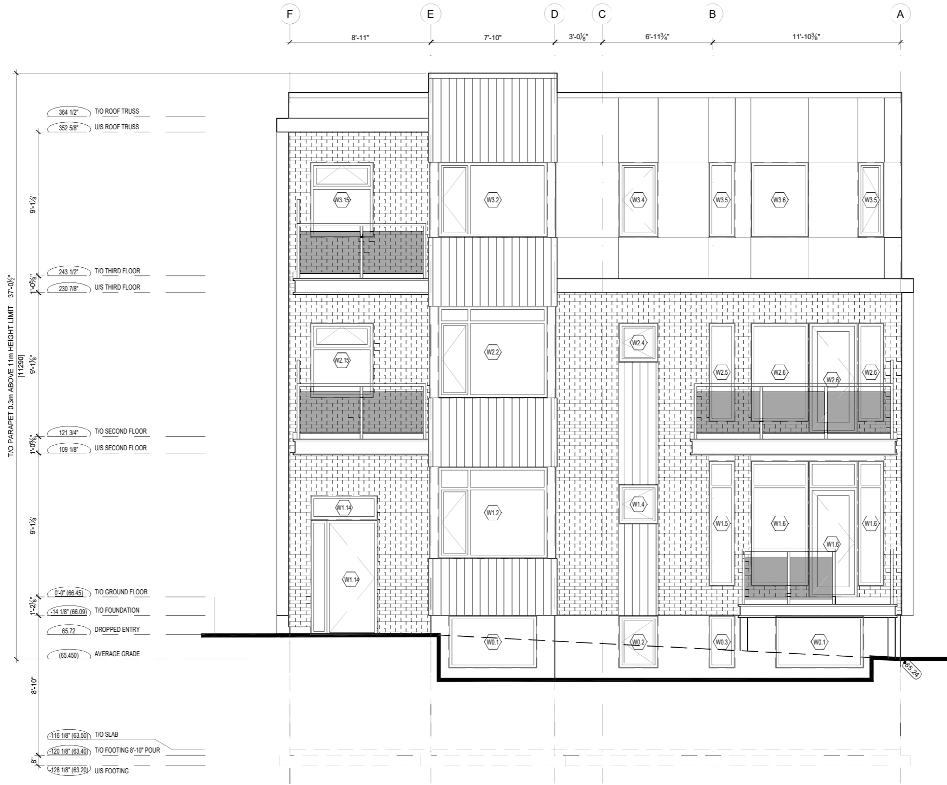
1 FRONT ELEVATION A2.1 SCALE: 1/4"=1'-0"

Drawing name: C:\Users\jhill\OneDrive\Work\From Home\March 19C\131 Tweedsmuir AP2.131.dwg; Date: 2022/03/01; Author: J.HILL; Elevation: 66.45; Plot Date: 2022/05/16