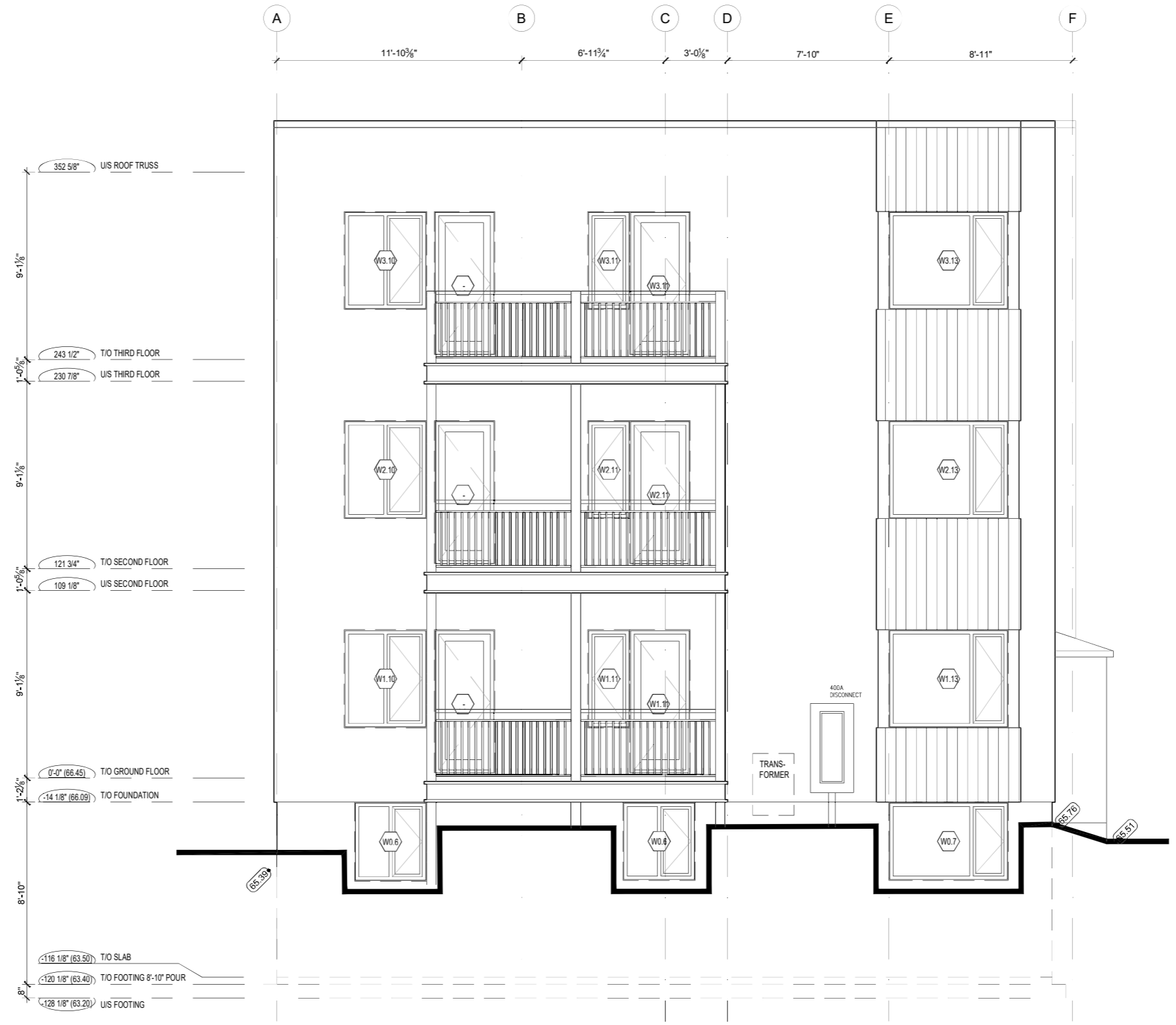
1 LEFT ELEVATION A2.2 SCALE: 1/4"=1'-0"

Drawing name: C:\Users\rosal\OneDrive\Work\From Home\March 19C2131 Tweedsmuir A2C2131.dwg; Date: 2022/05/16 10:51:51 AM; User: rosal