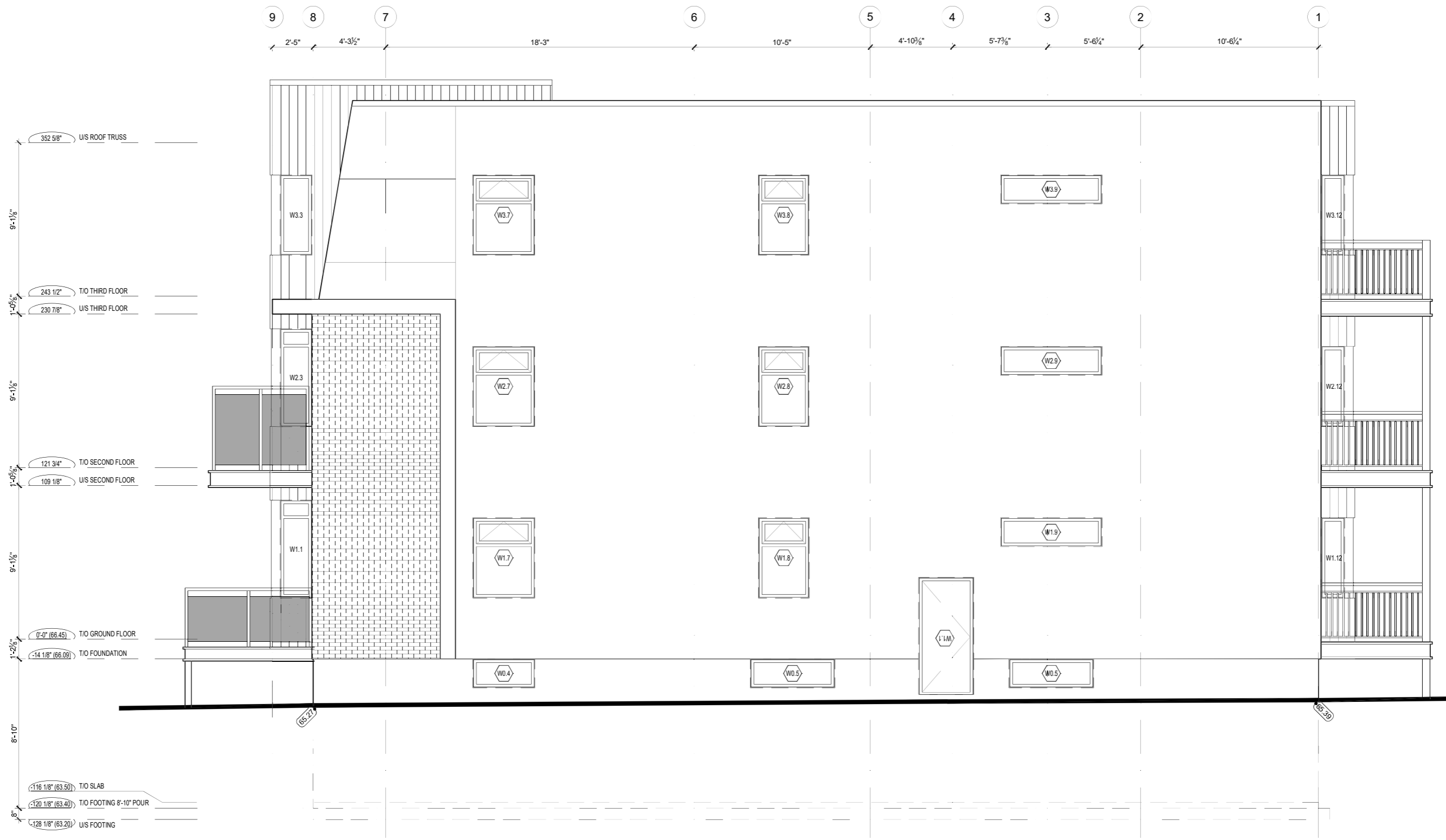
1 BUILDING SECTION A3.1 SCALE: 1/4"=1'-0"

Drawing name: C:\Users\jhill\OneDrive\Work\From Home\March 19C\131 Tweedsmuir A3.1.dwg; Date: 2022/03/01; Author: J.Hill; Elevation: 1/4"=1'-0"