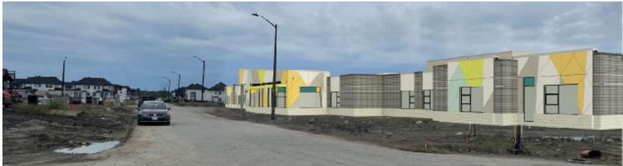
View from intersection of Solarium Ave and Brian Good Ave with current context