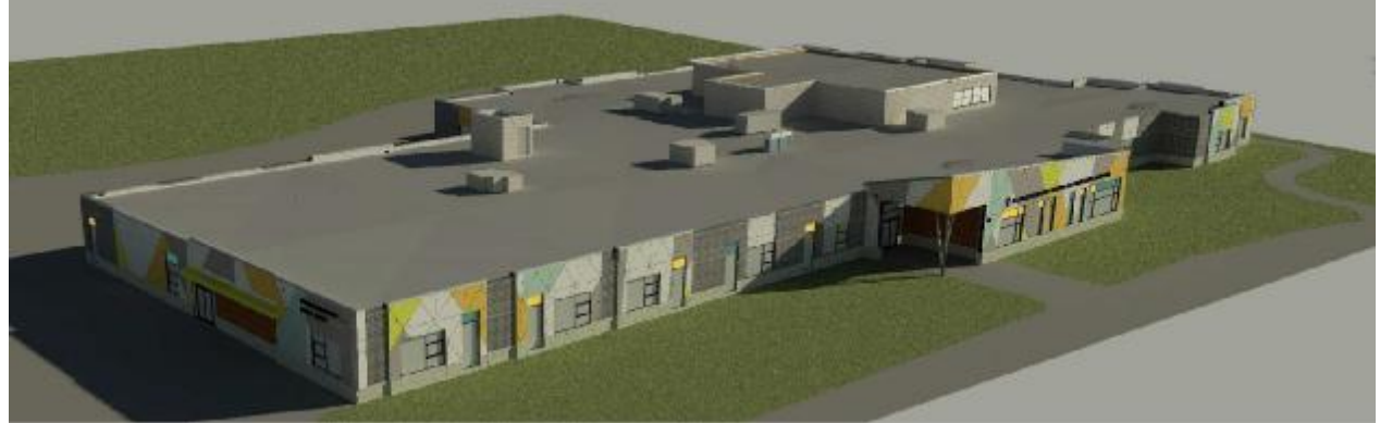
Massing model looking to the West from Solarium Ave (Childcare Entrance and Main Entrance)

See below proposed building perspectives of the building massing.