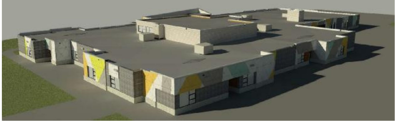
Massing model looking to the South from Brian Good Ave (rear of building)