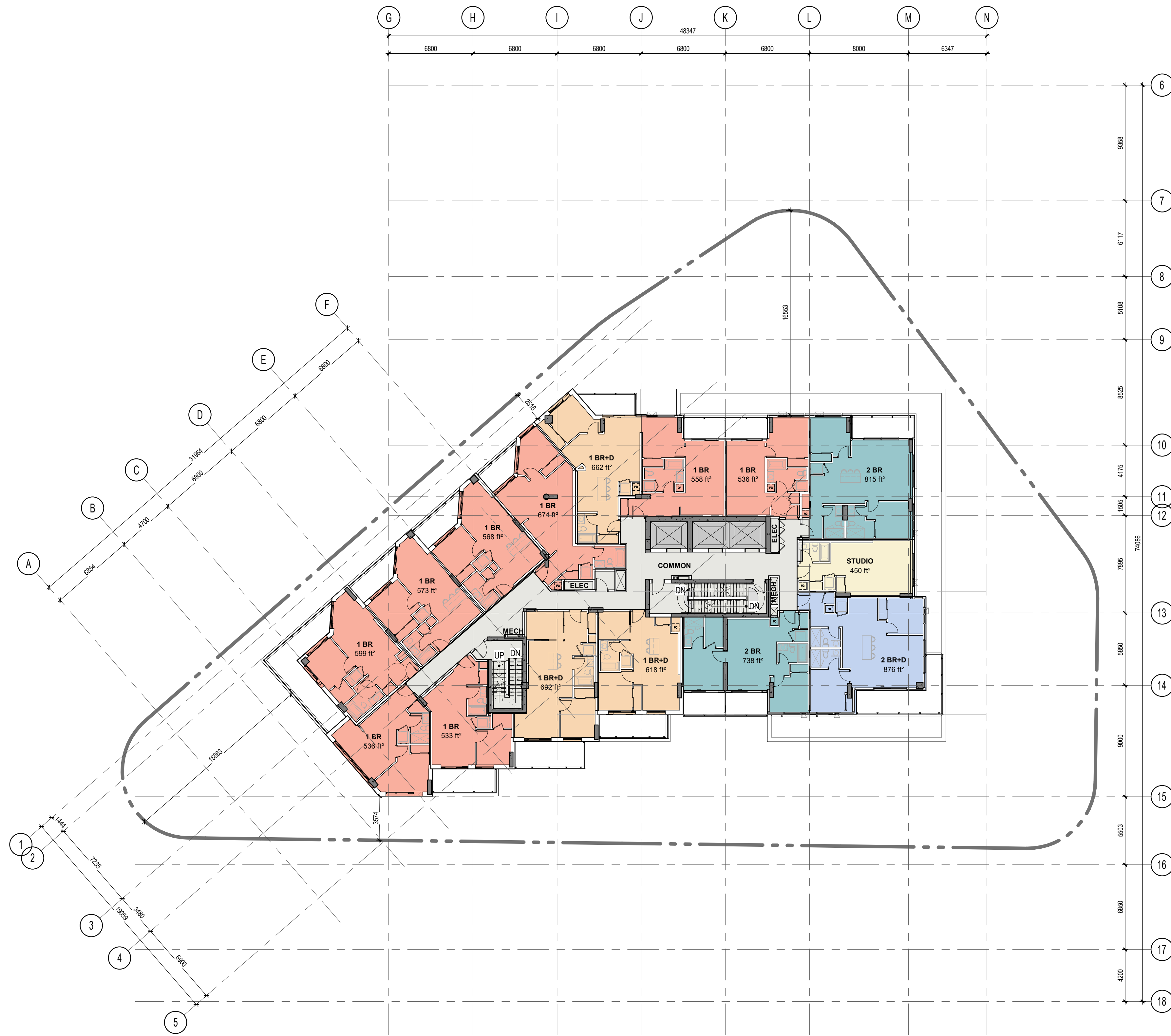
OVERALL PLAN - LEVEL 6-8