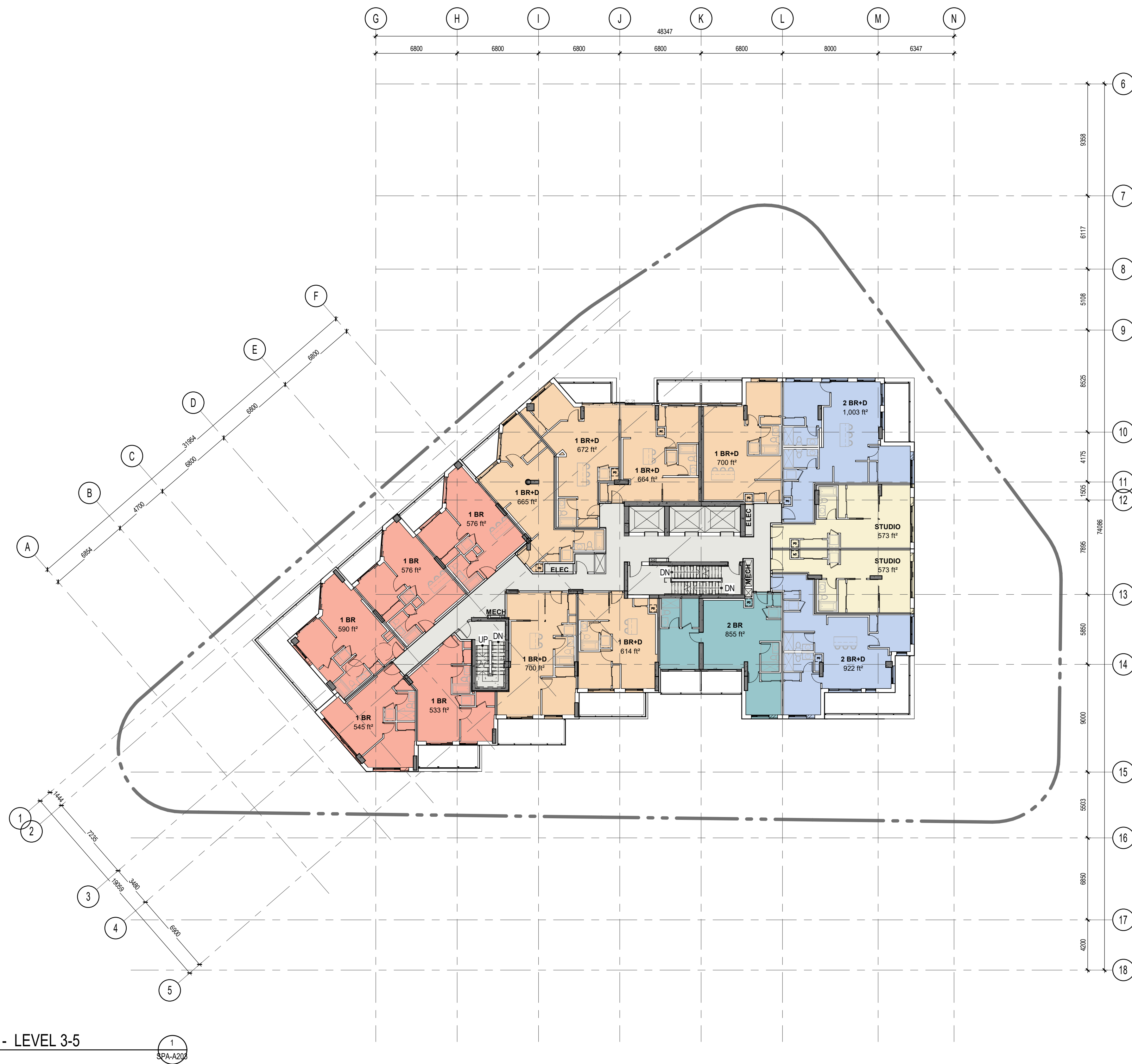
OVERALL PLAN - LEVEL 3-5 1:200