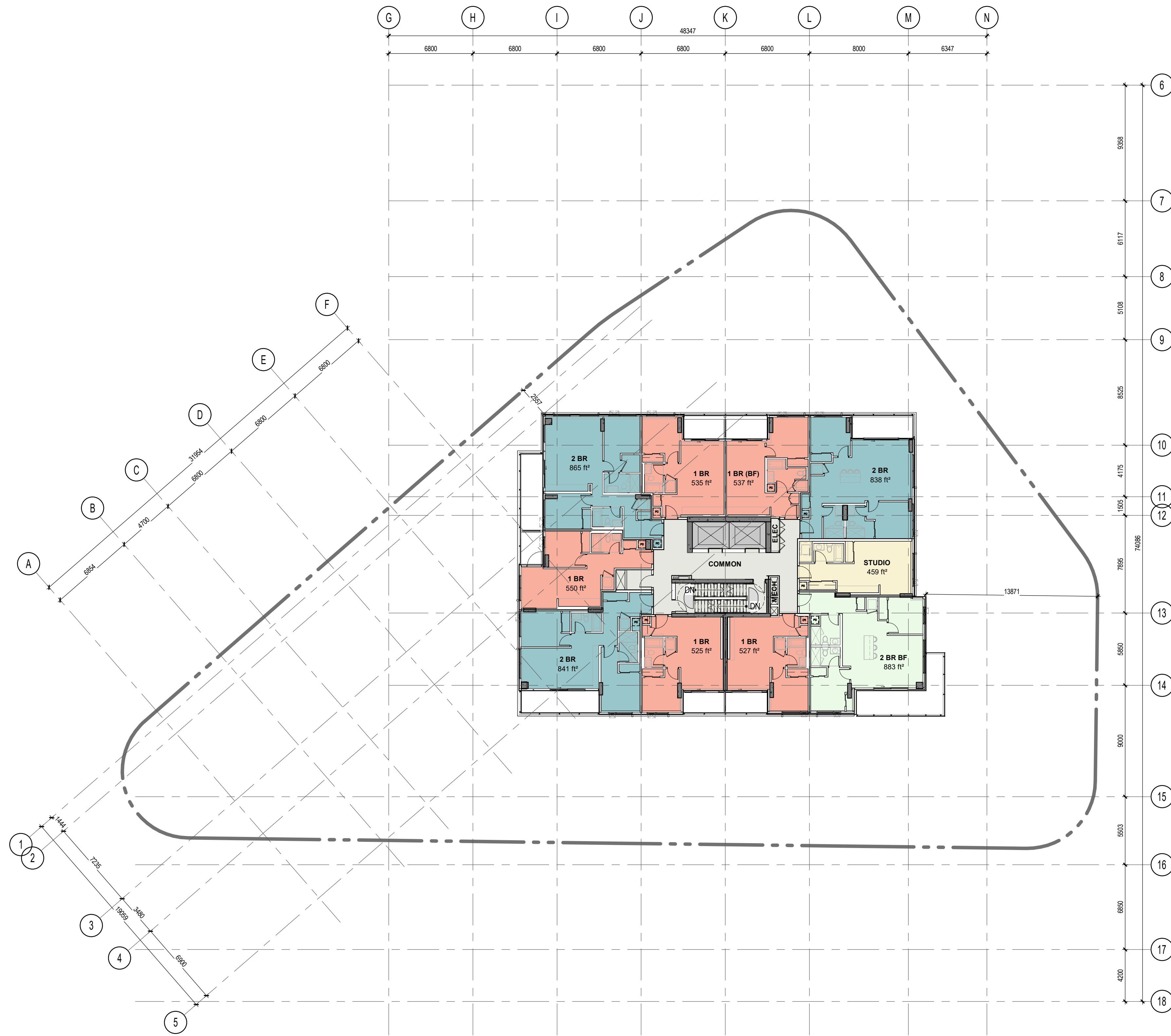
OVERALL PLAN - LEVEL 11-22 1:200