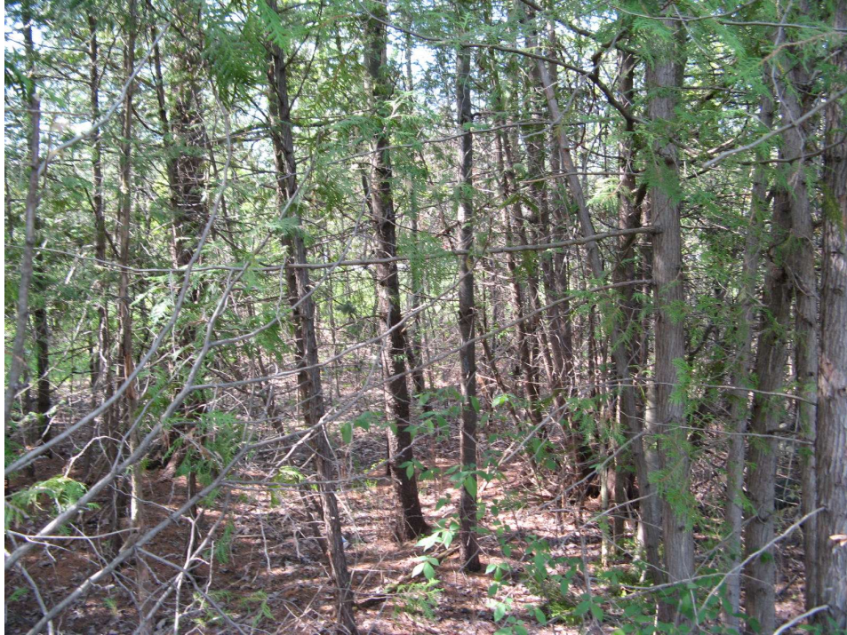
Photo 3 – Upland mixed forest in the southwest portion of the site where south portion of clinic is proposed. View looking west