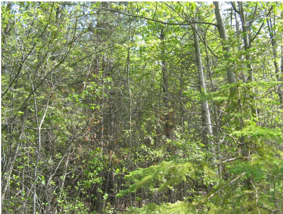
Photo 4 – Upland mixed forest in the north portion of the site will be retained. View looking north