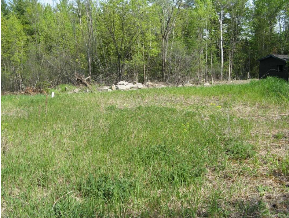
Photo 1 – Cultural meadow habitat in the central portion of the site. View looking north