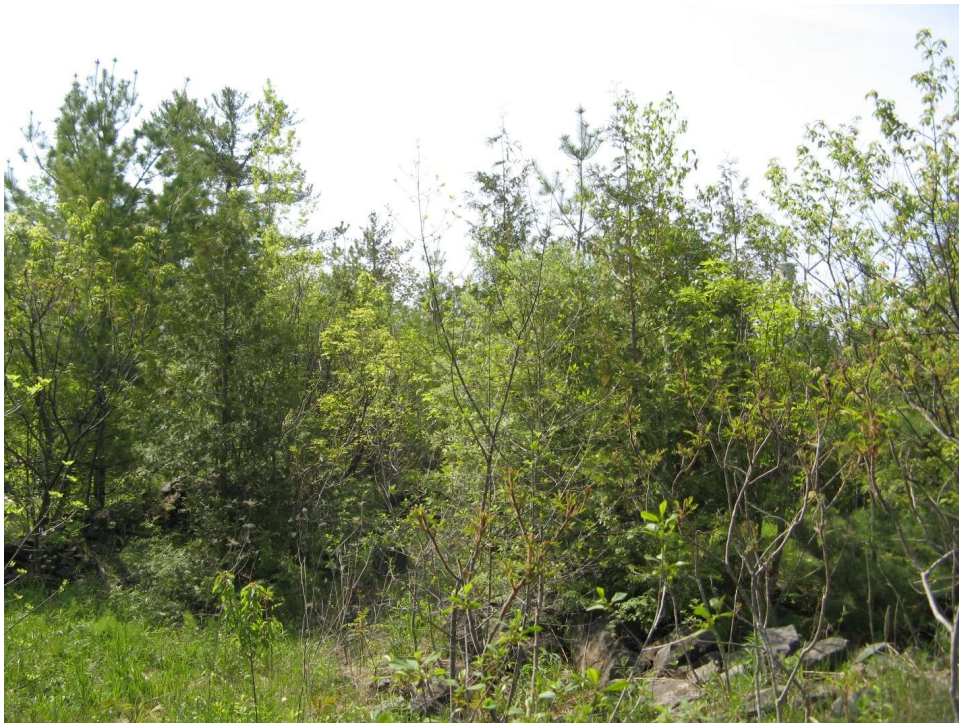
Photo 2 – Thicket habitat in the west portion of the site, east of Dunrobin Road. View looking west