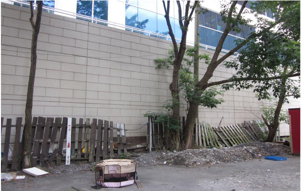
Picture 2. Boles of trees #1-4 (left to right) at 150 Laurier Avenue West (note snow clearing damage at base).