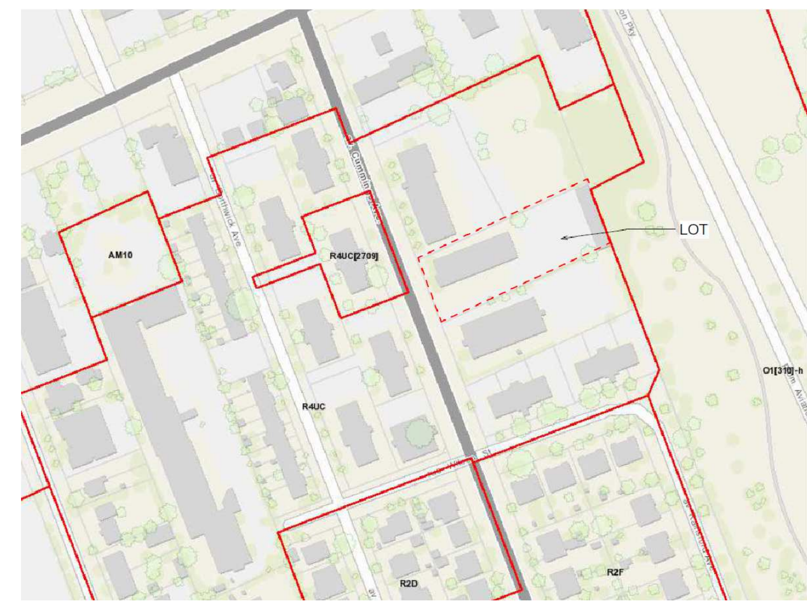
ZONING PLAN 2 SP01 N.T.S.