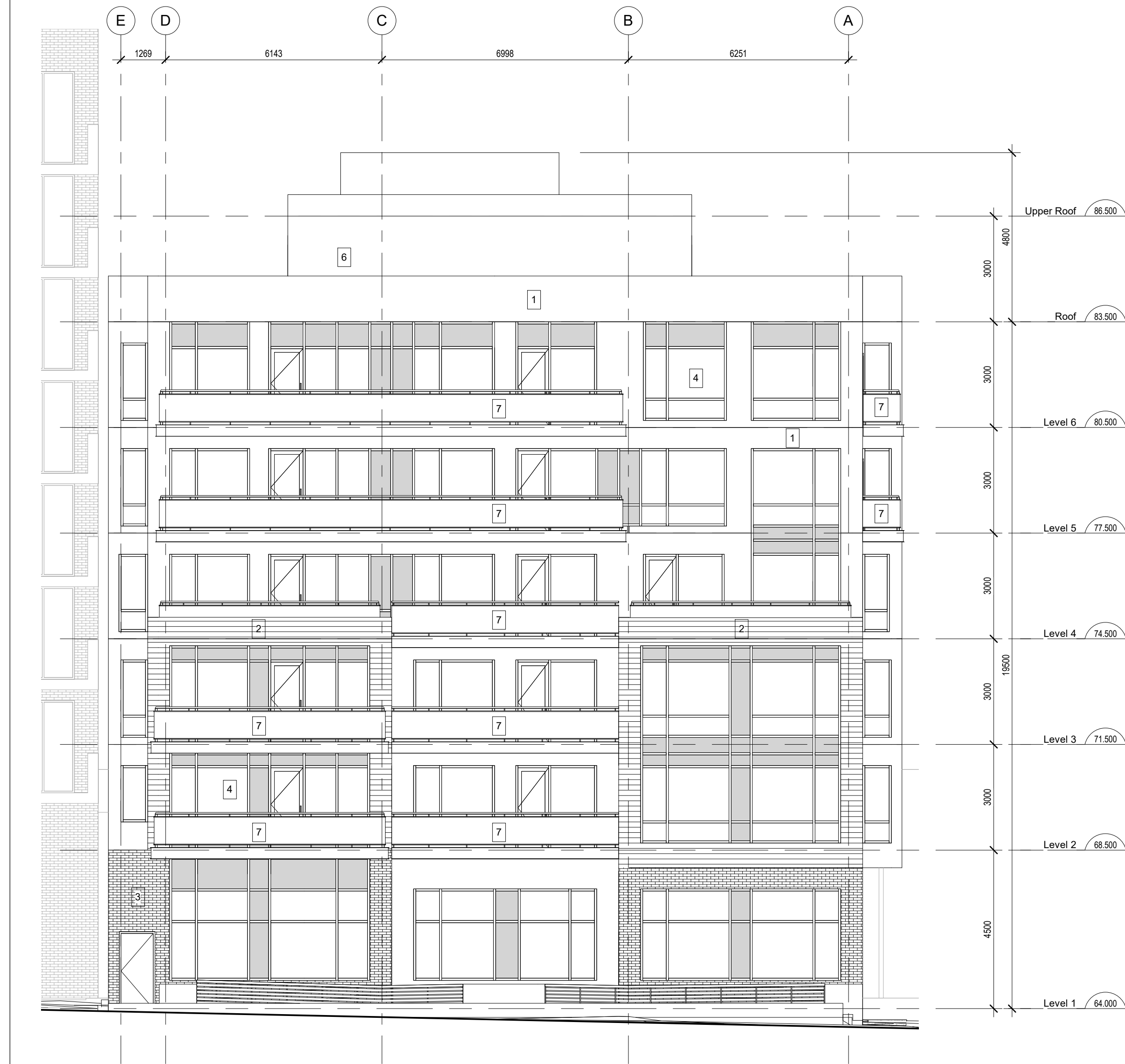
2 EAST ELEVATION A-200 SCALE 1 : 100