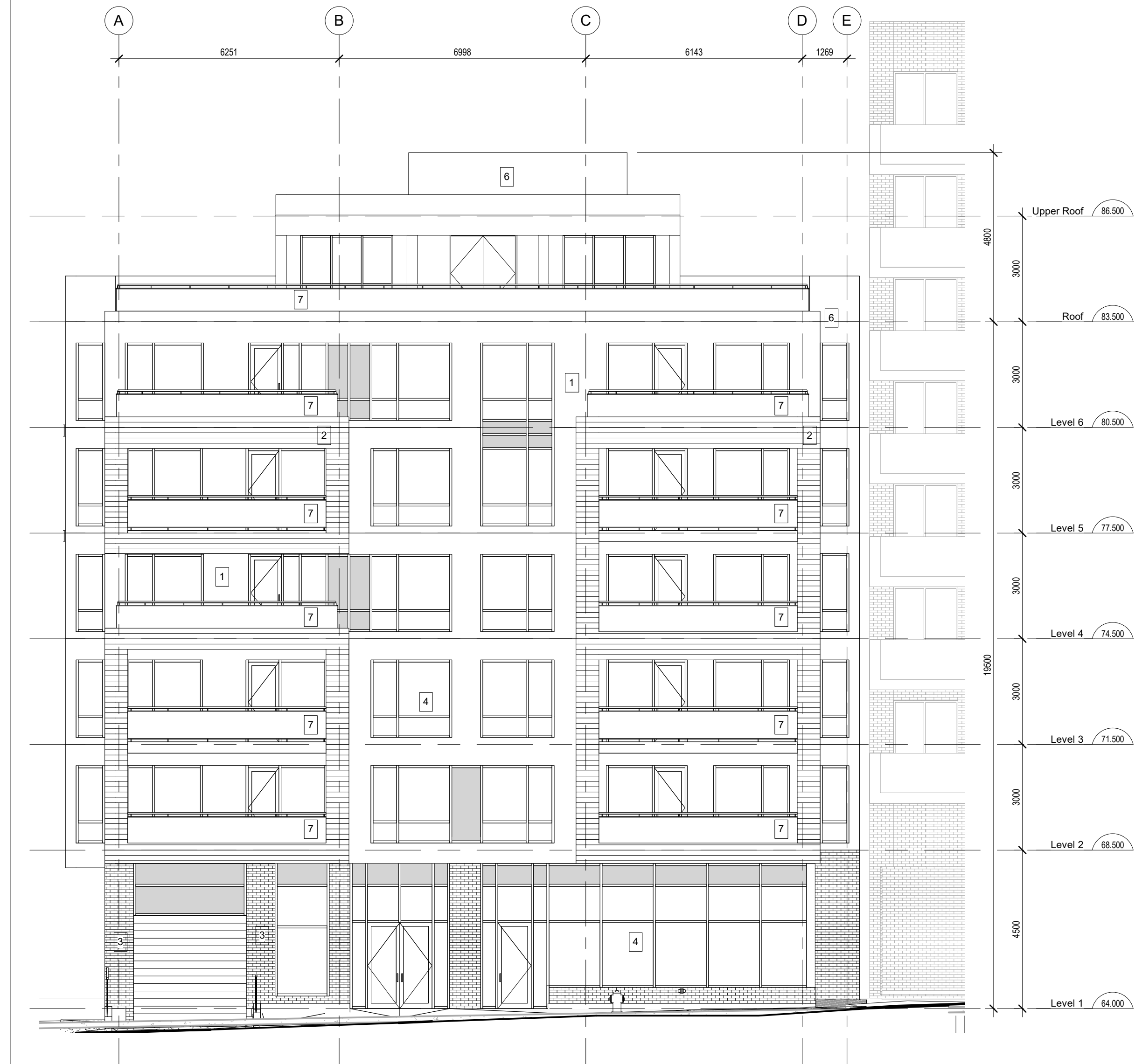
1 WEST ELEVATION A-200 SCALE 1 : 100

NOTE: THIS DRAWING IS THE PROPERTY OF THE ARCHITECT AND MAY NOT BE REPRODUCED OR USED WITHOUT THE EXPRESSED CONSENT OF THE ARCHITECT. THE CONTRACTOR SHALL CHECK AND VERIFY ALL DIMENSIONS AND REPORT ANY OMISSIONS OR DISCREPANCIES TO THE ARCHITECT BEFORE PROCEEDING WITH THE WORK.