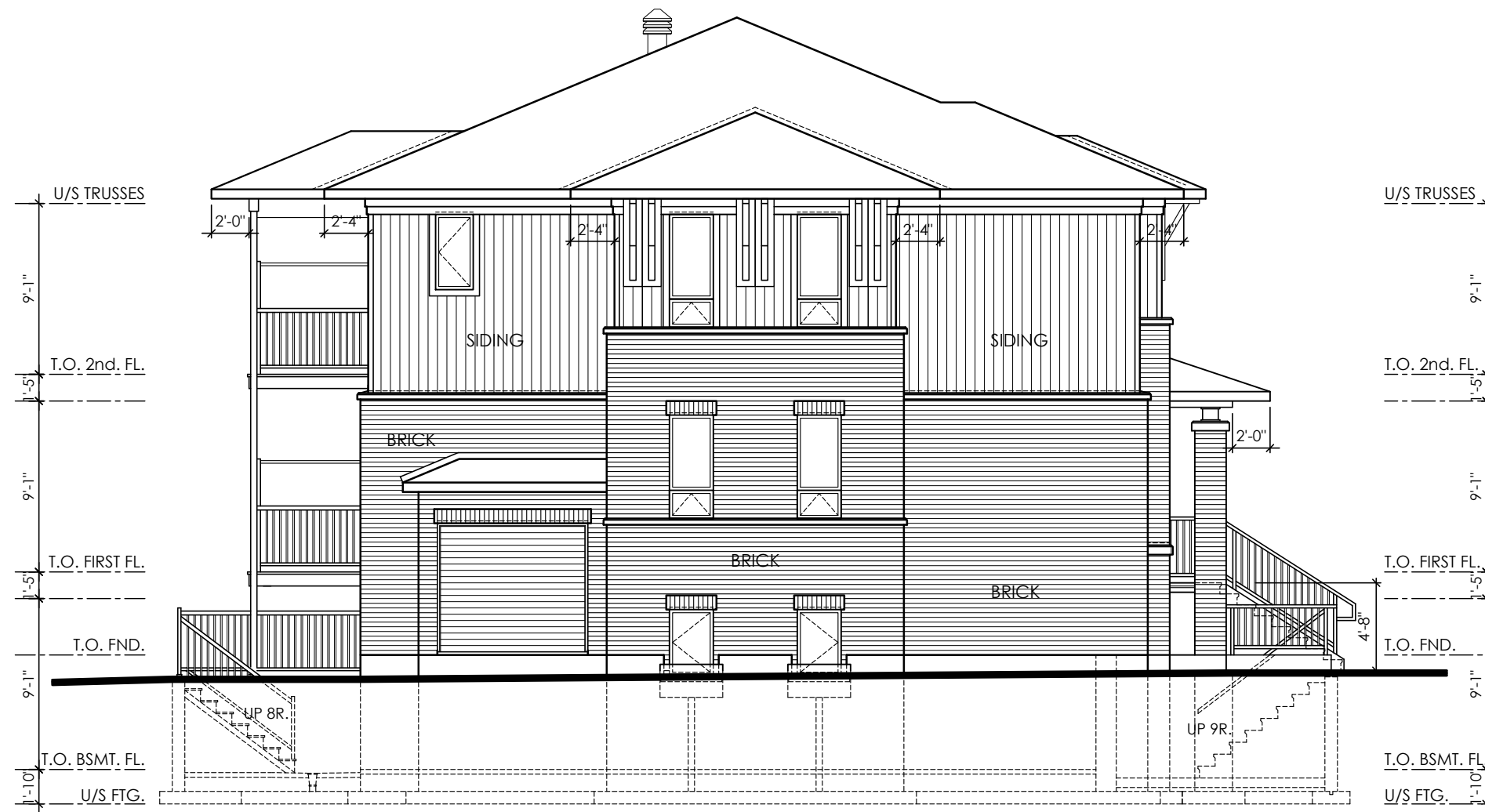
END UNIT, STREET SIDE ELEVATION