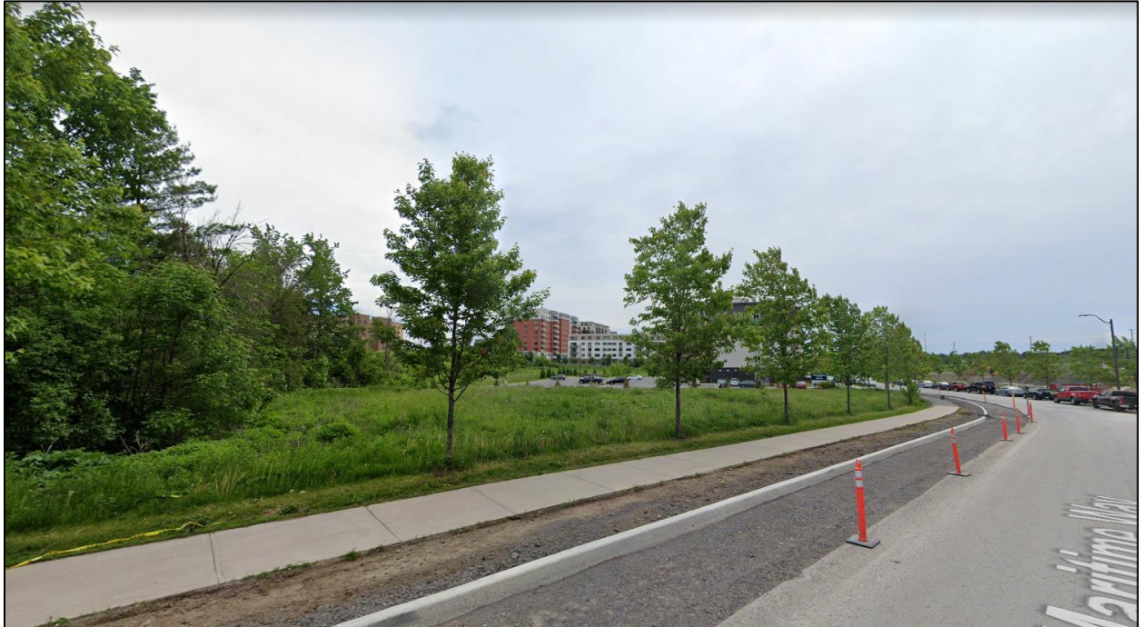
Site Photo 3)