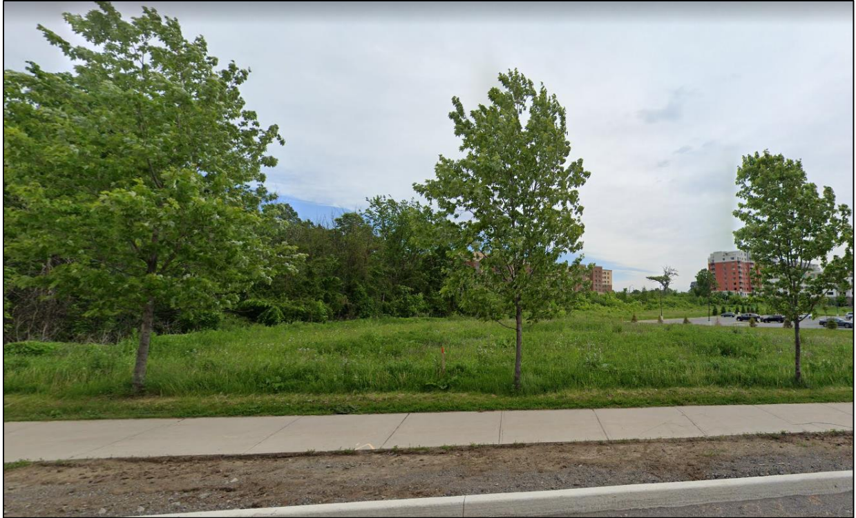
Site Photo 4)