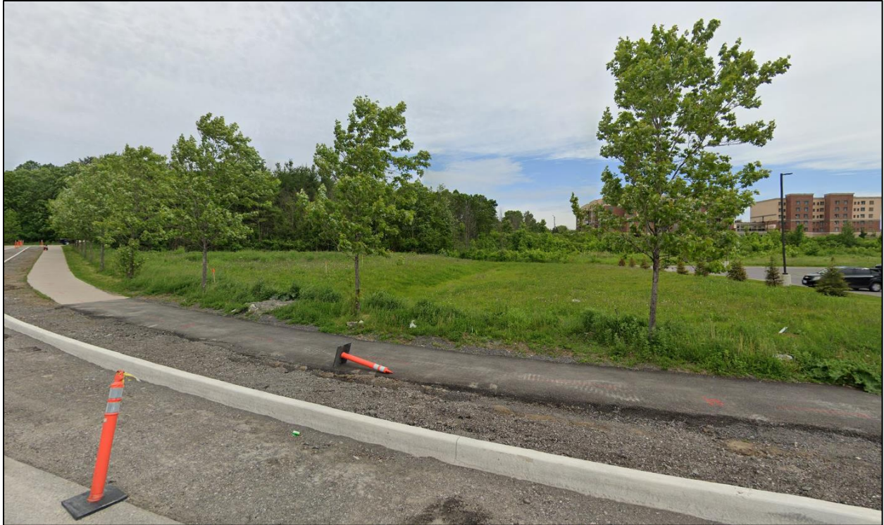
Site Photo 2)