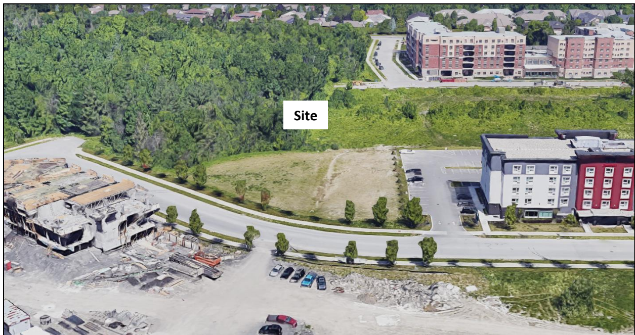
Site Photo 1)

Within the analysis of the site's immediate 100-meter radius, there is very little in the way of key destinations, transit stations, or public spaces. Within this radius we find Marriott's TownePlace Suites, a comparatively similar example to this proposal, which has been successfully incorporated into the existing urban fabric in a manner similar to our expectations of this proposal. The only other existing architecture is the Timberwalk Retirement Community across Maritime Way. This project, 1 story taller than our proposal roughly fits with the visible urban densification of the area as well. These projects, being of a similar nature, speak to the quality of the urban fabric's as being suitable for this manner of architecture, from the perspective of both scale and character.