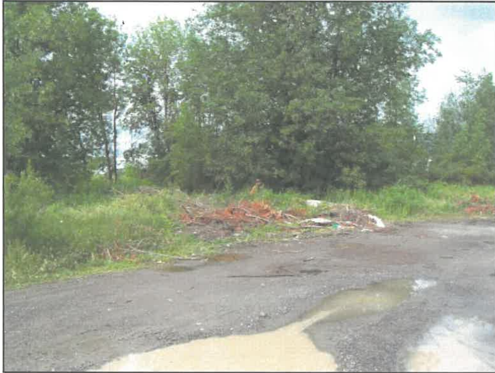
View of western portion of the Site. Debris and dumped wastes visible.