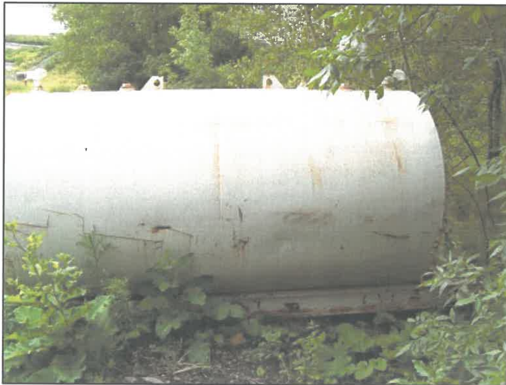
AST with visible dents and rust located north of the Site at 2900 Sheffield Road.