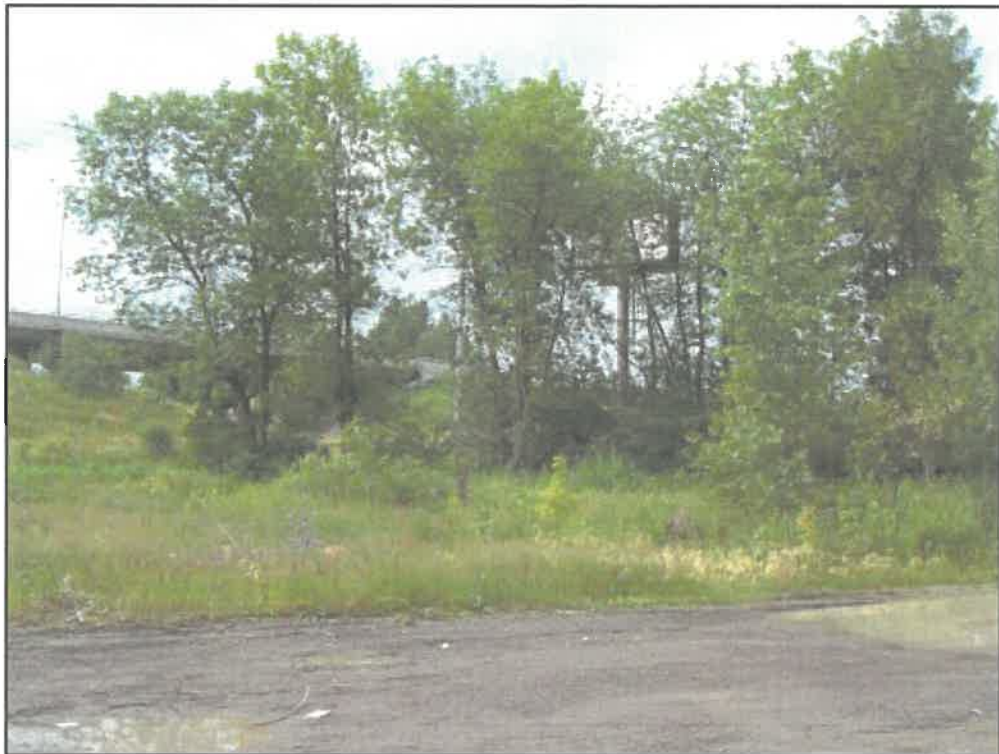
View of vegetated southern portion of the Site and adjacent vacant property, looking south towards Walkley Road.