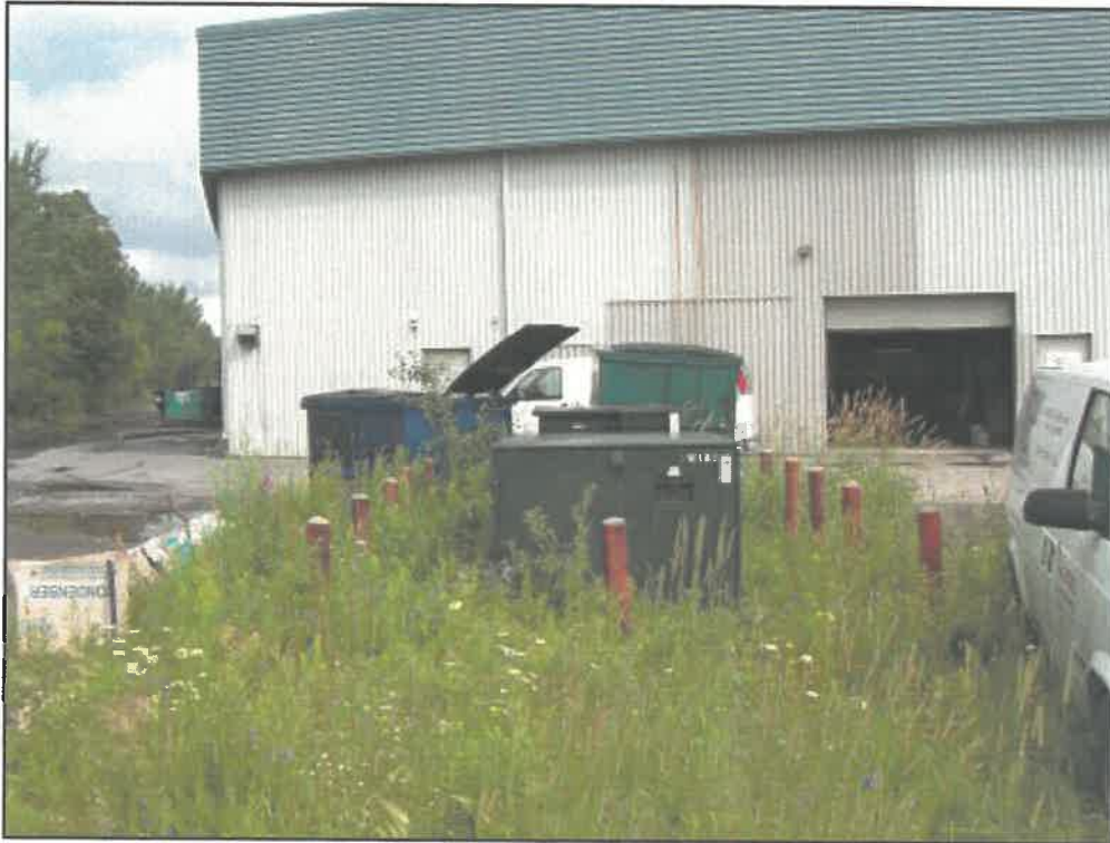
View of the two transformers and the remaining two dumpsters located on-site.