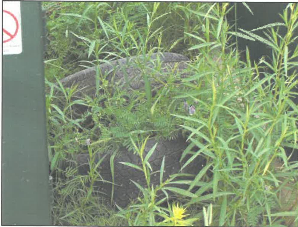
Tires dumped between the transformers located on-site.