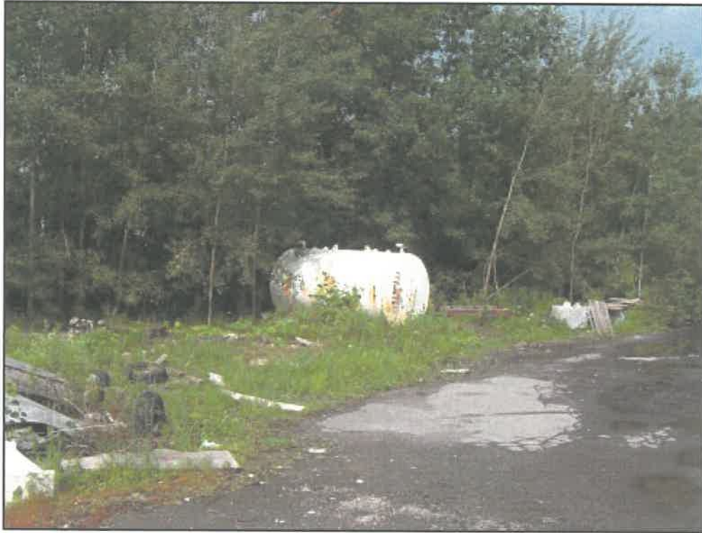
Abandoned aboveground storage tank (AST) located north of the Site at 2900 Sheffield Road.