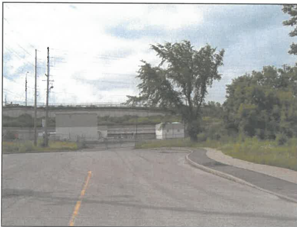
Electrical substation located southeast of the Site.