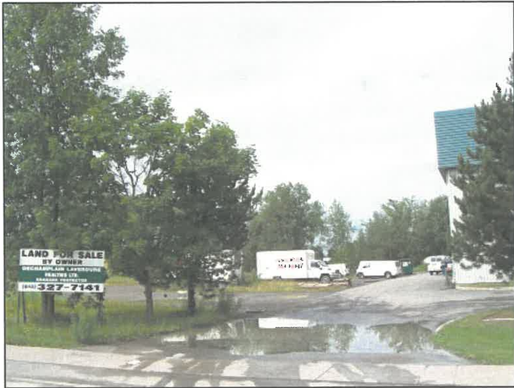
View of Site from Sheffield Road.