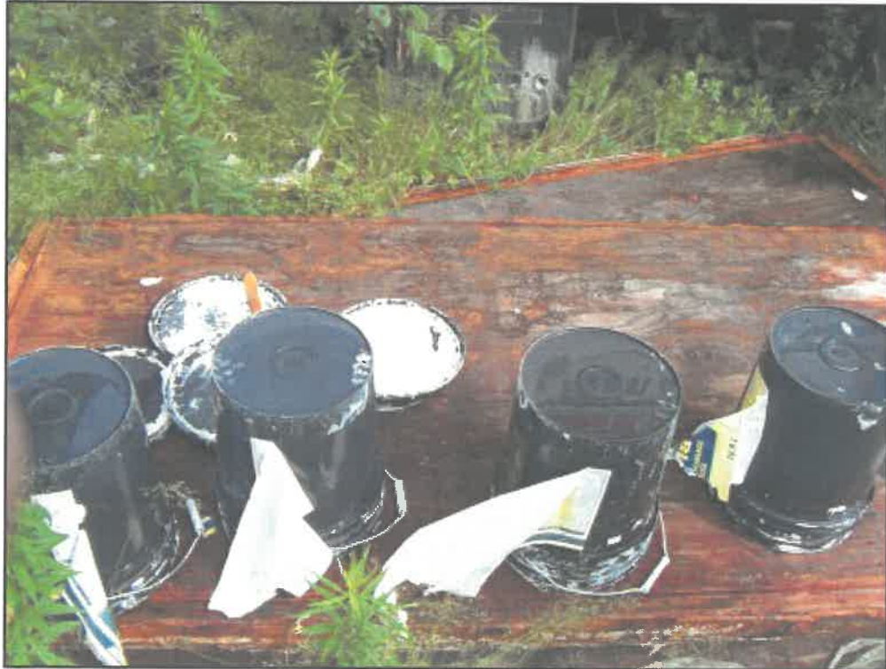
View of empty 20 L pails of fire resistive paint located on-site.