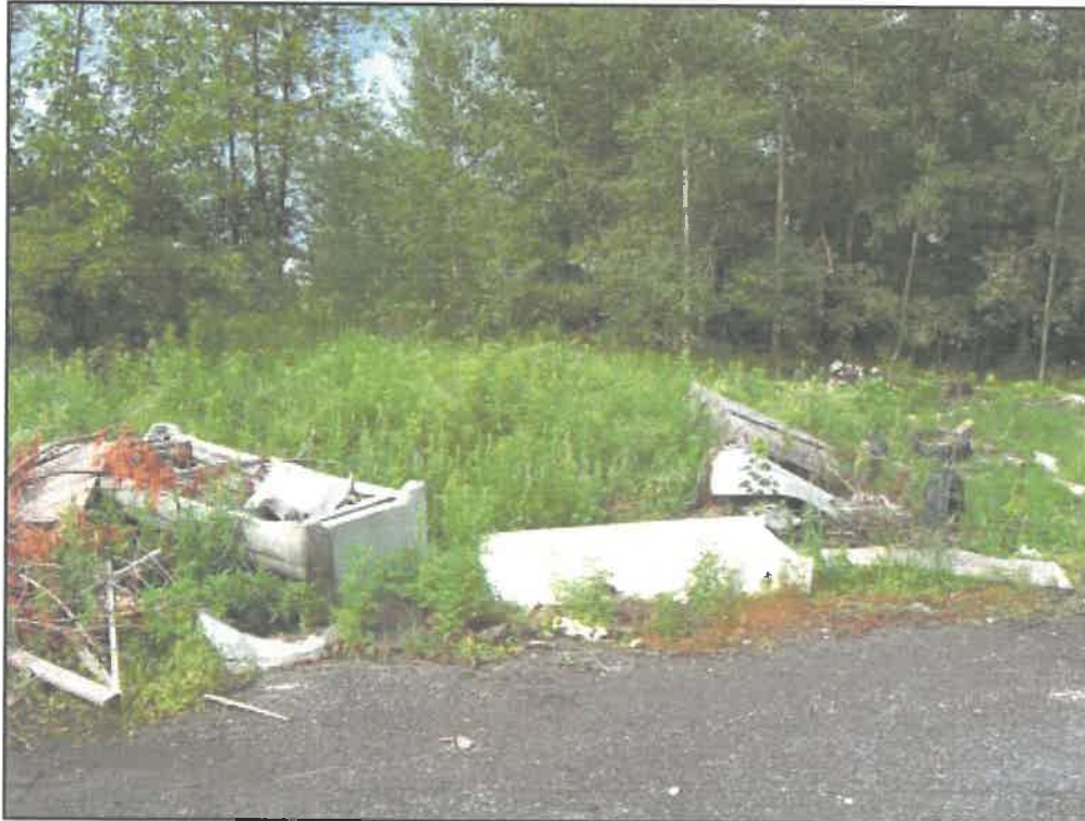
View of couches, mattress, tires, and other domestic wastes dumped on the western portion of the Site.