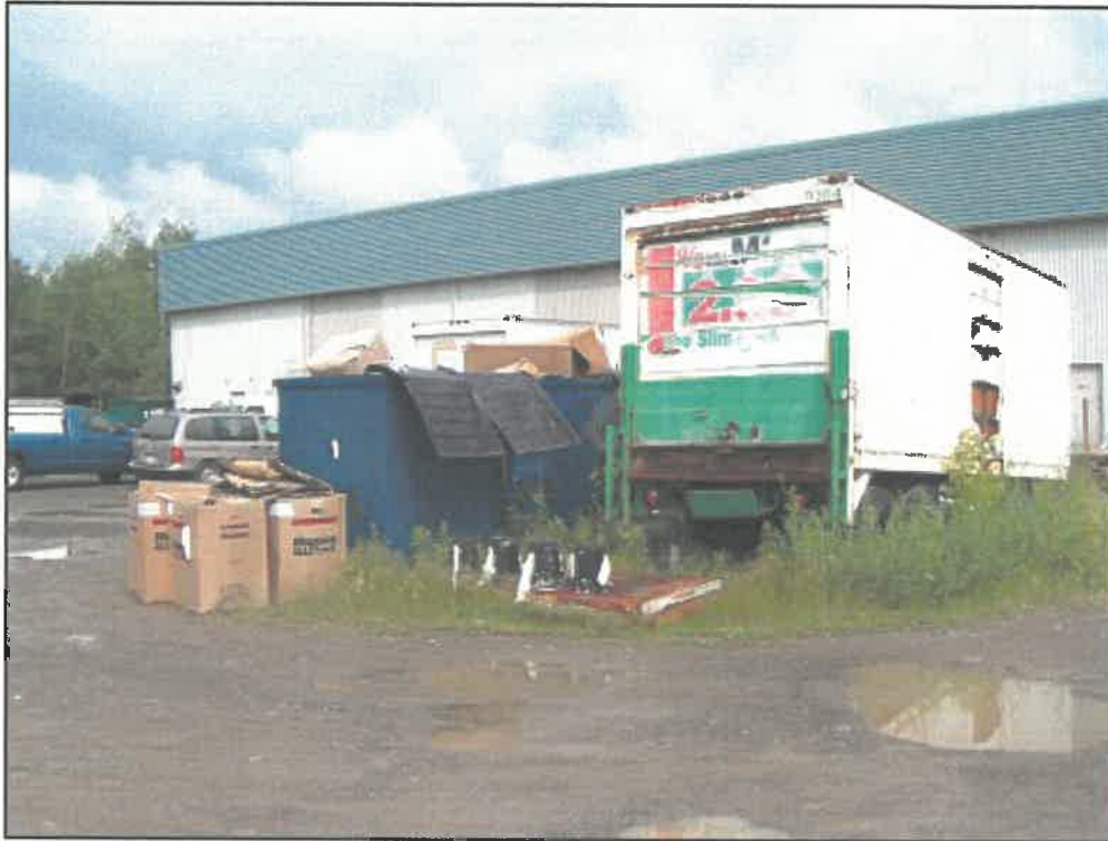
View of waste storage, trailer, two of four dumpsters, empty pails of fire resistive paint, standing water and parked vehicles on-site.