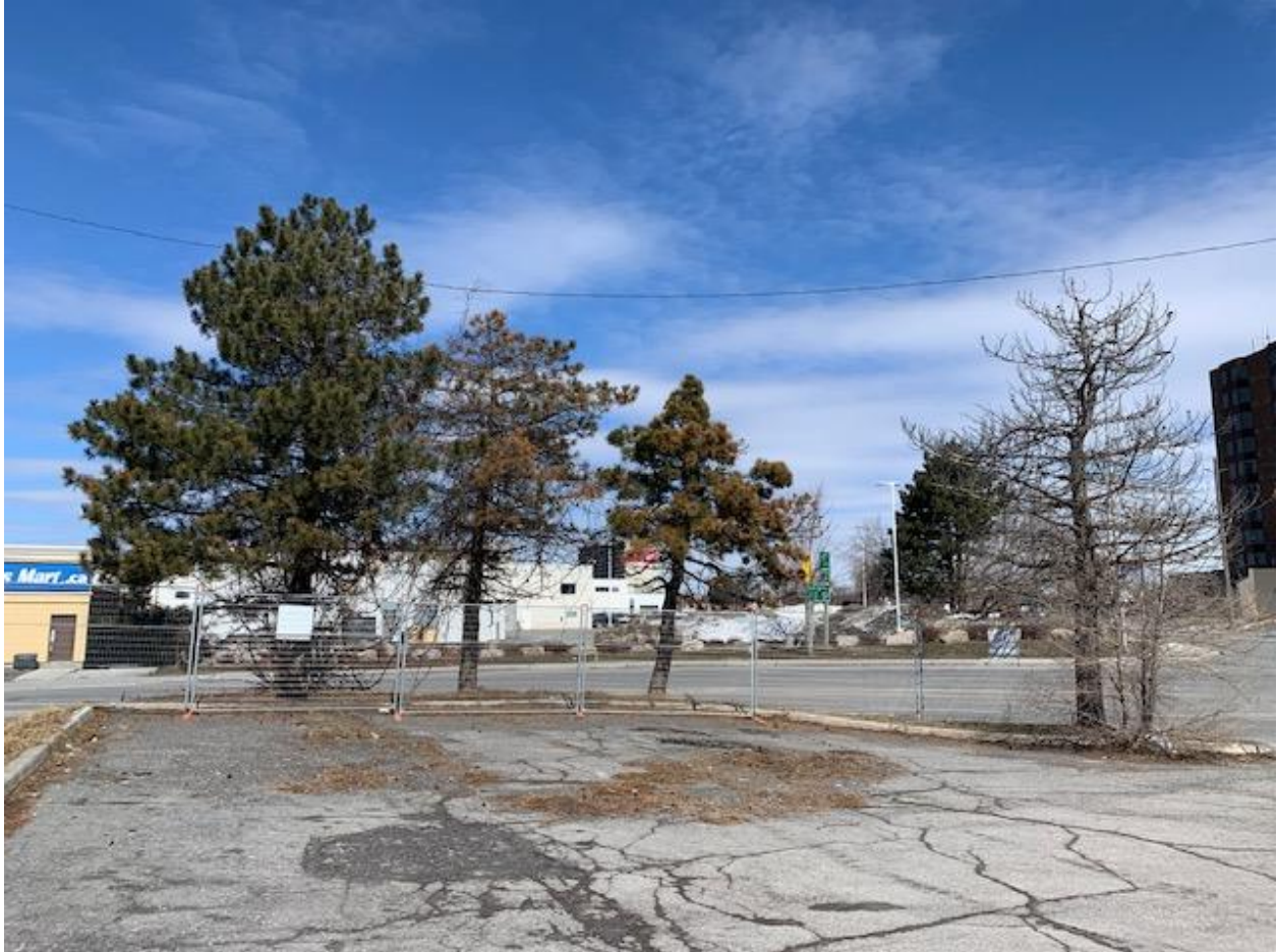
Picture 4. Trees #14-17 (right to left) at 1209 St. Laurent Boulevard