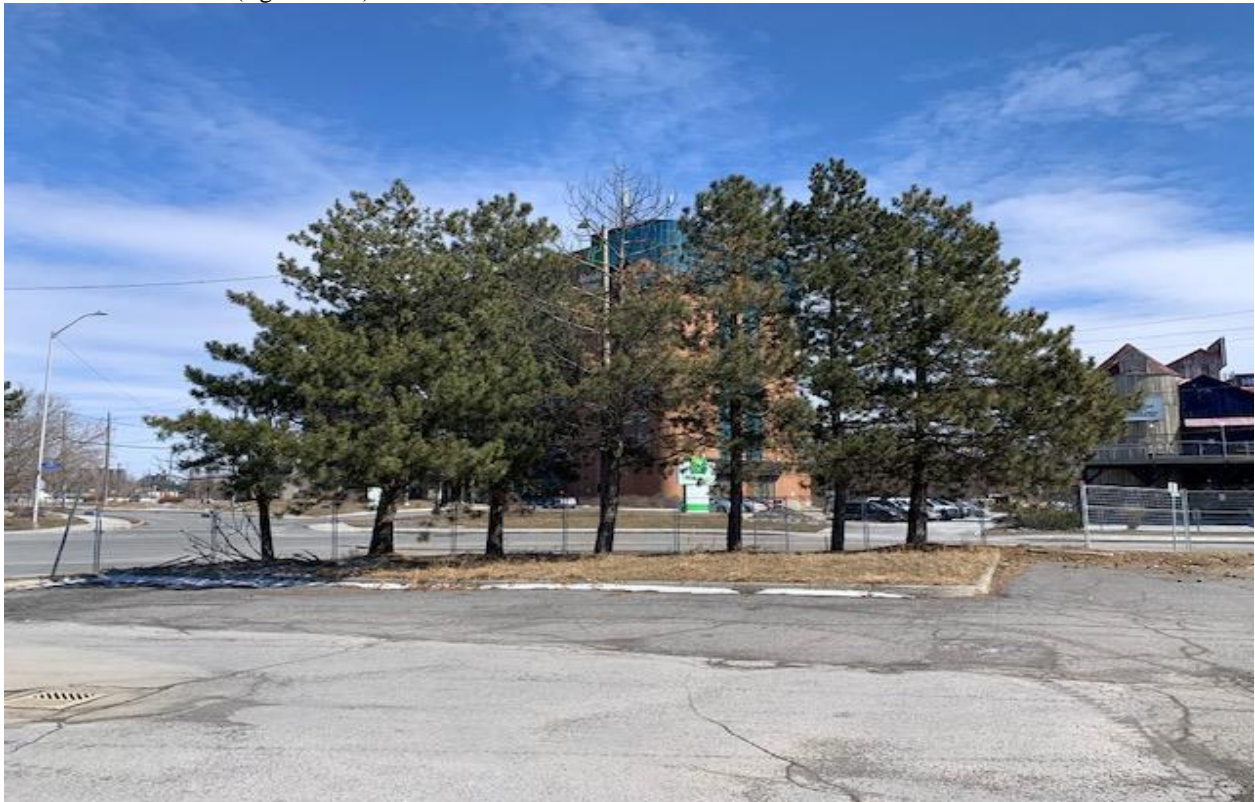
Picture 3. Trees #7-13 (right to left) at 1209 St. Laurent Boulevard