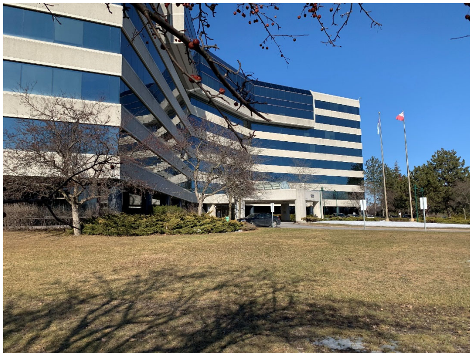
Photograph 2 – Trees and planting beds to the south