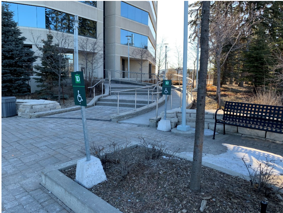
Photograph 5 – West entrance and ramp