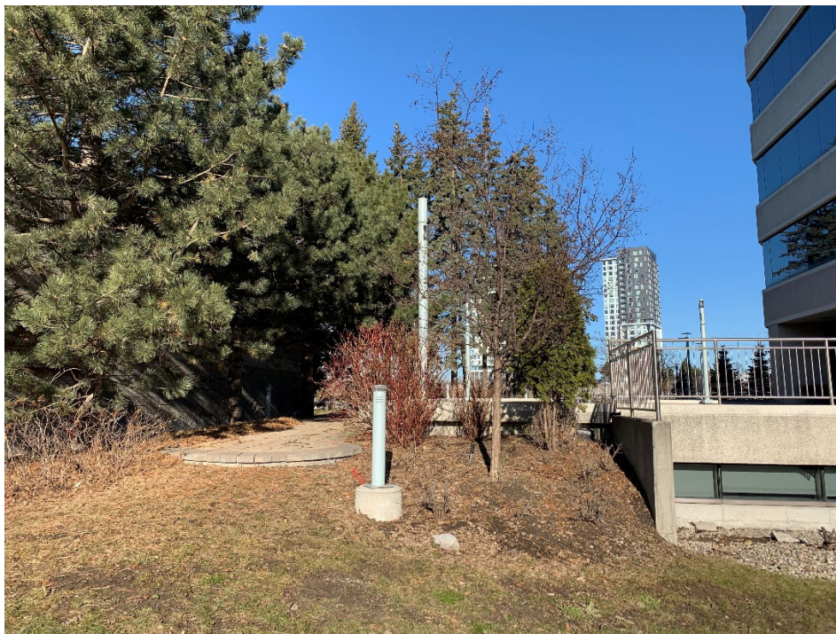
Photograph 6 – Plantings at the western terrace