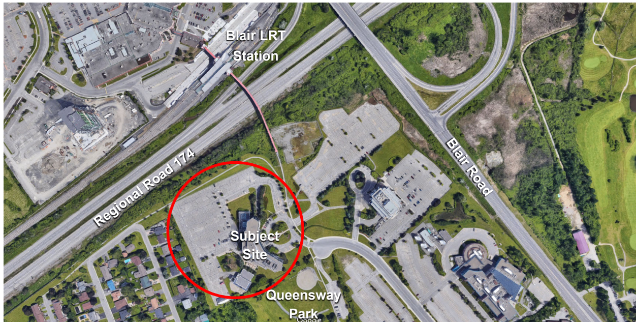
Figure 1 Study Area

The property is 3.64 hectares (8.99 acres) in size. By its location within the City of Ottawa, the project site is situated within the City of Ottawa Inner Urban Area as defined by Schedule F of the City of Ottawa's Tree Protection By-law (By-law No. 2020-340) (City of Ottawa 2021a). Under this by-law, "all trees 10 cm or more in diameter at breast height on private properties with the urban area that are over 1 hectare in size" are considered "protected trees" and may not be injured or removed without a Tree Removal Permit issued by the City of Ottawa. The City of Ottawa's Tree Protection By-law was used to framework the tree assessment and tree retention mitigation recommendations for this project. Trees 10 centimetres (cm) DBH or greater have been assessed in terms of species, sizes, and overall health conditions; as required by the City of Ottawa.