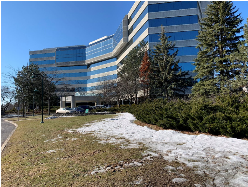
Photograph 3 – Trees and planting beds to the north