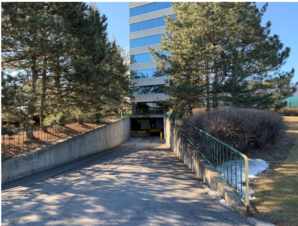
Photograph 4 – Trees and plantings beds bordering the loading ramp