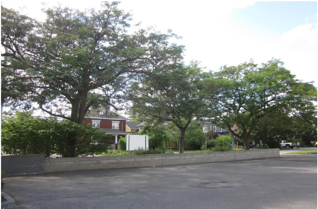
Picture 2. Trees #2, 3 and 4, honey-locusts on city lands adjacent to 403 Richmond Road