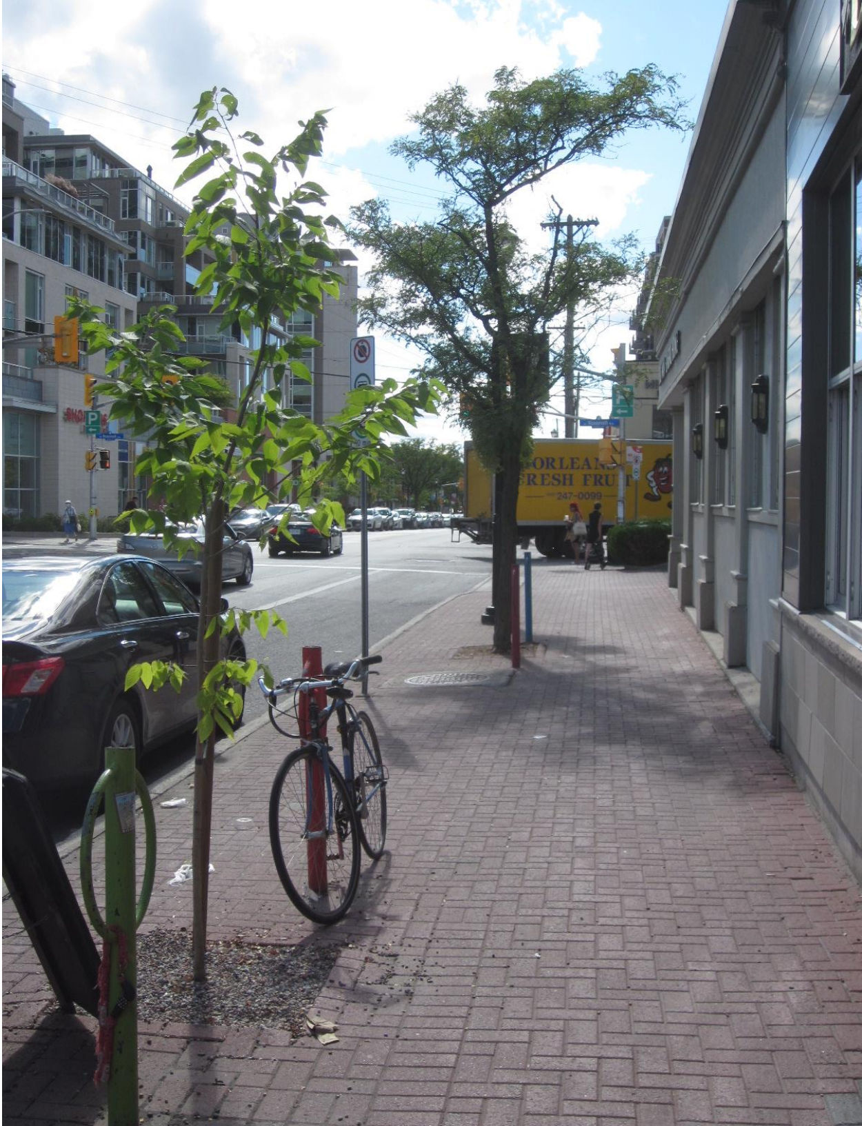
Picture 1. Tree #1, honey-locust in background on city lands adjacent to 403 Richmond Road (hackberry in foreground is considered far enough away not to be impacted)