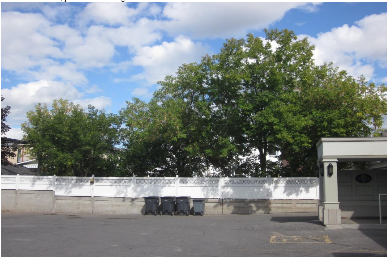
Picture 5. Trees #10, 11 and 12, neighbouring Manitoba maples located adjacent to 403 Richmond Road