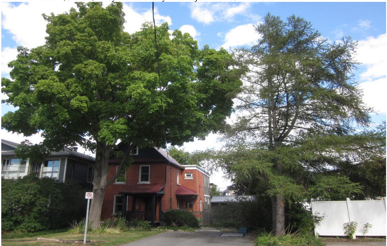
Picture 3. Trees #6, 7 and 8 (right to left), private larch and maple trees located on 403 Richmond Road