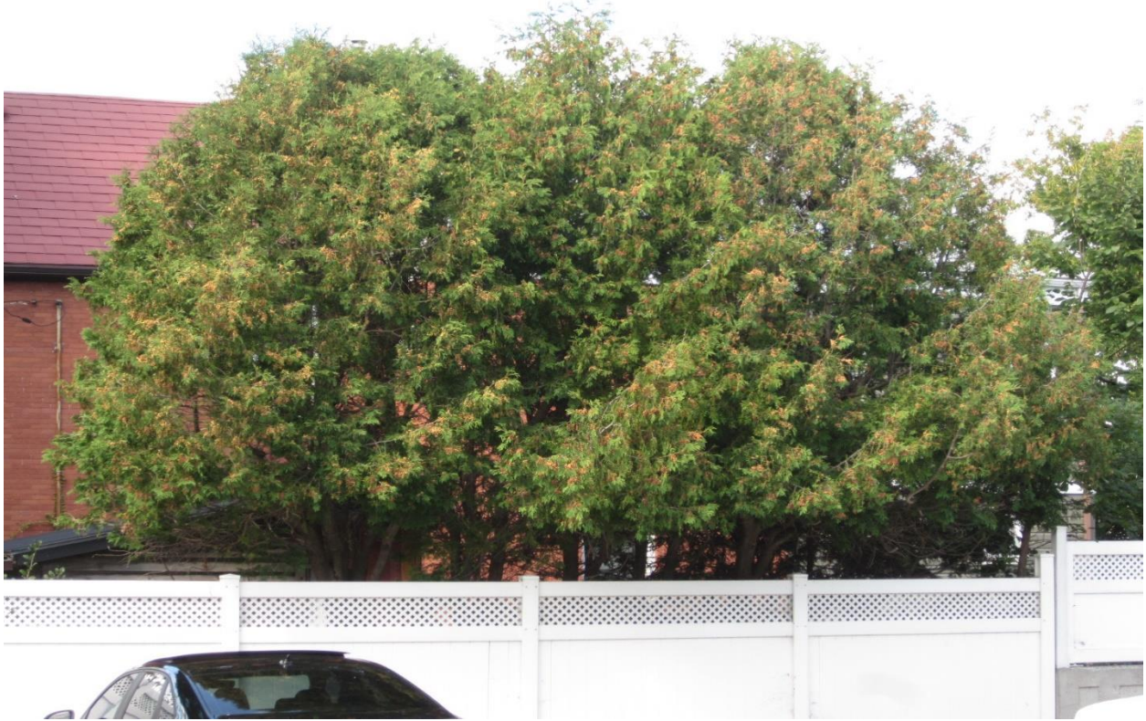
Picture 4. Tree #9, private cedar hedge located on 403 Richmond Road