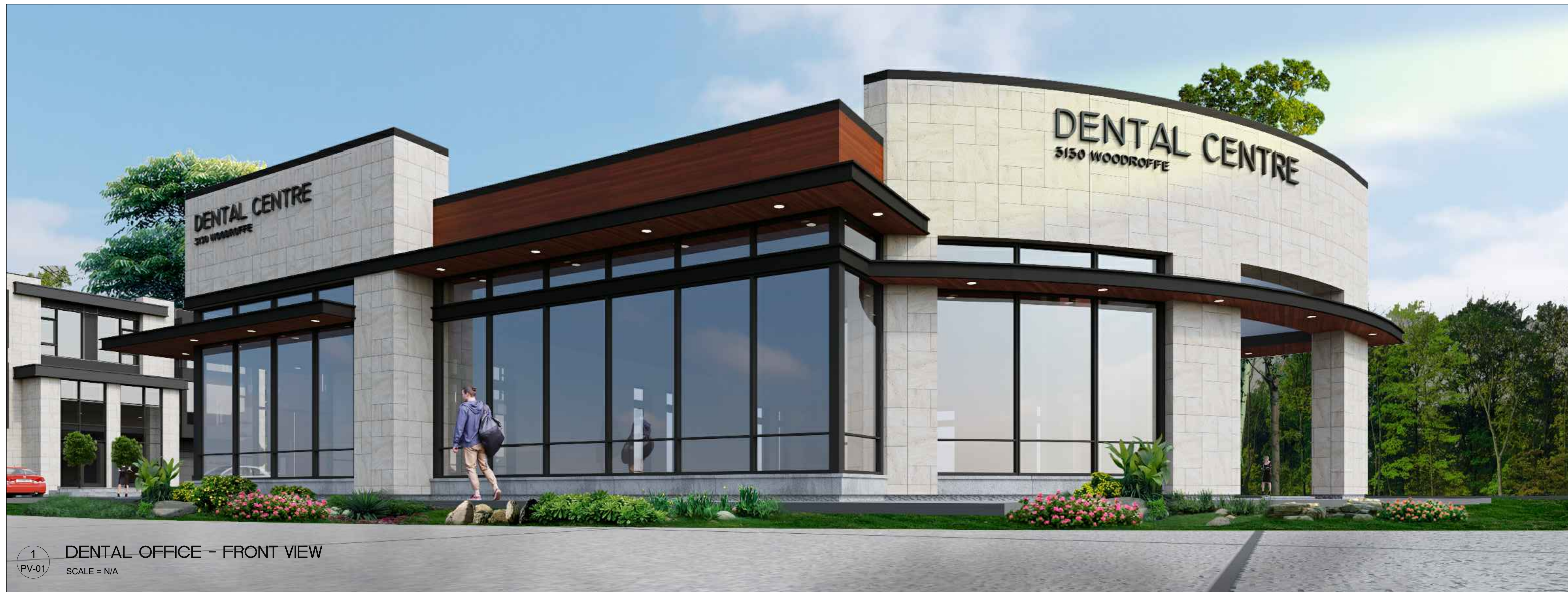
1 DENTAL OFFICE - FRONT VIEW PV-01 SCALE = N/A