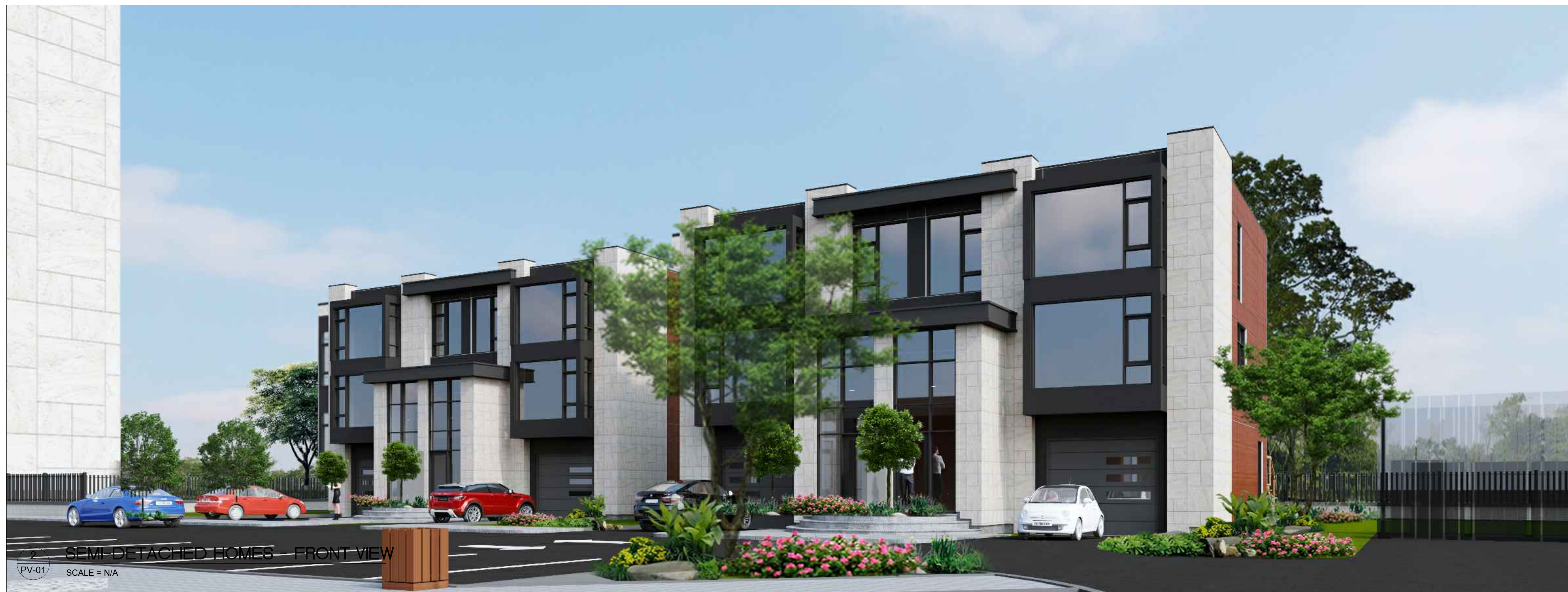
2 SEMI-DETACHED HOMES - FRONT VIEW PV-01 SCALE = N/A